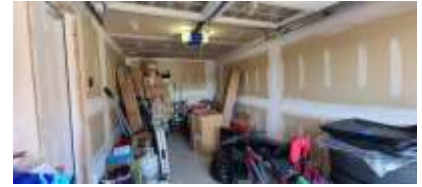
Pic. 3: Garage