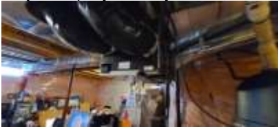
Pic. 25: HRV system