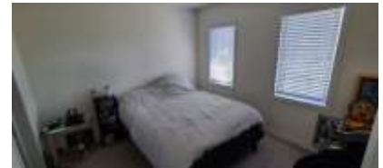
Pic. 12: Bedroom 3