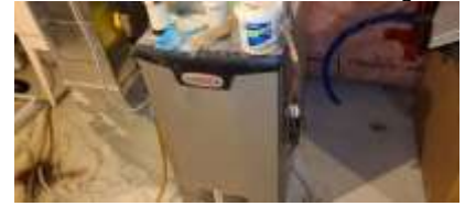
Pic. 27: Gas furnace 2015