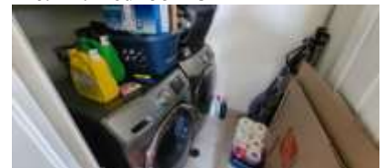
Pic. 15: Laundry