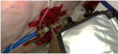
Pic. 28: Water main