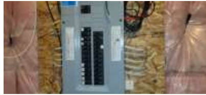
Pic. 29: 100 amp breaker panel