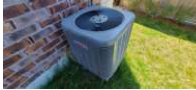
Pic. 5: AC unit 2015