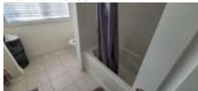
Pic. 14: 2 nd floor bath