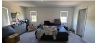
Pic. 8: Master bedroom