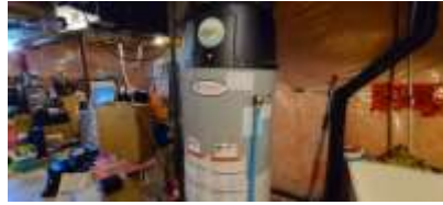
Pic. 26: Rental hot water tank 2015