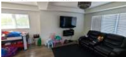
Pic. 16: Living room