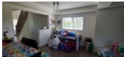
Pic. 17: Dining room