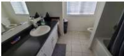
Pic. 13: 2 nd floor bath