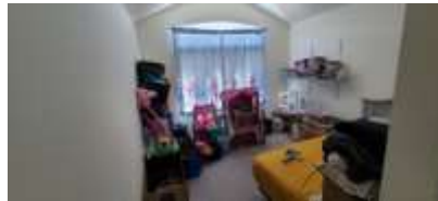
Pic. 11: Bedroom 2