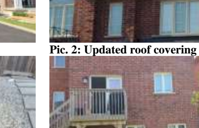
Pic. 5: Back view