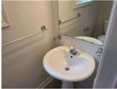
Pic. 20: Powder room