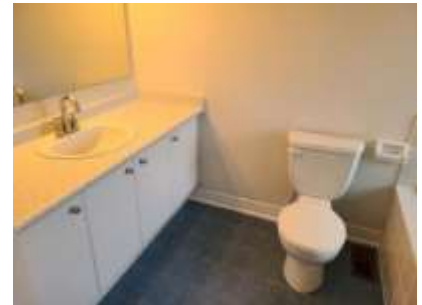
Pic. 9: Master bath