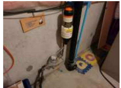
Pic. 27: Water main