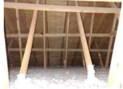
Pic. 6: Attic – upgraded insulation level