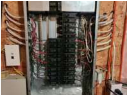
Pic. 28: 100 amp breaker panel