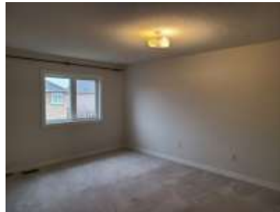
Pic. 8: Master bedroom