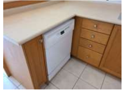
Pic. 18: Kitchen