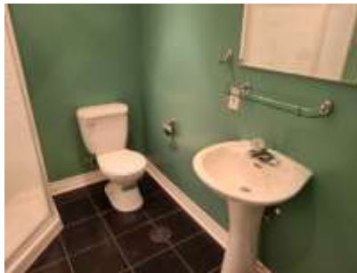
Pic. 23: Basement bath