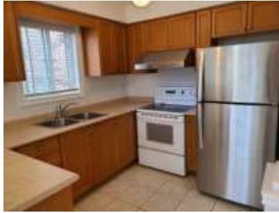
Pic. 17: Kitchen