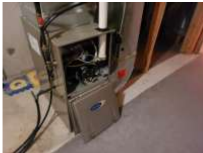
Pic. 26: Gas furnace 2017