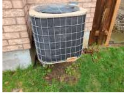
Pic. 5: Original AC 2001