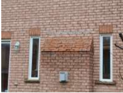
Pic. 4: Fireplace cap brick spalling in need of repairs