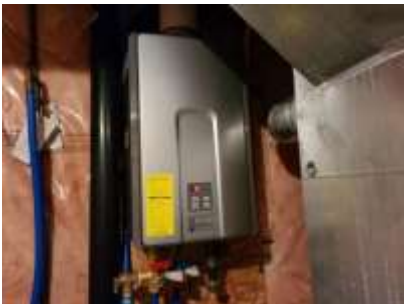
Pic. 25: Tankless hot water system 2012