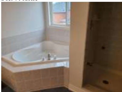
Pic. 10: Master bath