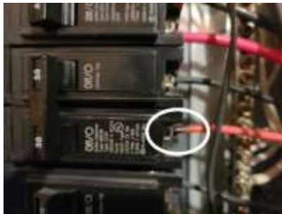
Pic. 29: Signs of overheating at dryer breaker