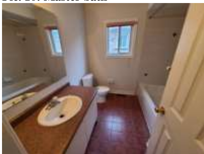
Pic. 13: 2 nd floor bath