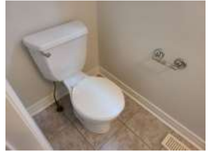
Pic. 21: Powder room