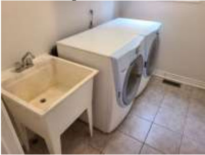
Pic. 19: Laundry