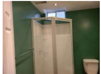
Pic. 24: Basement bath