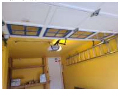
Pic. 14: Garage