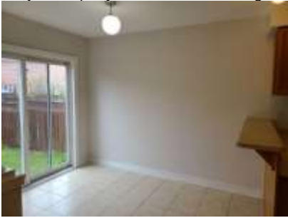
Pic. 16: Eating area