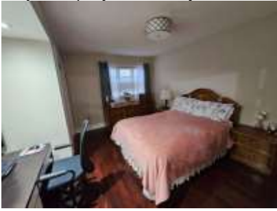
Pic. 16: Bedroom 3