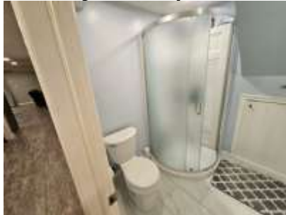
Pic. 38: Apt – Bathroom