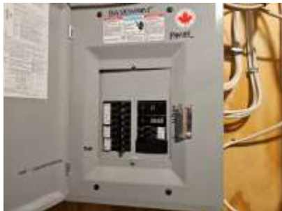
Pic. 44: 60 amp apartment pony panel