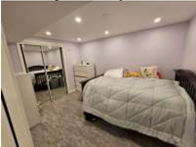
Pic. 37: Apt -Bedroom 2