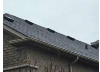
Pic. 3: Updated roof covering