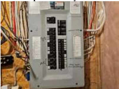
Pic. 43: 100 amp main panel