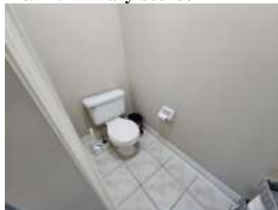
Pic. 14: Primary bathroom