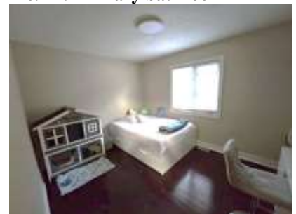
Pic. 15: Bedroom 2