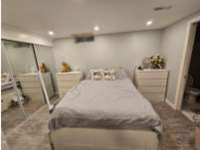
Pic. 34: Apt – Primary bedroom