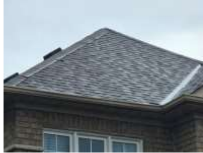
Pic. 2: Updated roof covering