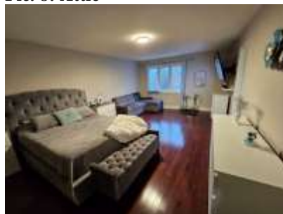
Pic. 11: Primary bedroom