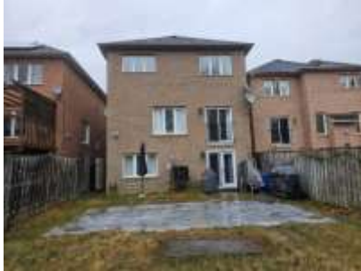
Pic. 4: Back view