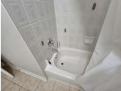
Pic. 19: 2 nd floor bathroom