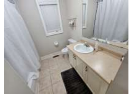
Pic. 18: 2 nd floor bathroom