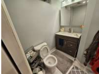
Pic. 35: Apt – Primary bathroom