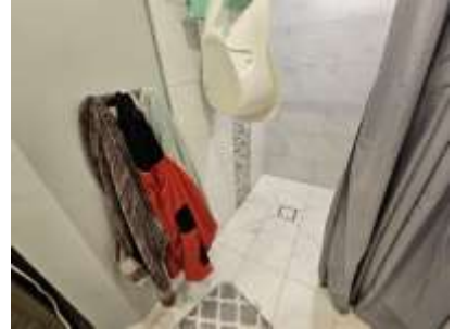
Pic. 36: Apt – Primary bathroom