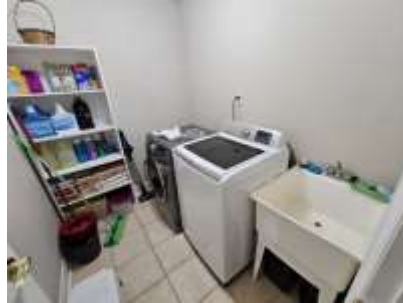
Pic. 20: 2 nd floor laundry