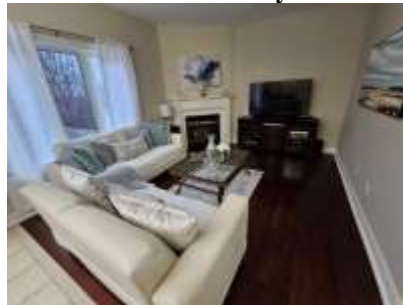
Pic. 23: Family room