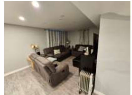
Pic. 30: Apt- Living room