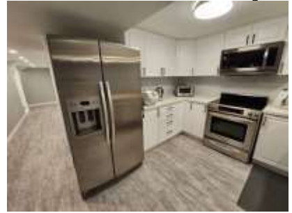
Pic. 33: Apt – Kitchen