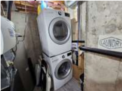
Pic. 40: Apt – Laundry