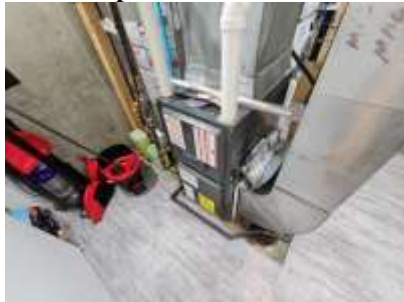
Pic. 41: Gas furnace 2019