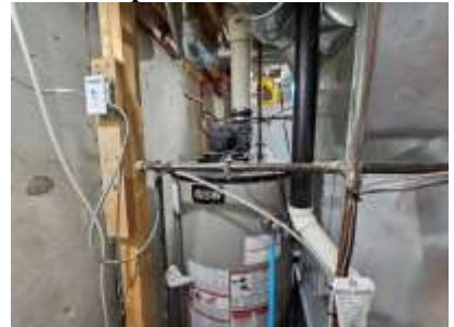
Pic. 42: Water heater 2019