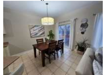
Pic. 24: Eating area