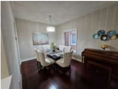
Pic. 22: Dining room