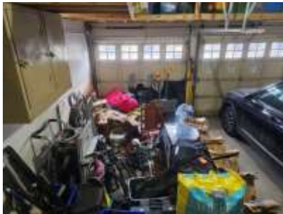
Pic. 7: Garage