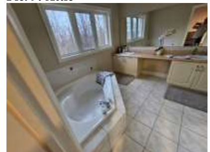
Pic. 12: Primary bathroom