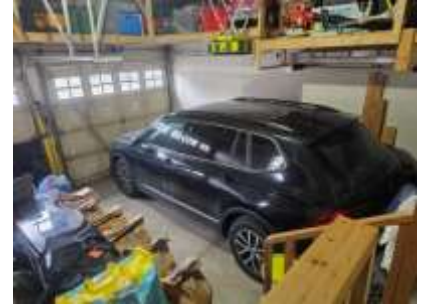
Pic. 6: Garage