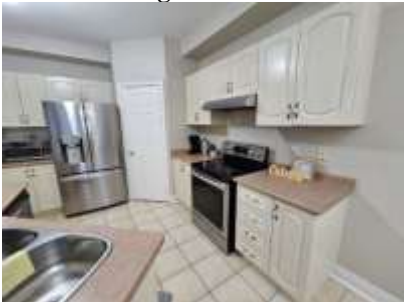
Pic. 25: Kitchen