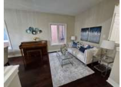
Pic. 21: Living room