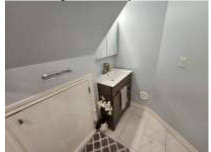
Pic. 39: Apt – Bathroom