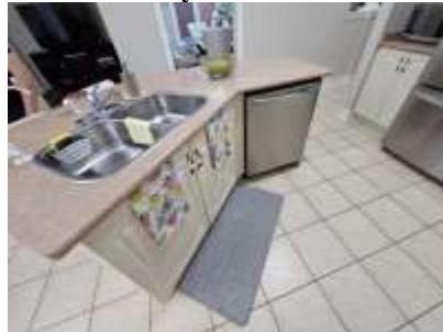
Pic. 26: Kitchen