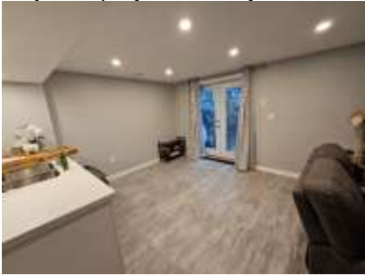
Pic. 31: Apt – Eating area