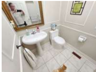
Pic. 29: Powder room