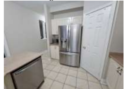
Pic. 27: Kitchen