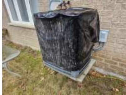
Pic. 5: AC 2009