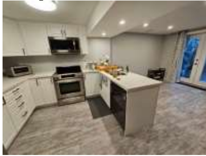
Pic. 32: Apt – Kitchen