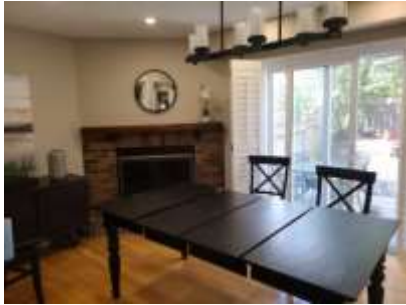
Pic. 19: Eating area