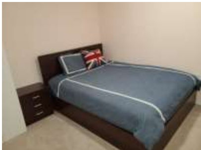
Pic. 25: Basement room