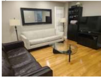
Pic. 17: Living / Dining room