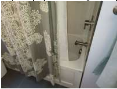
Pic. 16: 2 nd floor bath