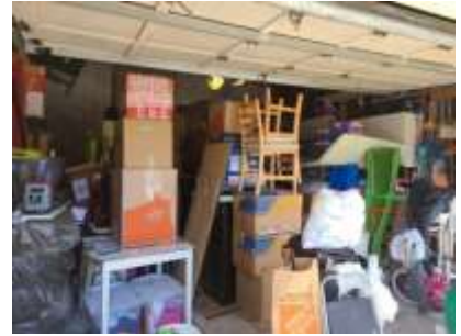
Pic. 6: Garage