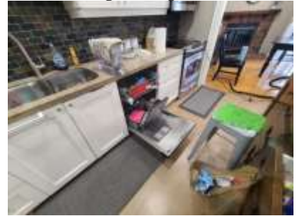
Pic. 21: Kitchen