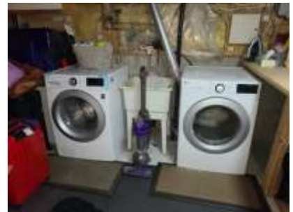
Pic. 27: Laundry