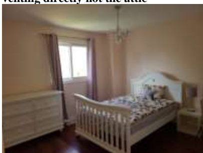
Pic. 13: Bed 2