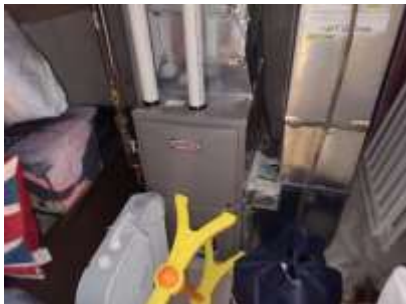
Pic. 28: New gas furnace 2020