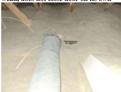
Pic. 10: Master bathroom exhaust fan venting directly not the attic