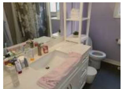
Pic. 15: 2 nd floor bath