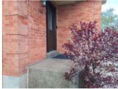
Pic. 5: Railing advised for front porch