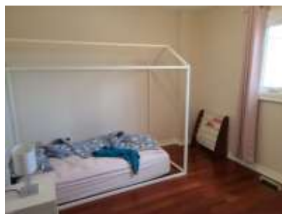
Pic. 14: Bed 3