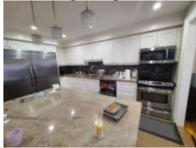
Pic. 20: Kitchen