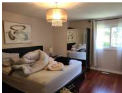
Pic. 11: Master bedroom