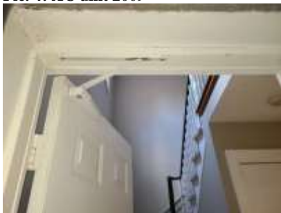
Pic. 7: Garage entry door auto closer weak, does not close door on its own