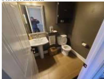
Pic. 23: Powder room