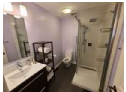
Pic. 12: Master bath