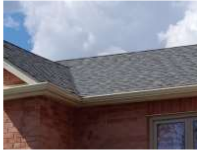
Pic. 2: Updated roof covering