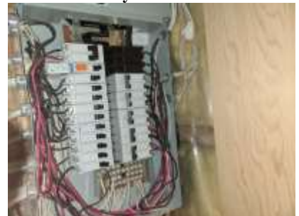
Pic. 30: 100 amp breaker panel with all copper wire