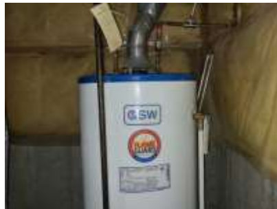
Pic. 29: Rental hot water tank 2009