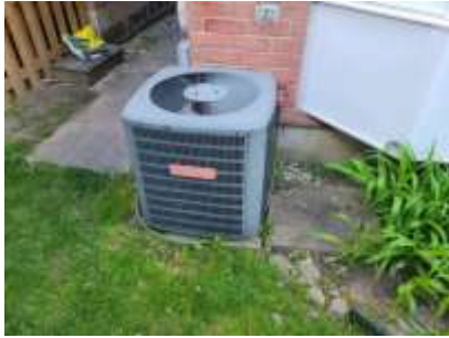
Pic. 4: AC unit 2009