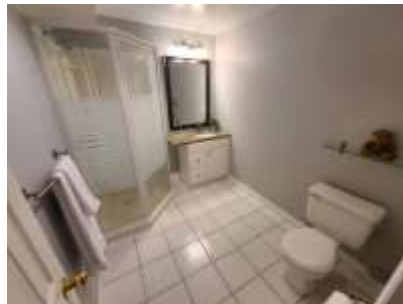
Pic. 26: Basement bath