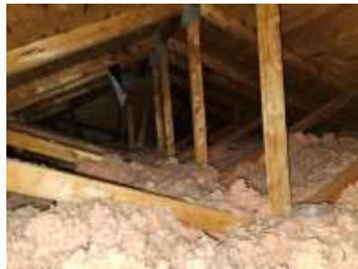
Pic. 8: Attic