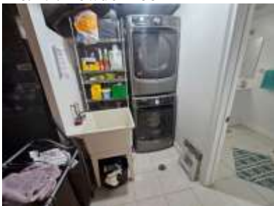
Pic. 22: Laundry