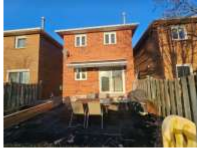
Pic. 5: Back view