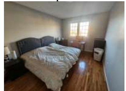
Pic. 9: Primary bedroom