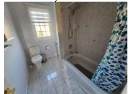
Pic. 12: 2 nd floor bathroom