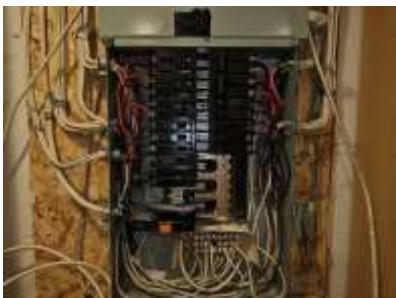
Pic. 25: 100 amp breaker panel