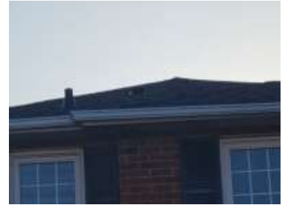
Pic. 3: Updated roof covering