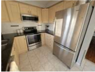
Pic. 17: Kitchen