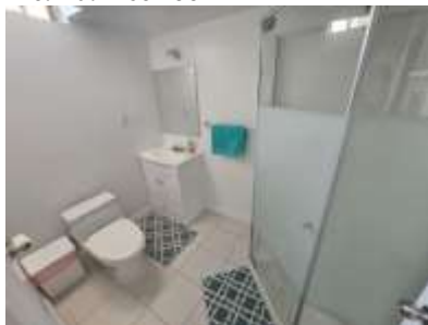
Pic. 23: Basement bathroom