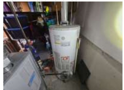
Pic. 24: Water heater and gas furnace 2008