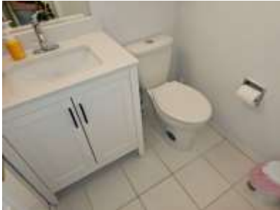
Pic. 19: Powder room