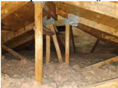
Pic. 7: Attic