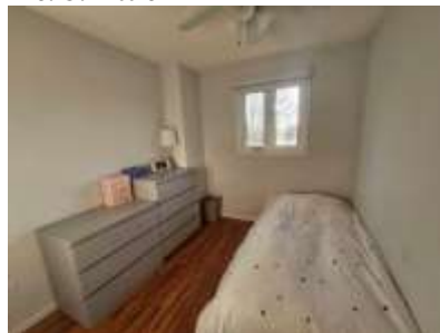
Pic. 11: Bedroom3