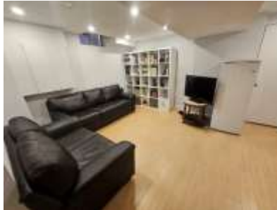
Pic. 20: Rec room