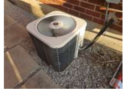
Pic. 6: AC compressor 1999