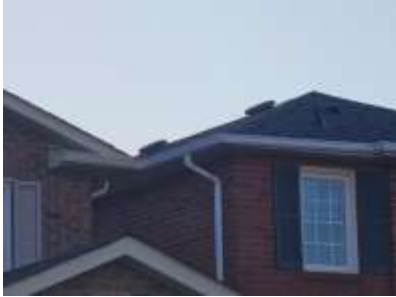
Pic. 4: Updated roof covering