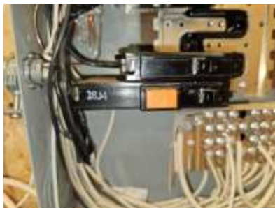
Pic. 26: GFCI breaker defective