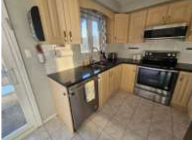
Pic. 16: Kitchen