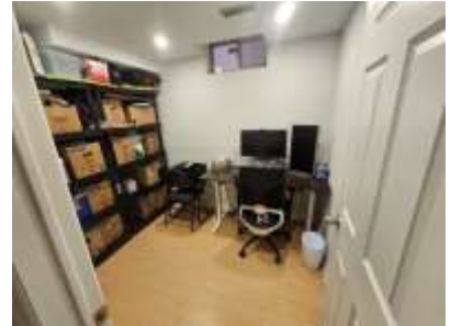
Pic. 21: Basement room