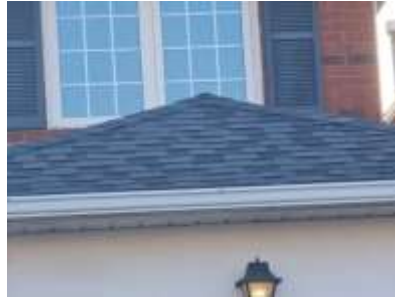
Pic. 2: Updated roof covering