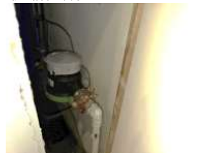
Pic. 27: Water main