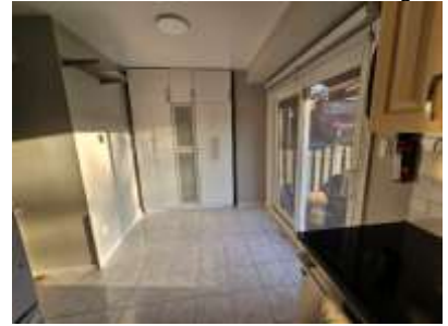
Pic. 18: Kitchen