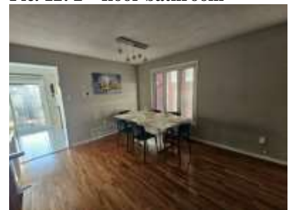
Pic. 15: Dining room