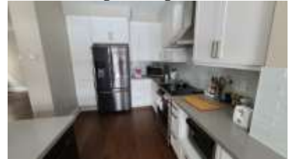
Pic. 24: Kitchen