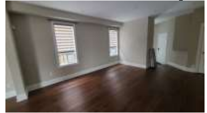
Pic. 21: Living / Dining room