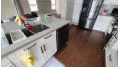
Pic. 23: Kitchen