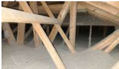
Pic. 11: Attic