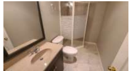
Pic. 30: Basement bath