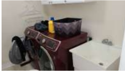
Pic. 20: Laundry