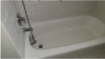
Pic. 19: 2 nd floor bath