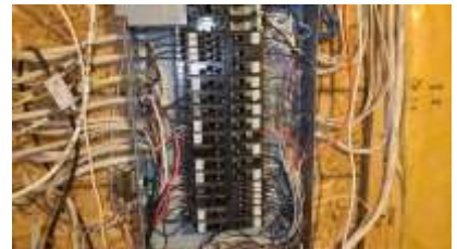
Pic. 33: 100 amp breaker panel