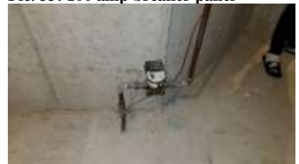
Pic. 36: Water main