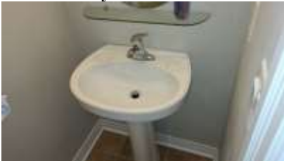
Pic. 25: Powder room