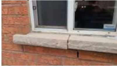
Pic. 5: Regular caulking maintenance advised