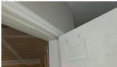
Pic. 8: Auto closer needed for garage entry door