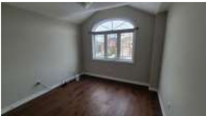
Pic. 16: Bed 3