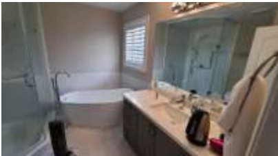
Pic. 13: Master bath