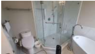
Pic. 14: Master bath