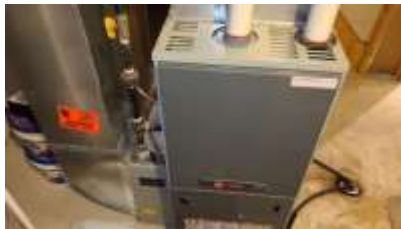
Pic. 32: Gas furnace 2014