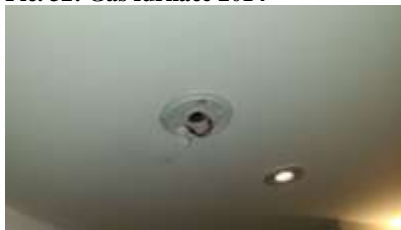
Pic. 35: Missing smoke detector in basement