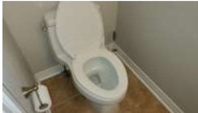
Pic. 26: Powder room