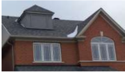
Pic. 2: Update roof covering