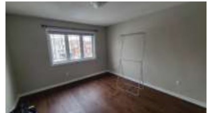
Pic. 15: Bed 2