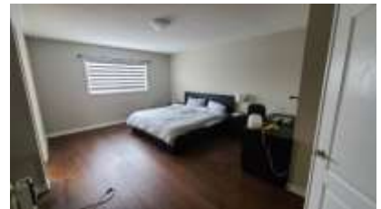
Pic. 12: Master bedroom