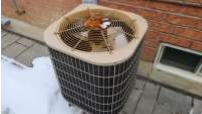
Pic. 4: AC unit 2004