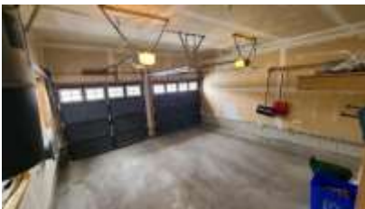
Pic. 7: Garage