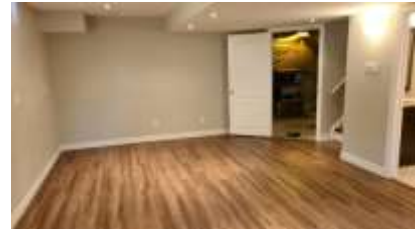
Pic. 27: Rec room