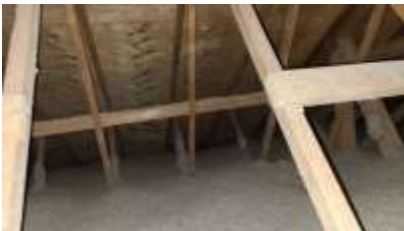
Pic. 10: Attic