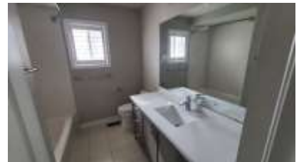
Pic. 18: 2 nd floor bath