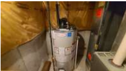
Pic. 31: Hot water tank 2021