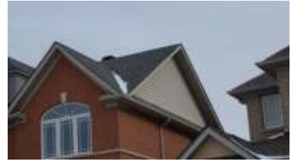
Pic. 3: Updated roof covering