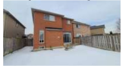
Pic. 6: Back view