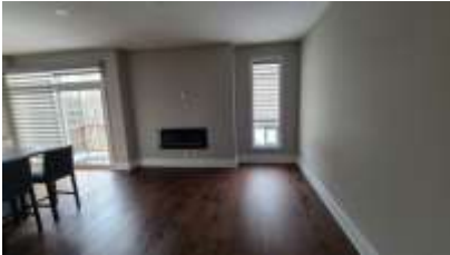
Pic. 22: Family room