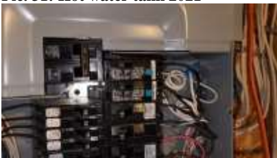
Pic. 34: One ARFC breaker will not trip and needs to be replaced