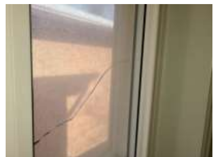
Pic. 12: Cracked window in bathroom