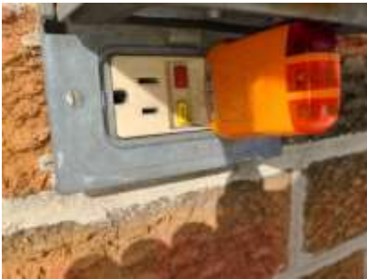
Pic. 4: Rear GFCI outlet needs replacement