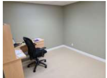
Pic. 27: Basement room