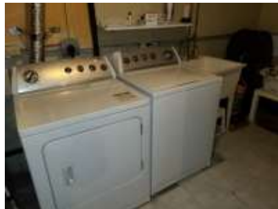
Pic. 29: Laundry