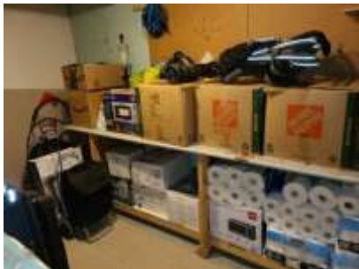
Pic. 28: Storage room