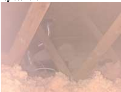
Pic. 7: Exhaust vent pipes in attic should be insulated