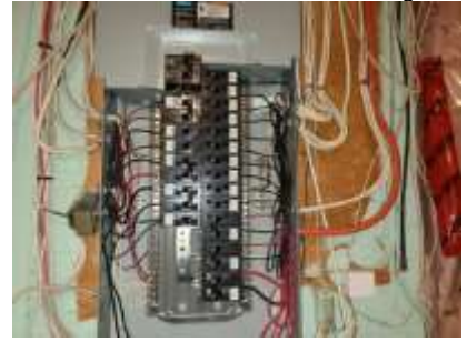
Pic. 33: 100 amp breaker panel with all copper wire