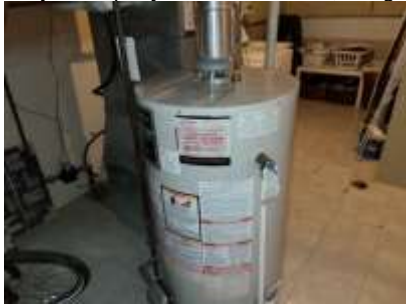
Pic. 31: Rental hot water tank