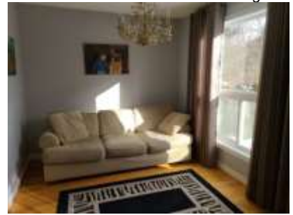
Pic. 18: Dining room