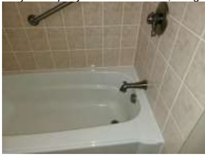
Pic. 16: 2 nd floor bath