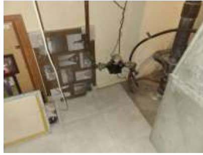
Pic. 32: Water main