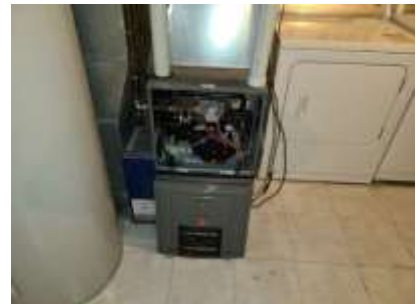
Pic. 30: Gas furnace 2015