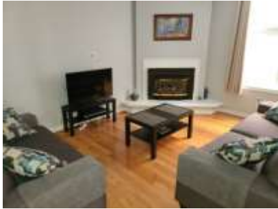
Pic. 19: Family room