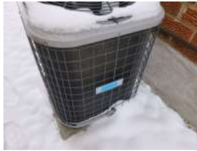
Pic. 2: AC unit 2009