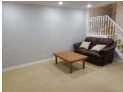
Pic. 26: Rec room