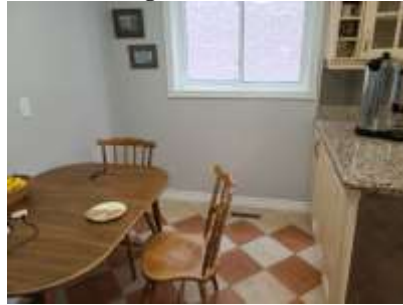
Pic. 20: Eating area