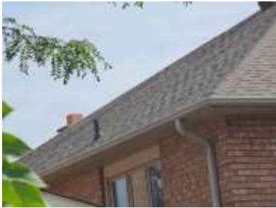
Pic. 4: Updated roof covering