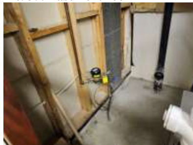
Pic. 38: Water main