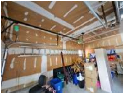
Pic. 10: Garage