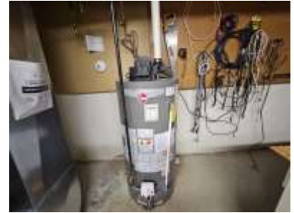
Pic. 36: Hot water tank 2021