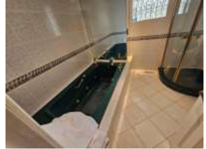
Pic. 21: 2 nd floor bathroom – whirlpool tub would not start