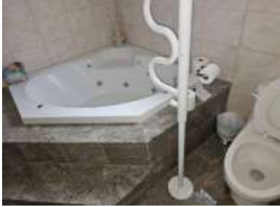
Pic. 16: Primary bathroom