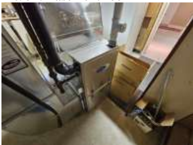
Pic. 37: Gas furnace 2020