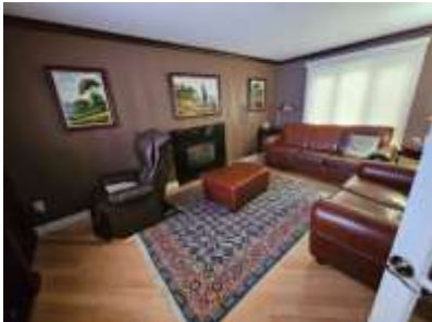
Pic. 25: Family room