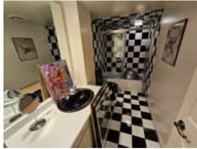
Pic. 32: Basement bathroom