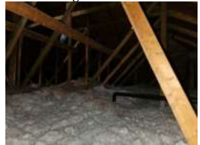
Pic. 12: Attic