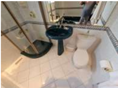
Pic. 22: 2 nd floor bathroom