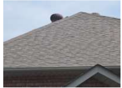
Pic. 3: Updated roof covering