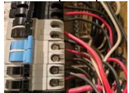
Pic. 42: Double tapped breaker