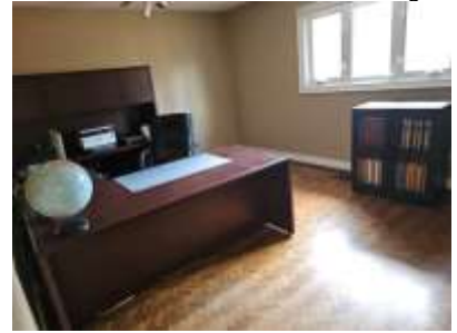
Pic. 18: Bedroom 2