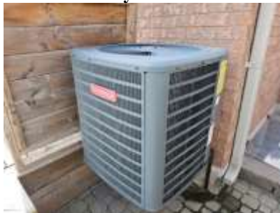
Pic. 8: AC unit 2013