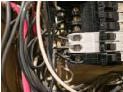
Pic. 40: Double tapped breaker