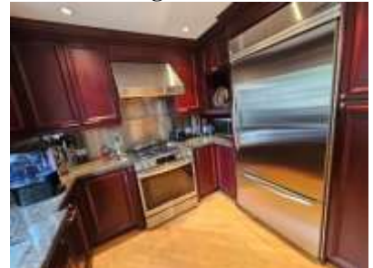
Pic. 27: Kitchen