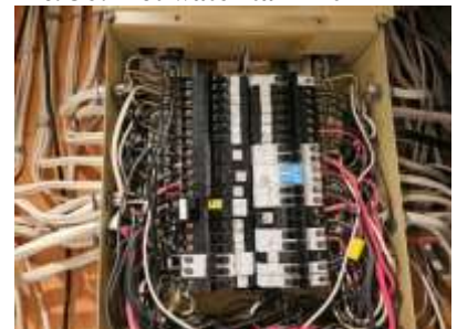
Pic. 39: 200 amp breaker panel