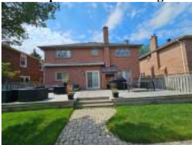
Pic. 7: Back view