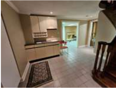
Pic. 34: Basement room