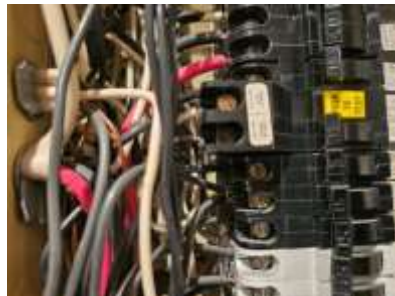
Pic. 41: Double tapped breaker