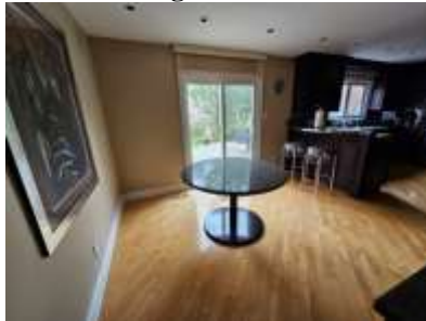
Pic. 26: Eating area