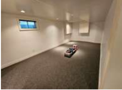
Pic. 31: Basement room