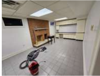
Pic. 35: Basement room