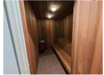
Pic. 33: Sauna