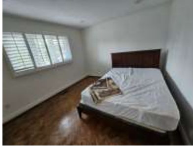
Pic. 20: Bedroom 4