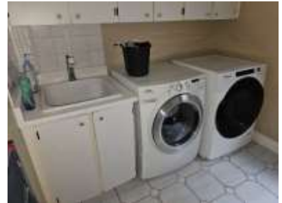
Pic. 30: Laundry