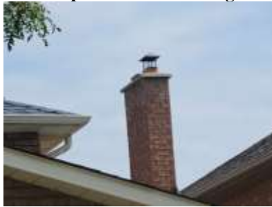
Pic. 5: Chimney