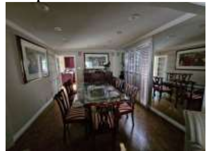
Pic. 24: Dining room