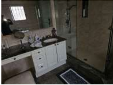
Pic. 17: Primary bathroom