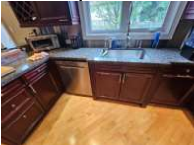
Pic. 28: Kitchen