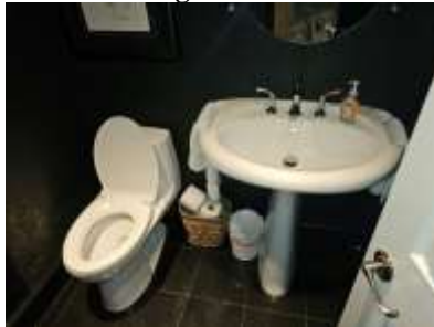
Pic. 29: Powder room