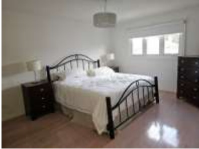
Pic. 19: Bedroom 3