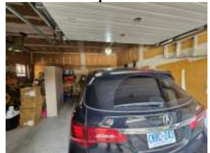
Pic. 9: Garage