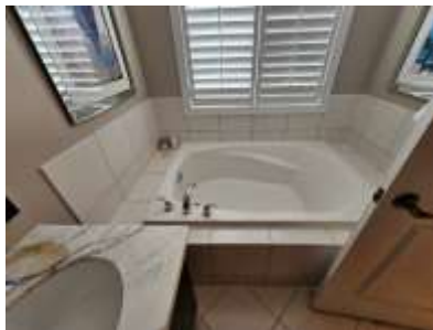
Pic. 11: Primary bathroom