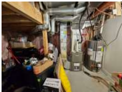
Pic. 29: Utility room