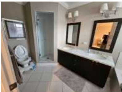
Pic. 10: Primary bathroom