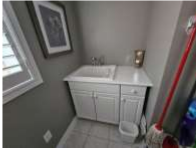
Pic. 17: Laundry