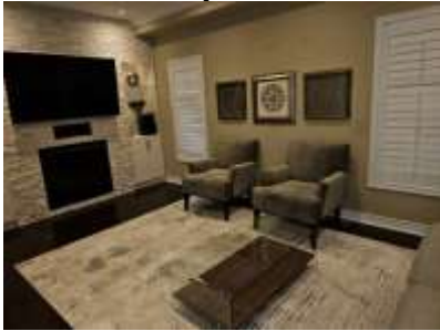
Pic. 19: Family room