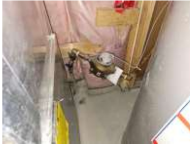
Pic. 32: Water main