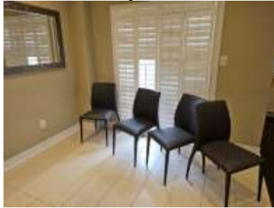
Pic. 20: Eating area