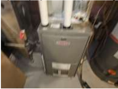
Pic. 31: Gas furnace 2011