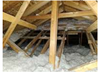
Pic. 6: Attic