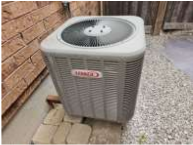
Pic. 4: AC unit 2011