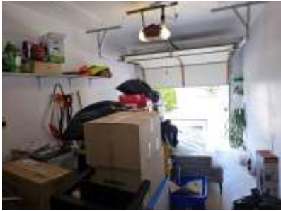
Pic. 34: Garage