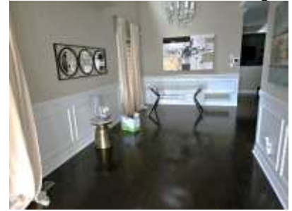
Pic. 18: Living / Dining room