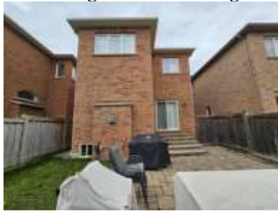
Pic. 5: Back view