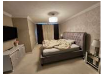
Pic. 9: Primary bedroom