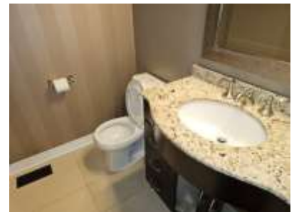
Pic. 24: Powder room