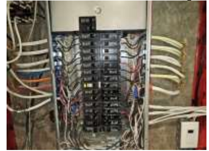
Pic. 33: 100 amp braker panel