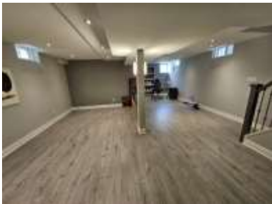
Pic. 25: Rec room