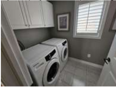
Pic. 16: Laundry