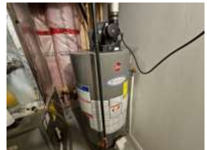
Pic. 30: Rental hot water tank 2015