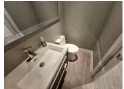
Pic. 27: Basement bathroom