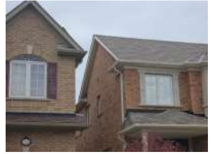
Pic. 3: Original roof covering