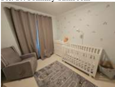
Pic. 13: Bedroom 3