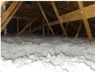
Pic. 7: Attic