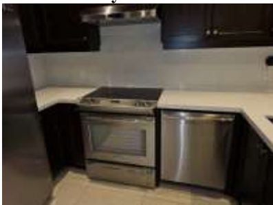
Pic. 22: Kitchen