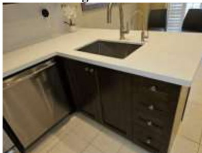
Pic. 23: Kitchen