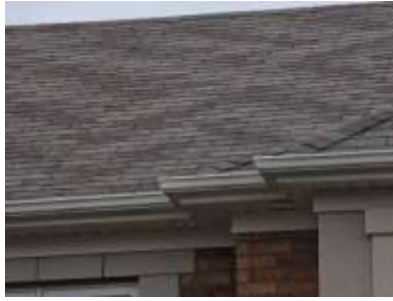
Pic. 2: Original roof covering