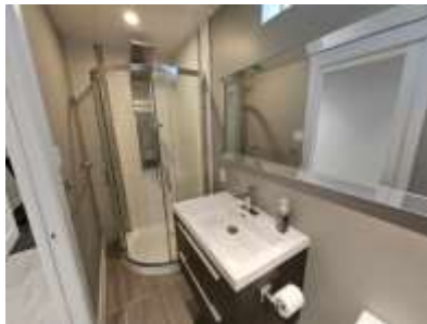
Pic. 26: Basement bathroom