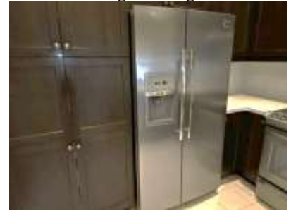
Pic. 21: Kitchen