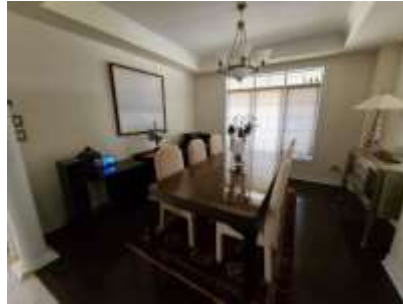
Pic. 20: Dining room