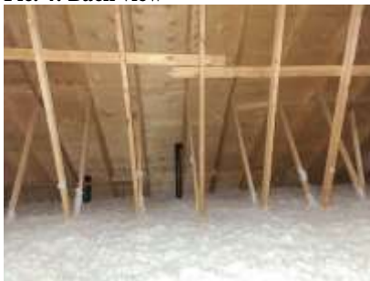
Pic. 7: Attic