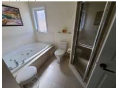
Pic. 11: Master bath