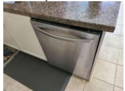
Pic. 24: Kitchen