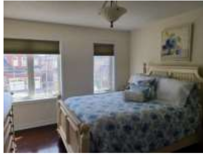
Pic. 17: Bed 5