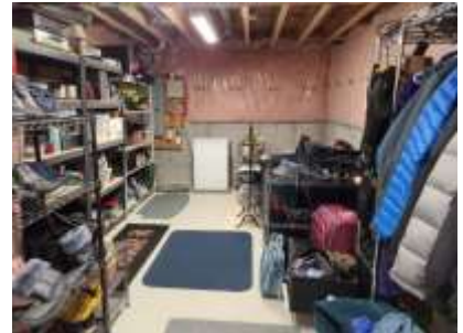
Pic. 30: Unfinished basement