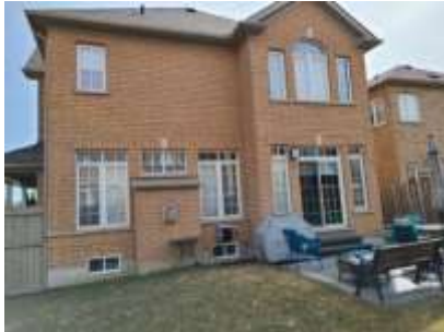
Pic. 4: Back view