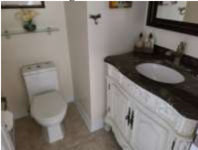
Pic. 25: Powder room