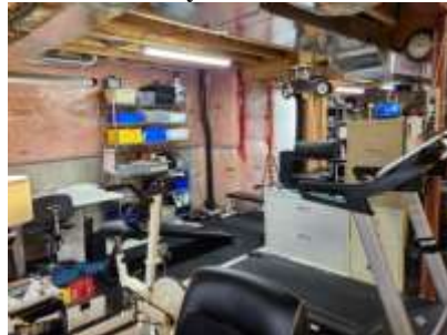
Pic. 29: Unfinished basement