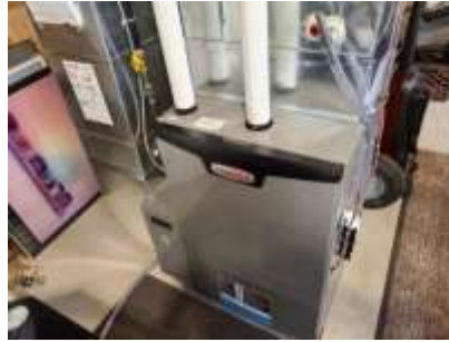
Pic. 32: Gas furnace 2020