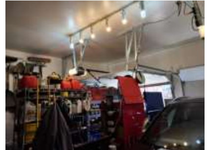
Pic. 6: Garage