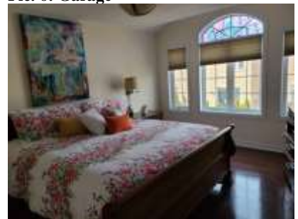
Pic. 9: Master bedroom