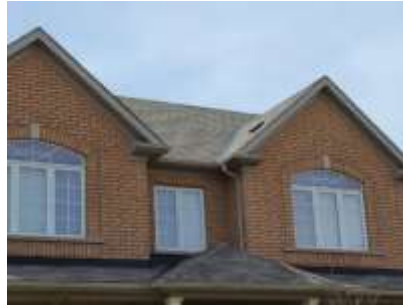
Pic. 2: Roof covering