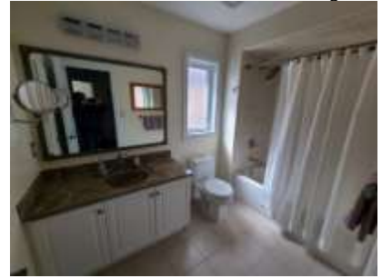
Pic. 18: 2 nd floor bath