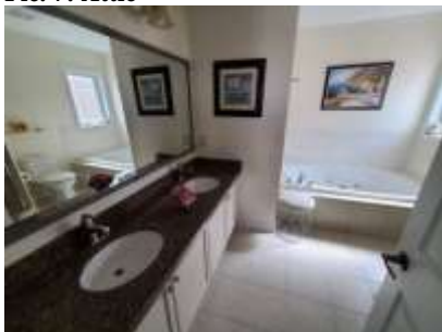
Pic. 10: Master bath