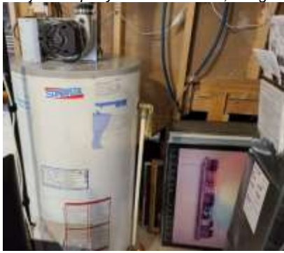
Pic. 31: Owner hot water tank 2009