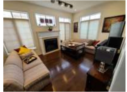
Pic. 21: Family room