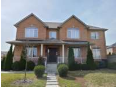
Pic. 1: Front view