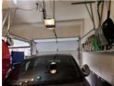
Pic. 5: Garage