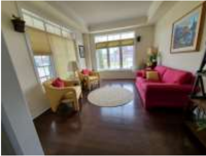
Pic. 19: Living room