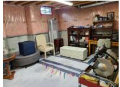
Pic. 27: Unfinished basement