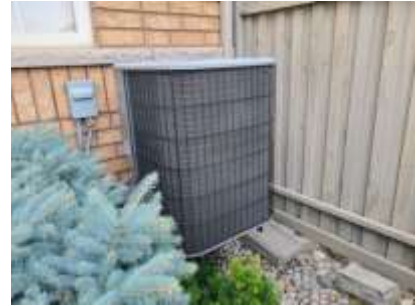
Pic. 3: AC unit 2009