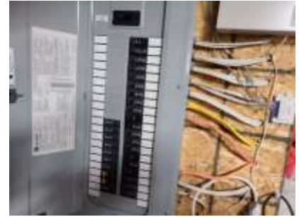
Pic. 33: 150 amp breaker panel