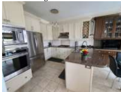
Pic. 23: Kitchen