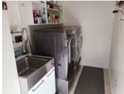
Pic. 26: Laundry