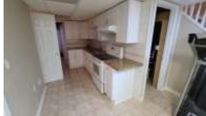
Pic. 23: Basement kitchen – far wall outlet wired incorrectly