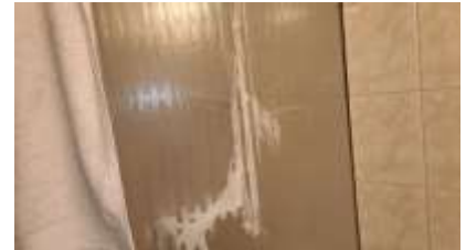
Pic. 27: Shower wall cracked