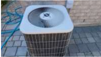
Pic. 4: AC unit 2000