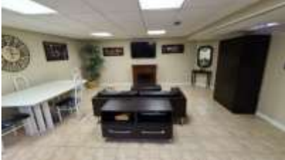
Pic. 22: Rec room