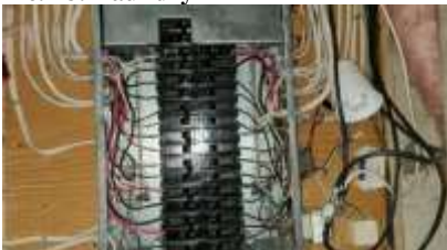
Pic. 31: 100 amp breaker panel