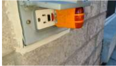
Pic. 5: Rear GFCI outlet defective