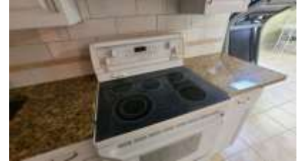
Pic. 24: Basement kitchen