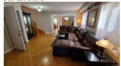
Pic. 15: Living room