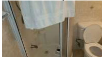
Pic. 26: Basement bathroom