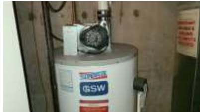
Pic. 29: Hot water tank 2010