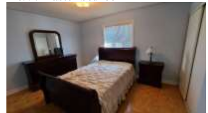
Pic. 12: Bed 2