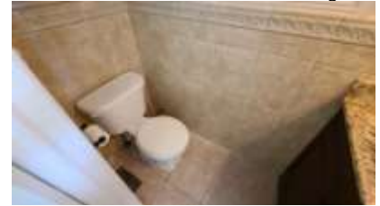
Pic. 21: Powder room