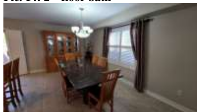
Pic. 17: Dining room