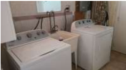
Pic. 28: Laundry