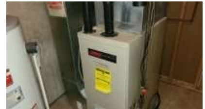
Pic. 30: Gas furnace 2001