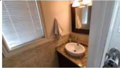
Pic. 20: Powder room