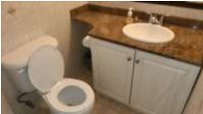
Pic. 25: Basement bathroom