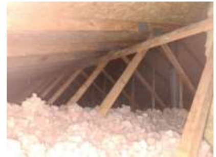
Pic. 12: Attic