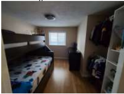
Pic. 7: Bed 2