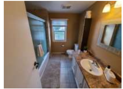
Pic. 9: 2 nd floor bath