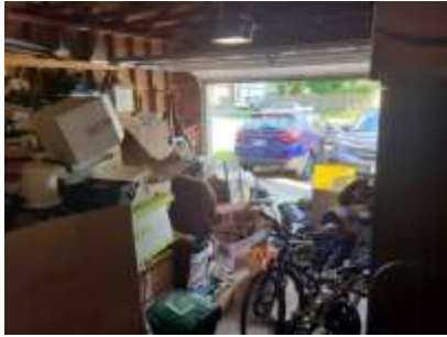
Pic. 4: Garage