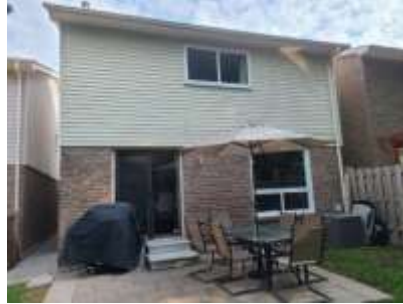
Pic. 2: Back view