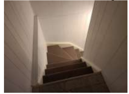
Pic. 18: Handrailing advised for basement stairwell