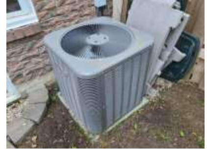
Pic. 3: AC unit 2013