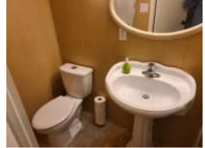
Pic. 21: Basement bath