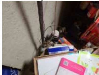
Pic. 26: Water main