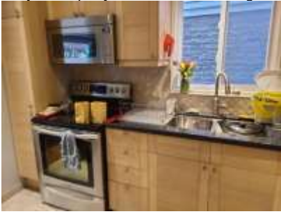
Pic. 16: Kitchen