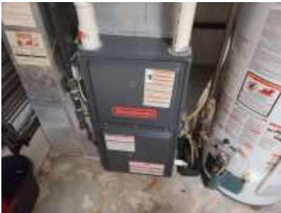
Pic. 25: Gas furnace 2015