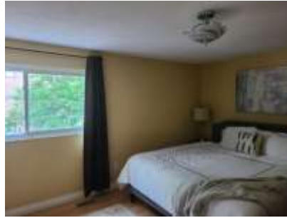
Pic. 5: Master bedroom