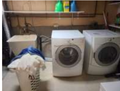
Pic. 23: Laundry