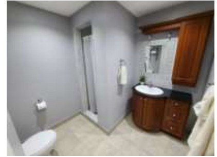
Pic. 6: Master bath