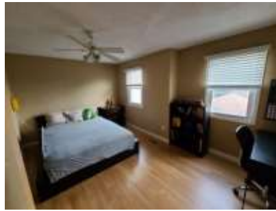
Pic. 8: Bed 3