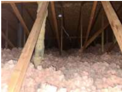
Pic. 10: Attic