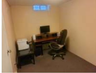
Pic. 20: Bed 4 / Office