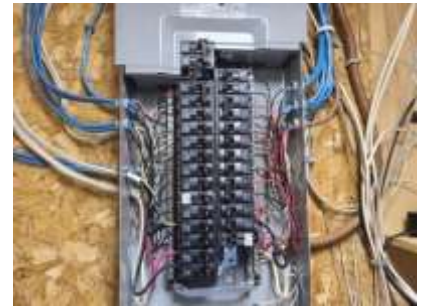
Pic. 27: 100 amp breaker panel