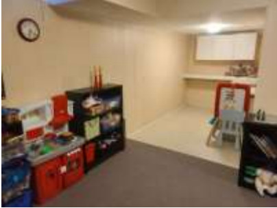
Pic. 19: Rec room