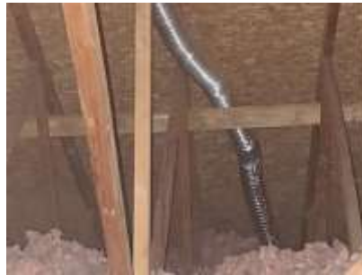
Pic. 11: Recommend installing bathroom exhaust fan vent pipe