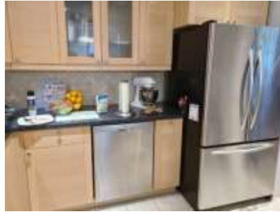
Pic. 17: Kitchen