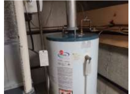
Pic. 24: Rental hot water tank