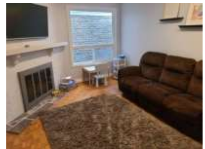
Pic. 15: Family room