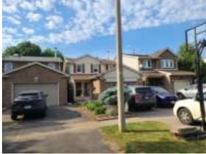
Pic. 1: Front view