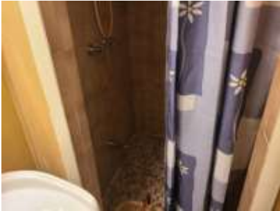
Pic. 22: Basement bath