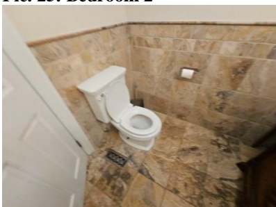
Pic. 28: Ground level bathroom