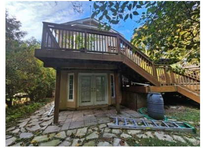
Pic. 6: Back view