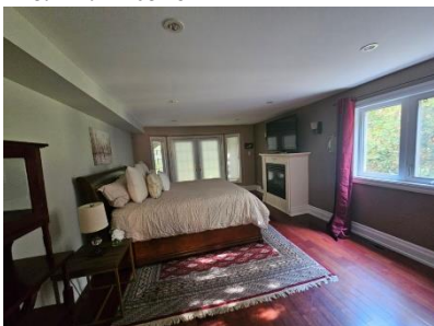
Pic. 25: Bedroom 2