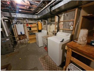
Pic. 31: Laundry