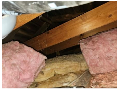
Pic. 11: Attic