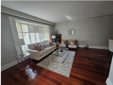
Pic. 19: Living room