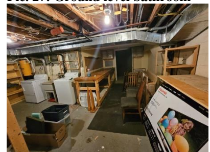
Pic. 30: Utility room