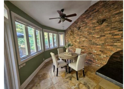
Pic. 21: Eating area