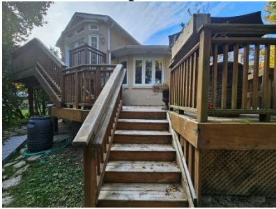
Pic. 7: Back view