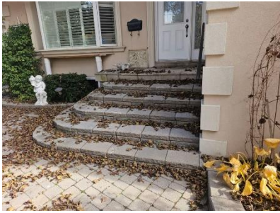
Pic. 4: Front steps