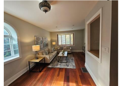
Pic. 18: Den