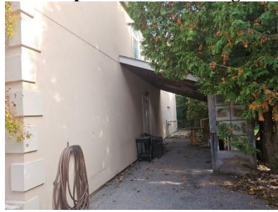
Pic. 5: Car port