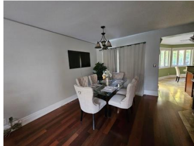
Pic. 20: Dining room