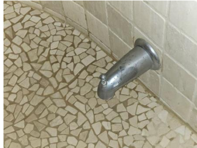
Pic. 17: Shower water diverter seized