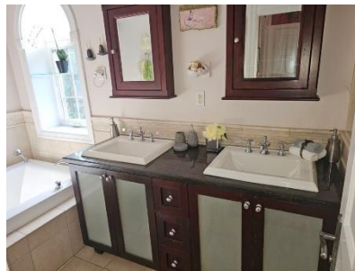
Pic. 14: 2 nd floor bathroom