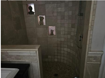
Pic. 16: 2 nd floor bathroom