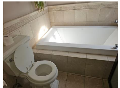
Pic. 15: 2 nd floor bathroom