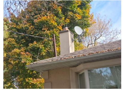
Pic. 3: Chimney