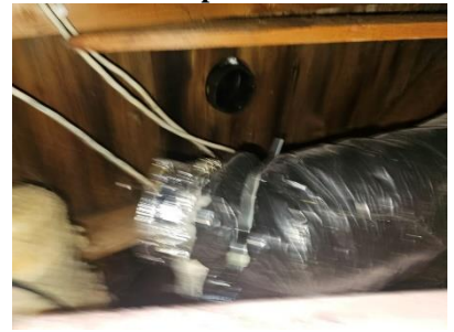
Pic. 12: Exhaust vent pipe not connected to roof vent