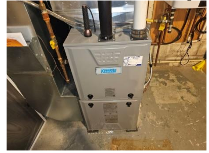
Pic. 33: Gas furnace 2021