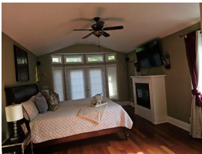
Pic. 13: Primary bedroom