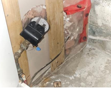
Pic. 34: Water main