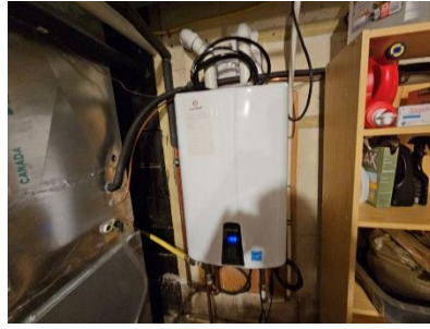
Pic. 32: Tankless hot water system 2019