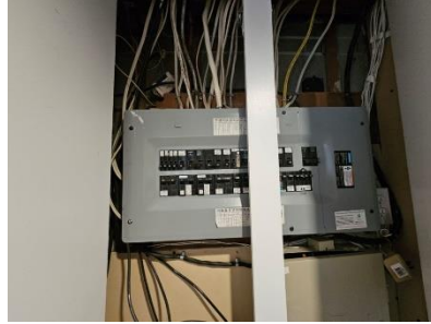
Pic. 35: 100 amp breaker panel