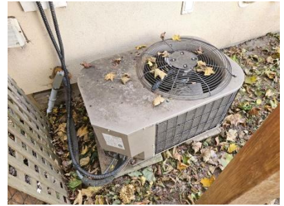
Pic. 9: AC compressor 2005