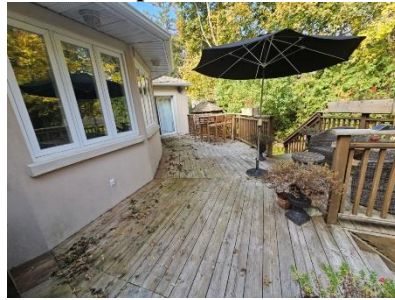
Pic. 8: Deck