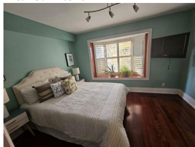
Pic. 26: Bedroom 3