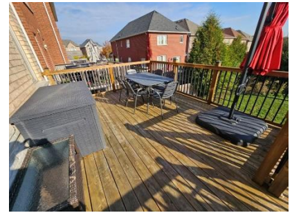
Pic. 6: Deck