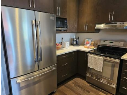
Pic. 22: Kitchen