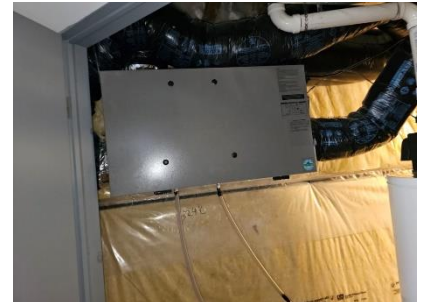
Pic. 27: HRV system