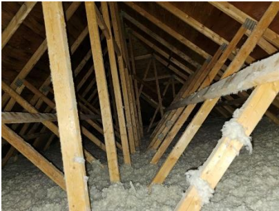
Pic. 7: Attic