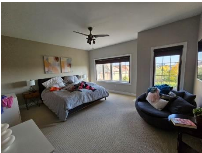
Pic. 10: Master bedroom