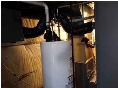
Pic. 28: Hot water tank 2023