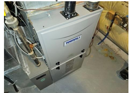
Pic. 30: Gas furnace 2012