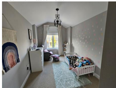
Pic. 14: Bedroom 3