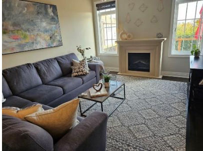
Pic. 19: Family room