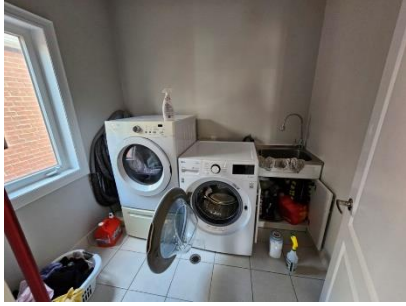
Pic. 16: Laundry