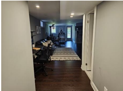
Pic. 25: Basement Rec room