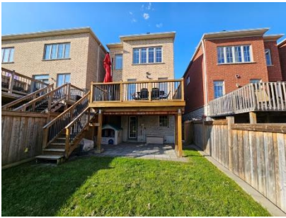
Pic. 4: Back view