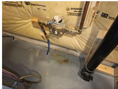
Pic. 29: Water main