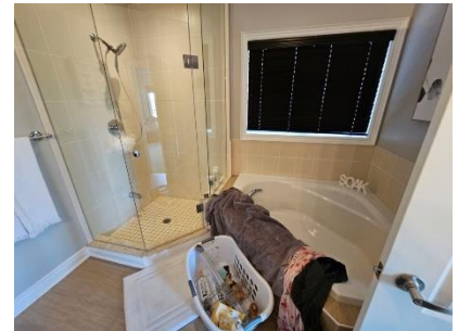
Pic. 12: Master bath