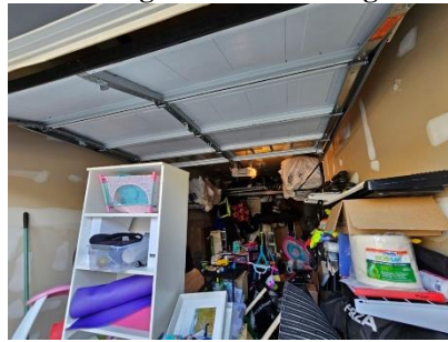
Pic. 5: Garage