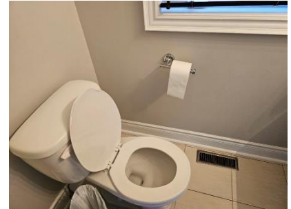
Pic. 24: Powder room