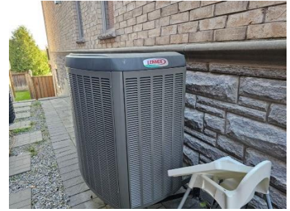
Pic. 3: AC unit 2011