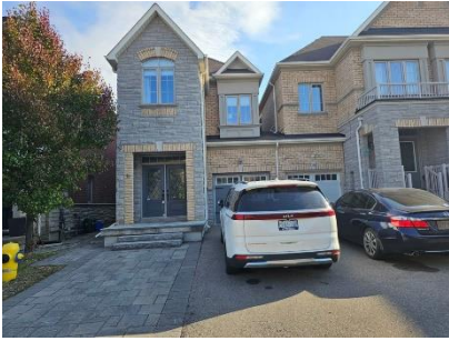
Pic. 1: Front view