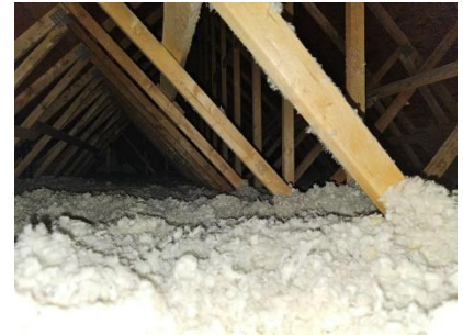
Pic. 9: Attic