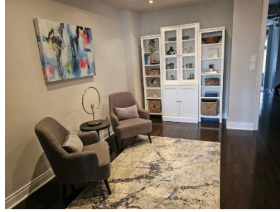
Pic. 17: Living room