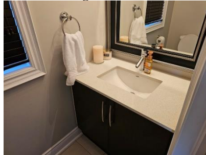
Pic. 23: Powder room