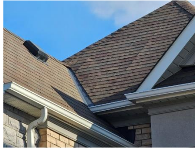
Pic. 2: Original roof covering