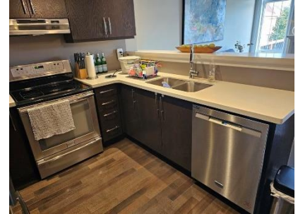
Pic. 21: Kitchen