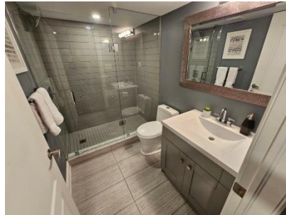
Pic. 26: Basement bathroom