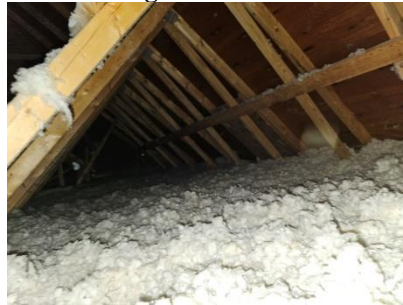
Pic. 8: Attic