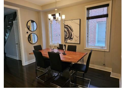
Pic. 18: Dining room