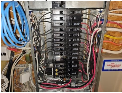
Pic. 31: 100 amp breaker panel