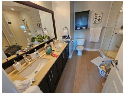
Pic. 11: Master bath