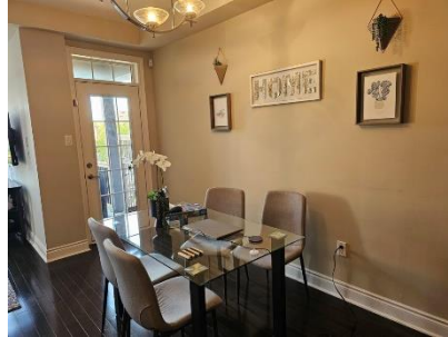
Pic. 20: Eating area