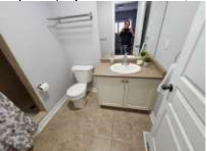
Pic. 16: Primary bathroom