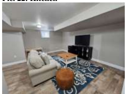
Pic. 25: Rec room