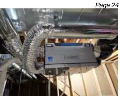
Pic. 33: HRV unit