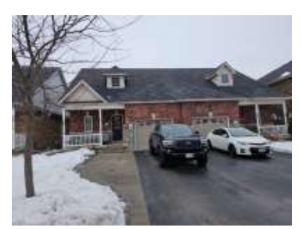
Pic. 1: Front view