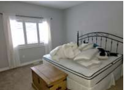
Pic. 15: Primary bedroom