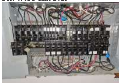
Pic. 7: 100 amp breaker panel