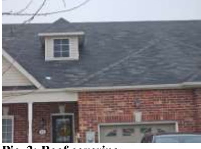
Pic. 2: Roof covering