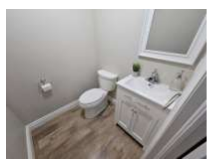
Pic. 28: Basement bathroom