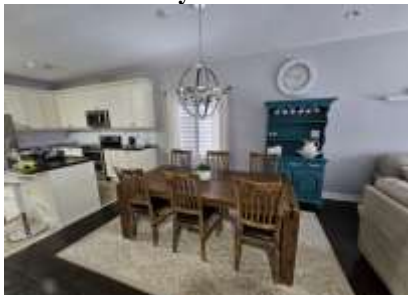
Pic. 19: Dining room