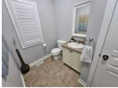
Pic. 23: Powder room