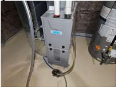
Pic. 32: Gas furnace 2015