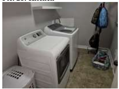
Pic. 24: Laundry