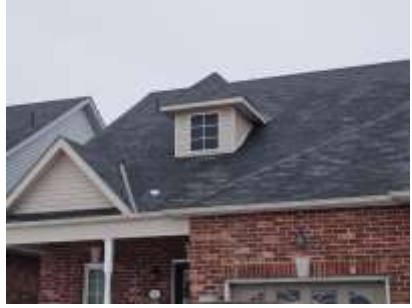
Pic. 3: Roof covering