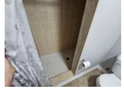
Pic. 17: Primary bathroom