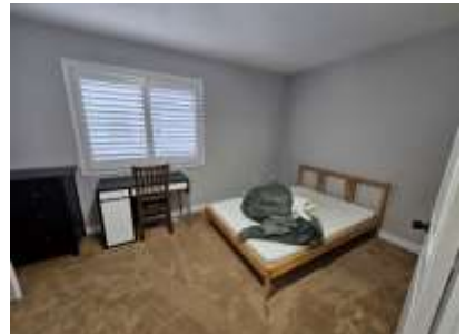
Pic. 12: Bedroom 3