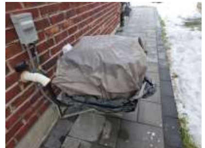
Pic. 4: AC unit 2015