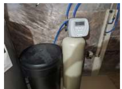
Pic. 29: Water softener