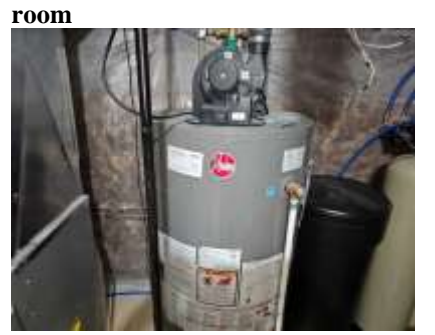
Pic. 30: Rental hot water tank 2015