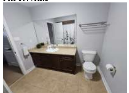
Pic. 13: 2<sup>nd</sup> floor bath