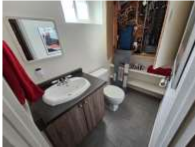
Pic. 32: Basement bath