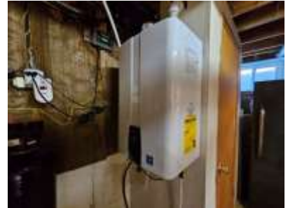
Pic. 36: Tankless hot water boiler 2022