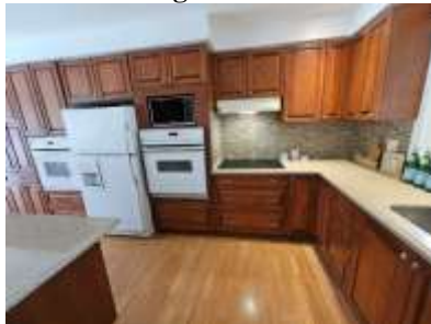
Pic. 23: Kitchen