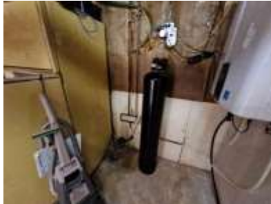
Pic. 35: Water softener