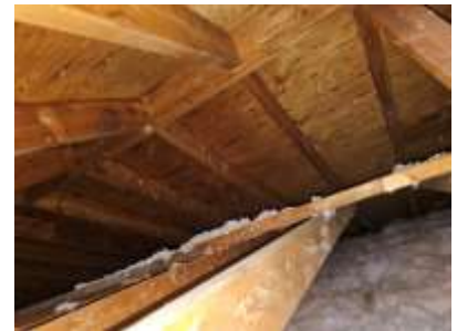
Pic. 12: Attic