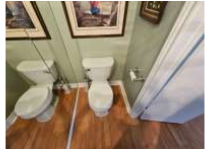
Pic. 27: Powder room