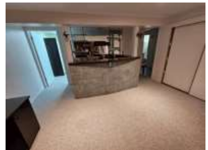
Pic. 30: Rec room