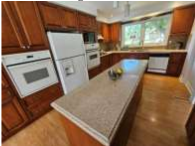
Pic. 25: Kitchen