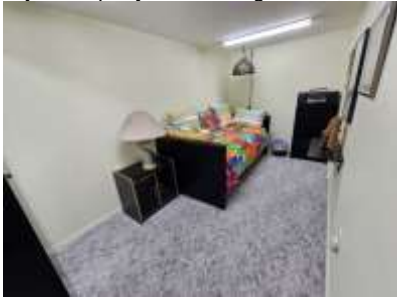
Pic. 31: Basement room