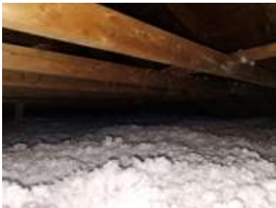
Pic. 10: Attic