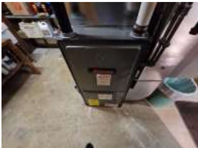
Pic. 37: Gas furnace 2009