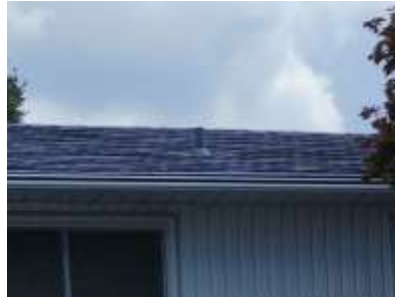
Pic. 2: Metal roof covering