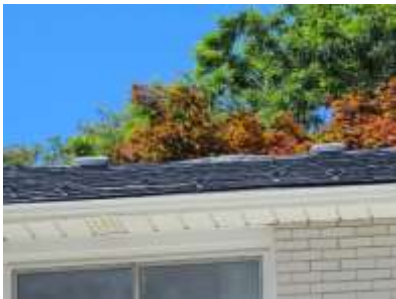
Pic. 7: Metal roof covering