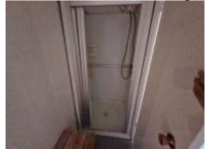
Pic. 33: Basement bath