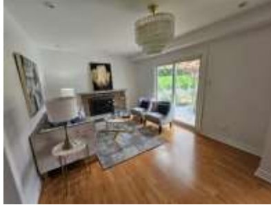
Pic. 20: Living room