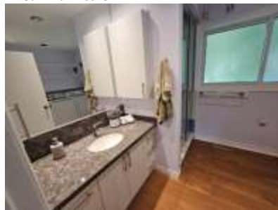
Pic. 14: Primary bathroom