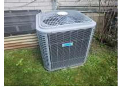
Pic. 3: AC unit 2015