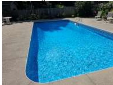
Pic. 8: In ground pool