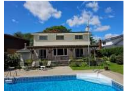
Pic. 6: Back view