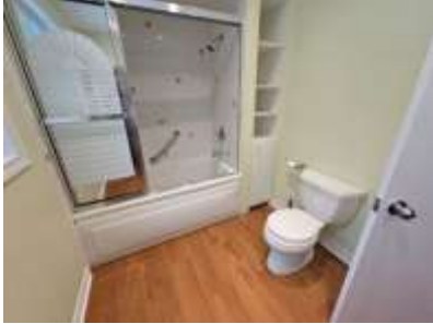
Pic. 19: 2 nd floor bathroom