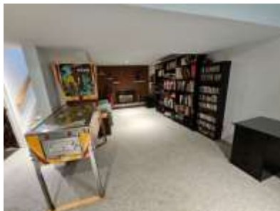
Pic. 29: Rec room