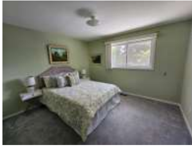
Pic. 17: Bedroom 3