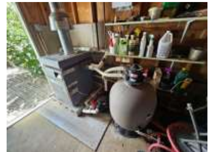
Pic. 9: Pool filter and heater – heater 2006