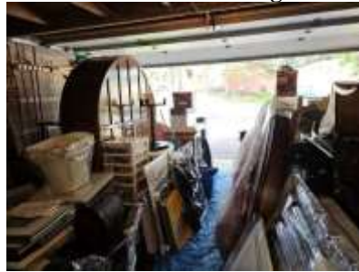
Pic. 5: Garage