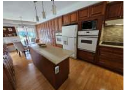
Pic. 24: Kitchen