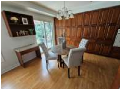
Pic. 22: Eating area