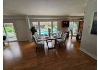
Pic. 21: Dining room