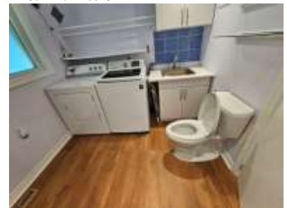
Pic. 15: Primary bathroom and laundry