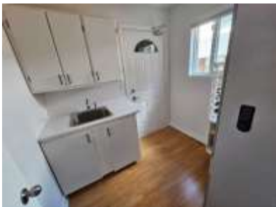
Pic. 28: Mud room