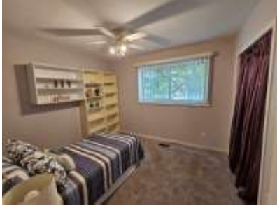
Pic. 16: Bedroom 2