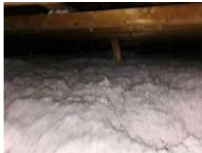
Pic. 11: Attic