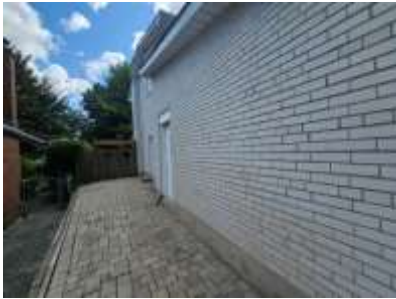
Pic. 4: Side view