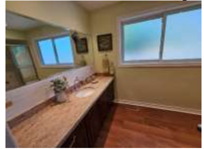
Pic. 18: 2nf floor bathroom