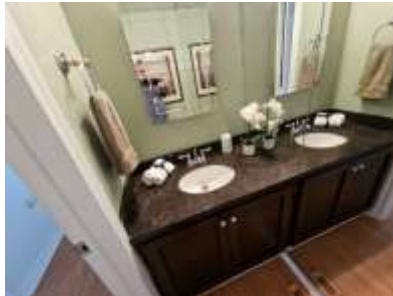
Pic. 26: Powder room