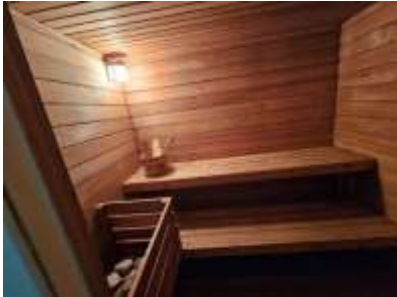
Pic. 34: Working sauna