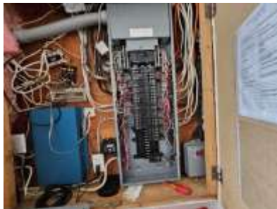
Pic. 38: 200 amp breaker panel with a mix of copper and aluminum wiring