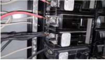
Pic. 40: One breaker multi tapped