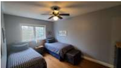
Pic. 16: Bed 2