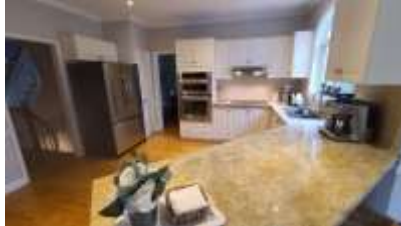
Pic. 26: Kitchen