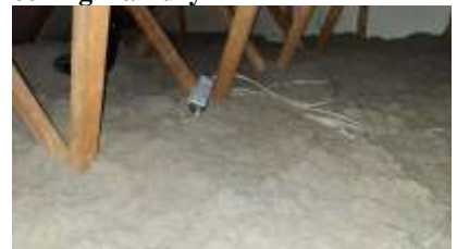
Pic. 12: Junction box should be secured above the insulation