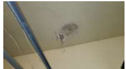
Pic. 9: Old water damage on ceiling – all dry