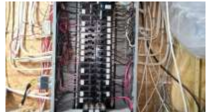
Pic. 39: 200 amp breaker panel