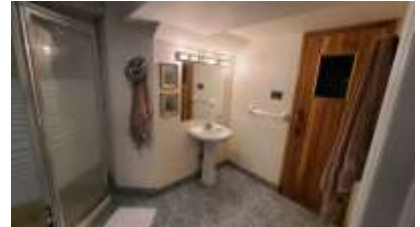
Pic. 33: Basement bathroom