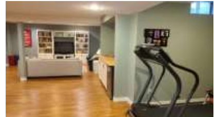
Pic. 30: Rec room