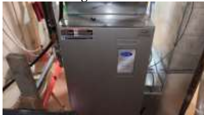
Pic. 38: Gas furnace 2017