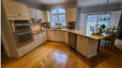
Pic. 25: Kitchen