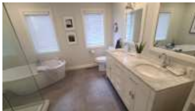
Pic. 14: Master bath