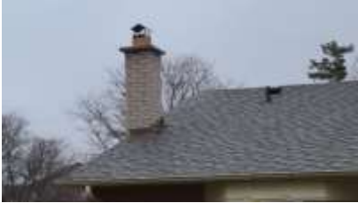
Pic. 4: Chimney