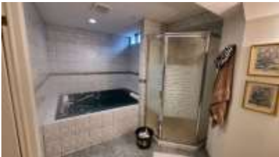
Pic. 34: Basement bathroom