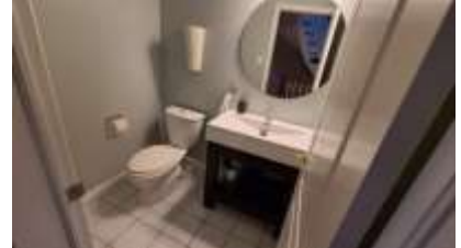
Pic. 27: Powder room