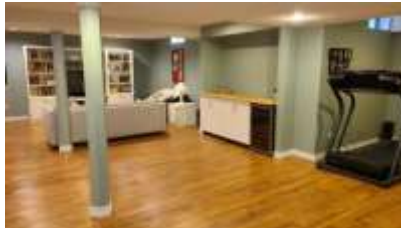
Pic. 29: Rec room