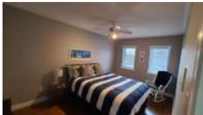
Pic. 17: Bed 3