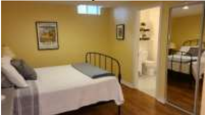
Pic. 31: Bed 5