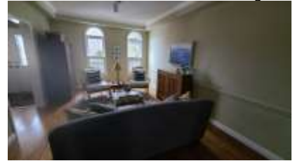
Pic. 21: Living room