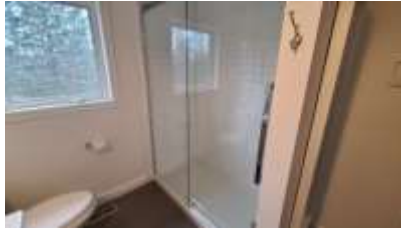
Pic. 20: 2 nd floor bath