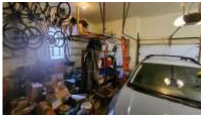
Pic. 8: Garage