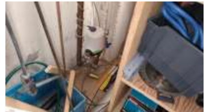
Pic. 36: Water main