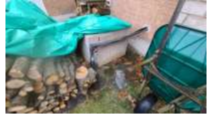
Pic. 6: AC unit 1990