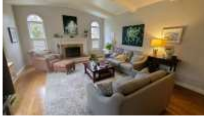
Pic. 23: Family room