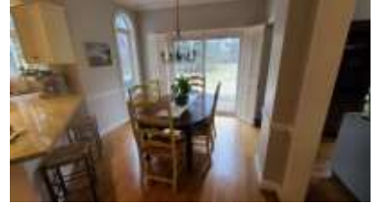
Pic. 24: Eating area