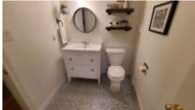
Pic. 32: Basement powder room