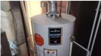
Pic. 37: Hot water tank 2010