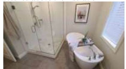
Pic. 15: Master bath