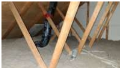
Pic. 11: Attic