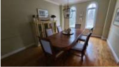
Pic. 22: Dining room