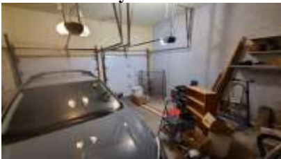
Pic. 7: Garage