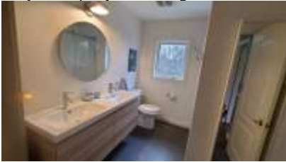
Pic. 19: 2 nd floor bath