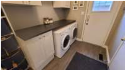
Pic. 28: Laundry