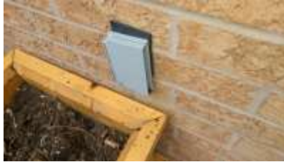
Pic. 5: Outlet cover loose