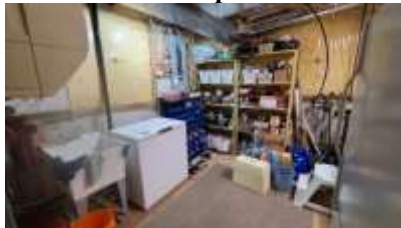
Pic. 35: Storage room