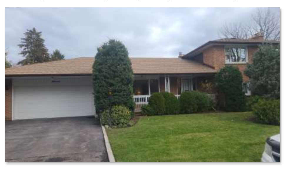
11 Lillian Ave, Thornhill, Ontario