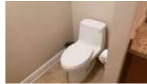
Pic. 15: Master bath