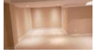
Pic. 36: Rec room