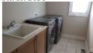
Pic. 22: Laundry