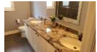
Pic. 20: 2 nd floor bath