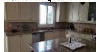
Pic. 28: Kitchen