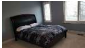
Pic. 18: Bed 3