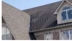
Pic. 2: Original roof covering