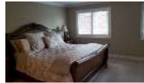
Pic. 11: Master bedroom