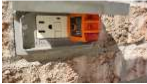
Pic. 5: GFCI needs replacement