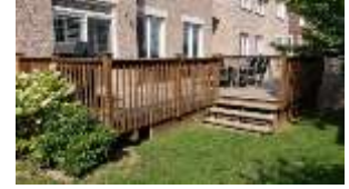
Pic. 4: Rear deck