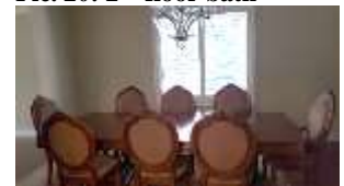
Pic. 24: Dining room