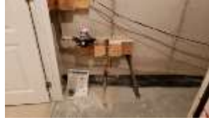
Pic. 39: Water main