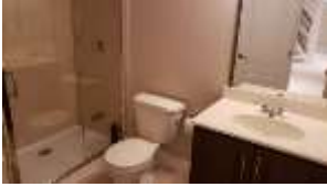
Pic. 37: Basement bath