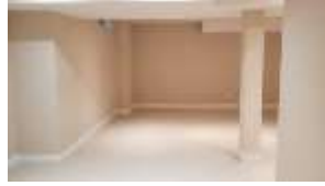
Pic. 35: Rec room