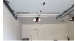
Pic. 8: Garage