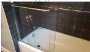
Pic. 21: 2 nd floor bath