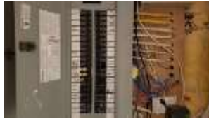
Pic. 42: 200 amp breaker panel