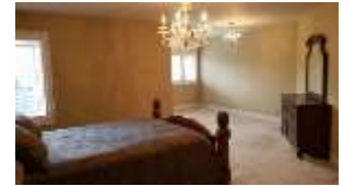
Pic. 16: Bed 2