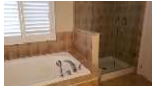
Pic. 14: Master bath