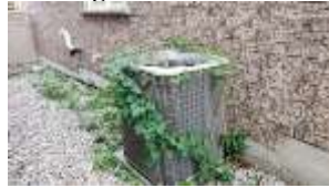
Pic. 6: AC unit