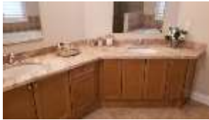
Pic. 13: Master bath