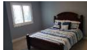
Pic. 19: Bed 4