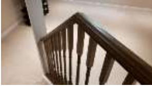
Pic. 33: Handrailing loose in basement