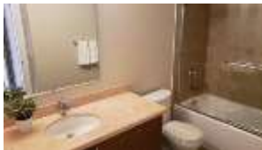
Pic. 17: Ensuite