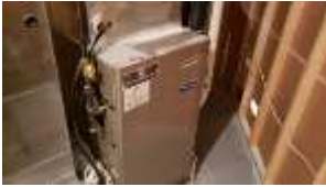
Pic. 41: Gas furnace