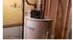
Pic. 40: Rental hot water tank