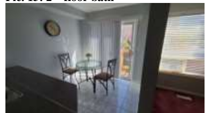
Pic. 18: Eating room