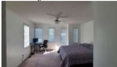
Pic. 8: Master bedroom