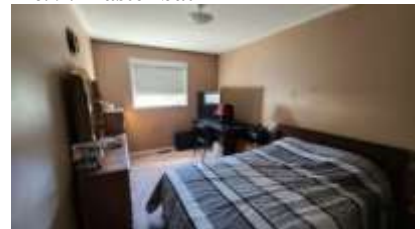
Pic. 12: Bed 3