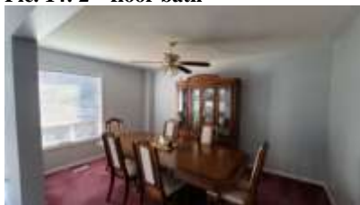
Pic. 17: Dining room