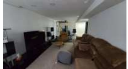
Pic. 21: Rec room