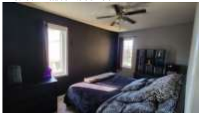
Pic. 11: Bed 2