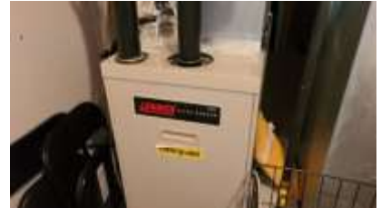
Pic. 24: Original gas furnace