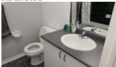
Pic. 14: 2nd floor bath