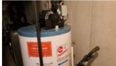
Pic. 23: Owner hot water tank 2000