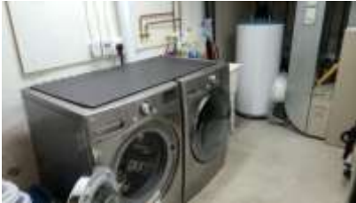
Pic. 22: Laundry