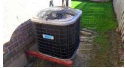
Pic. 3: AC unit 2018