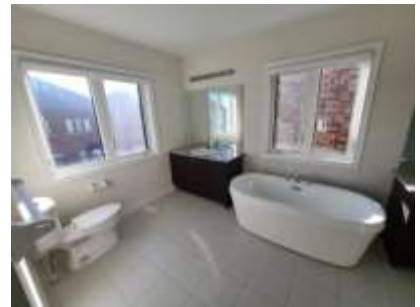
Pic. 9: Master bath