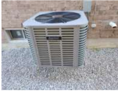
Pic. 2: AC unit