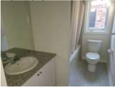
Pic. 16: 2 nd floor bath