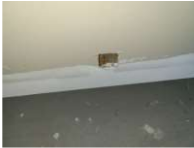
Pic. 5: Minor repair / sealing to garage wall needed