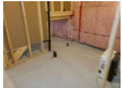
Pic. 27: Rough in bathroom