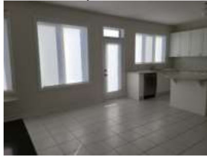
Pic. 20: Eating area