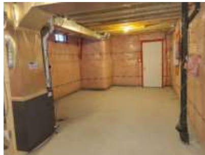
Pic. 26: Unfinished basement