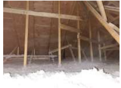
Pic. 6: Attic