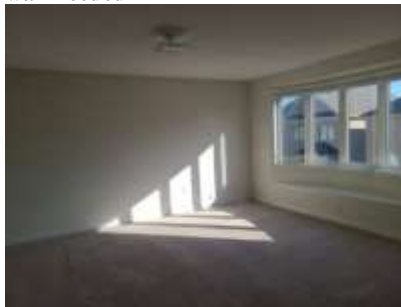
Pic. 8: Master bedroom