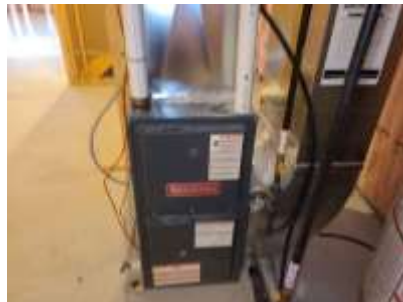
Pic. 29: Gas furnace