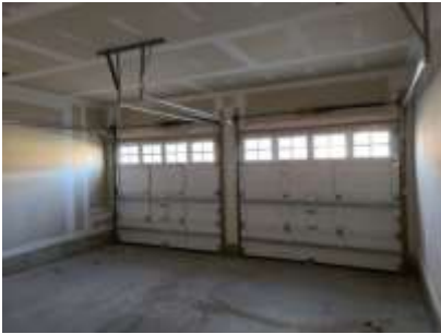
Pic. 4: Garage