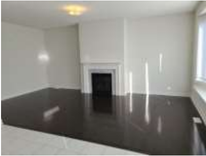
Pic. 19: Family room