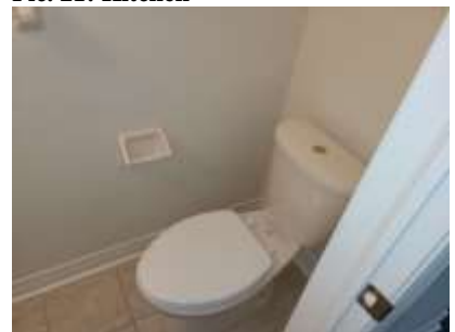
Pic. 24: Powder room