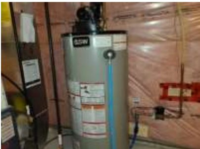
Pic. 28: Rental hot water tank