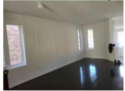
Pic. 18: Living & Dining room