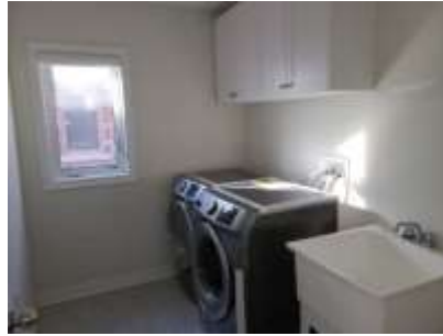
Pic. 17: Laundry