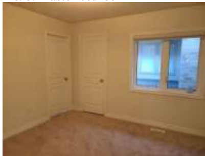
Pic. 11: Bed 2