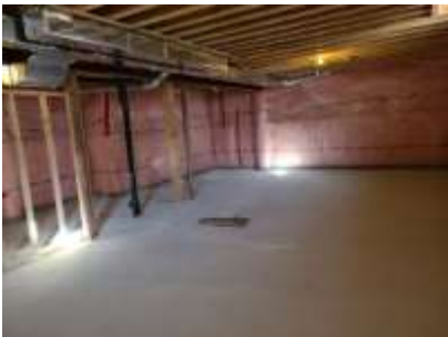
Pic. 25: Unfinished basement