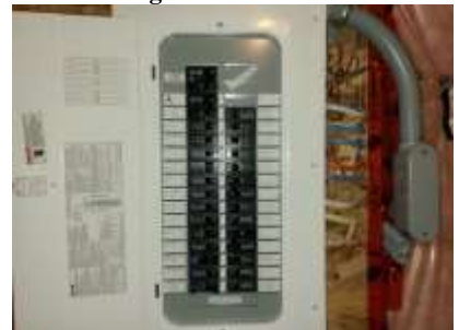
Pic. 30: 100 amp breaker panel