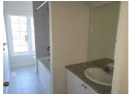
Pic. 12: Joint ensuite