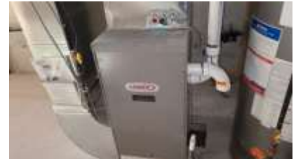
Pic. 27: Gas furnace