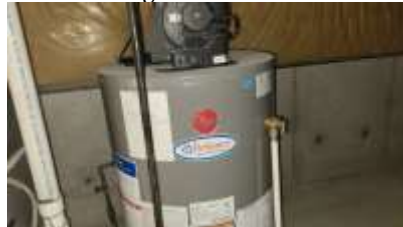
Pic. 26: Rental hot water tank 2008