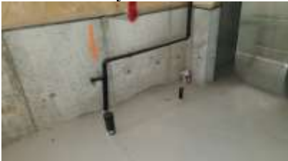
Pic. 25: Bathroom rough in