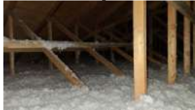
Pic. 5: Attic