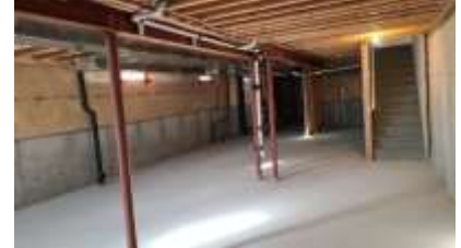
Pic. 24: Unfinished basement