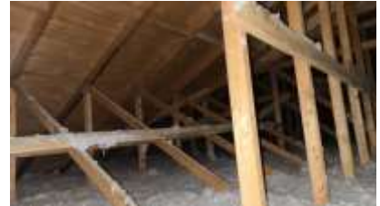
Pic. 6: Attic