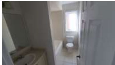
Pic. 14: Ensuite