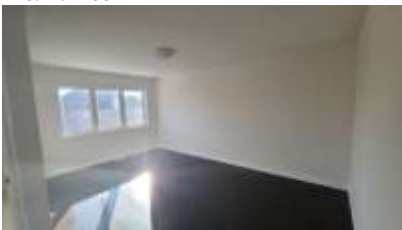
Pic. 7: Master bedroom