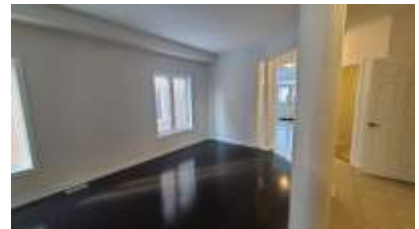
Pic. 15: Living / Dining room