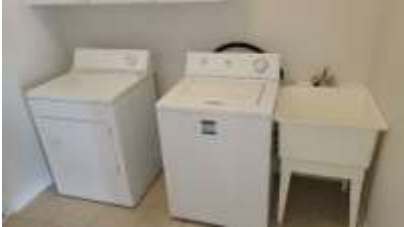
Pic. 22: Laundry