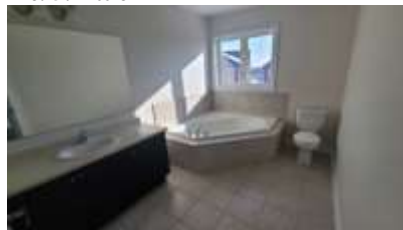
Pic. 8: Master bath