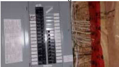
Pic. 28: 100 amp breaker panel