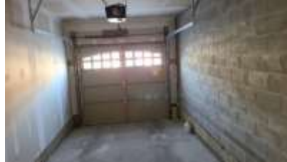
Pic. 23: Garage