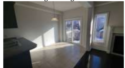
Pic. 18: Eating area