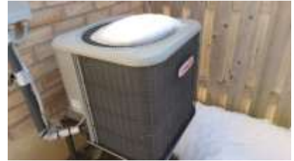
Pic. 3: AC unit 2009