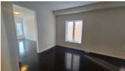
Pic. 16: Living / Dining room