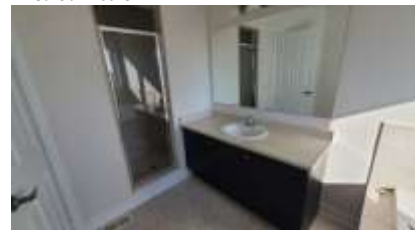
Pic. 9: Master bath