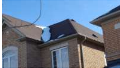
Pic. 2: Roof covering