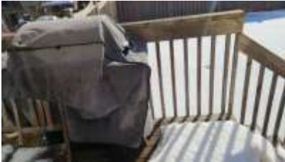
Pic. 4: Deck