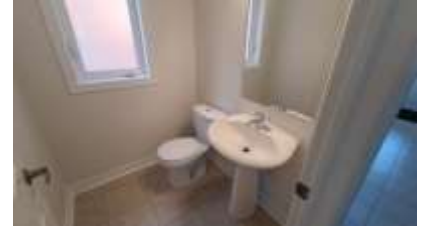
Pic. 21: Powder room