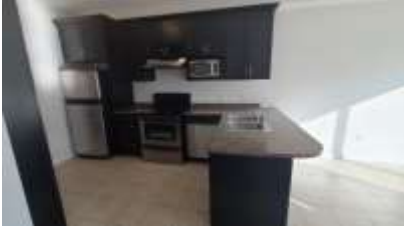
Pic. 19: Kitchen