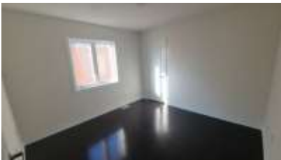
Pic. 13: Bed 4