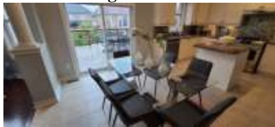
Pic. 32: Eating area