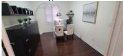
Pic. 35: Office