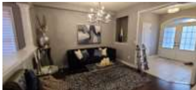
Pic. 29: Living room