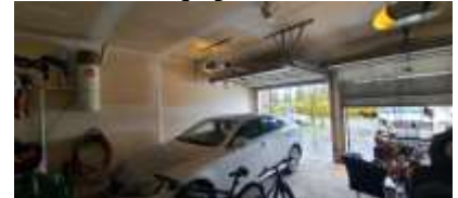
Pic. 12: Garage