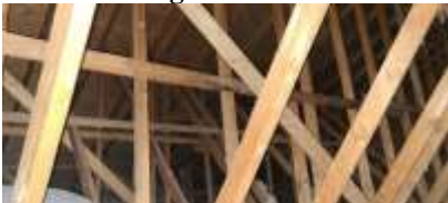
Pic. 16: Attic