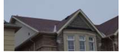
Pic. 3: Original roof covering