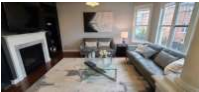
Pic. 31: Family room