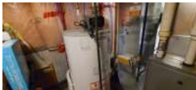
Pic. 47: Rental hot water tank