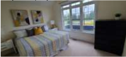
Pic. 25: Bedroom 4