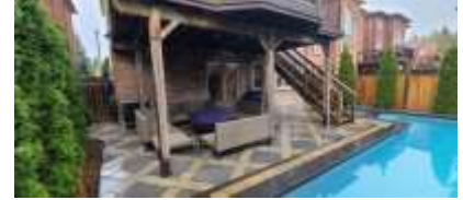
Pic. 6: Patio