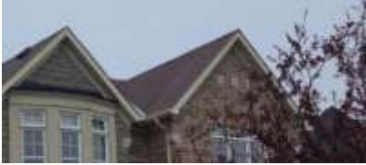
Pic. 4: Original roof covering