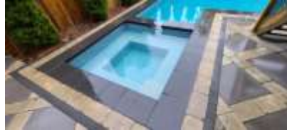
Pic. 8: Spa