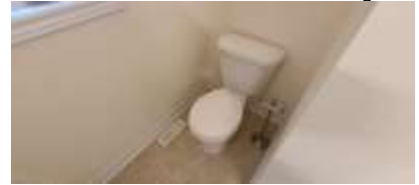
Pic. 27: Ensuite