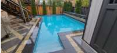
Pic. 7: Pool