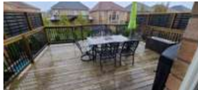
Pic. 14: Deck