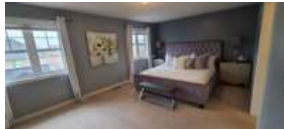
Pic. 17: Master bedroom