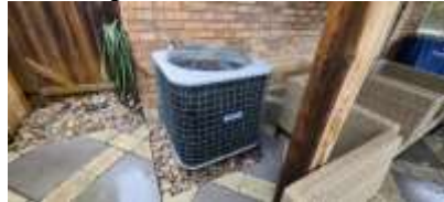
Pic. 11: AC 2009