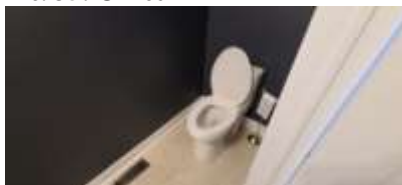
Pic. 38: Powder room