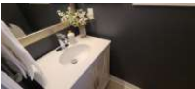
Pic. 37: Powder room