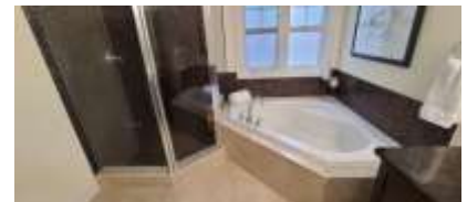
Pic. 21: Master bath