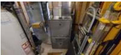
Pic. 46: Gas furnace 2009