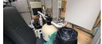
Pic. 9: Pool equipment