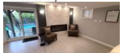
Pic. 39: Rec room