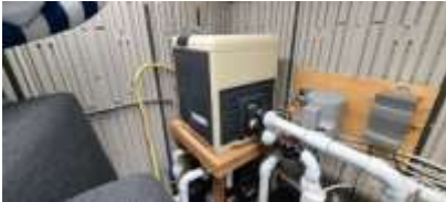
Pic. 10: Pool heater