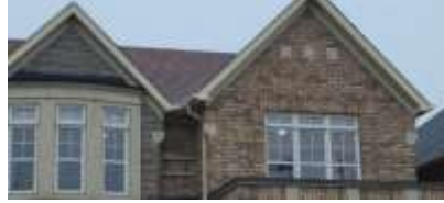
Pic. 2: Original roof covering