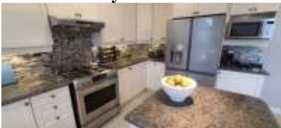
Pic. 34: Kitchen