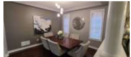
Pic. 30: Dining room