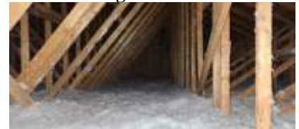
Pic. 15: Attic