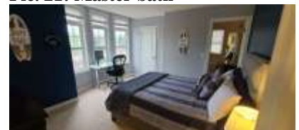
Pic. 24: Bedroom 3