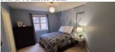
Pic. 22: Bedroom 2