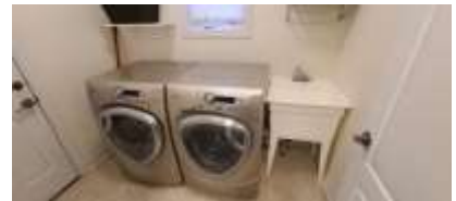
Pic. 36: Laundry