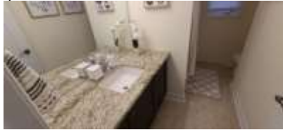
Pic. 26: Ensuite