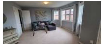
Pic. 18: Master bedroom