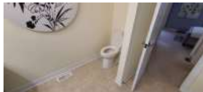
Pic. 20: Master bath