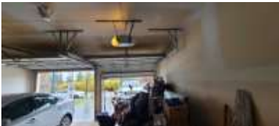
Pic. 13: Garage