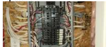
Pic. 48: 100 amp breaker panel