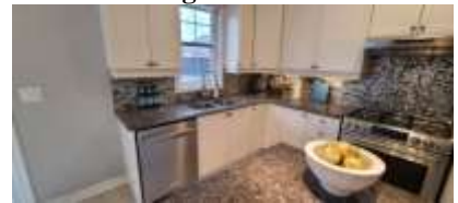
Pic. 33: Kitchen