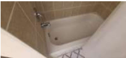
Pic. 28: Ensuite