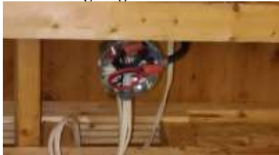
Pic. 28: Junction box requires a proper cover