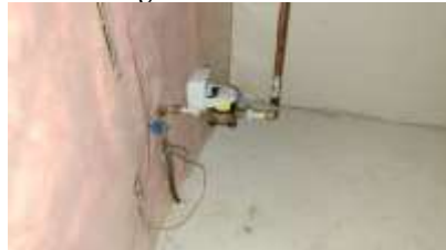
Pic. 29: Water main