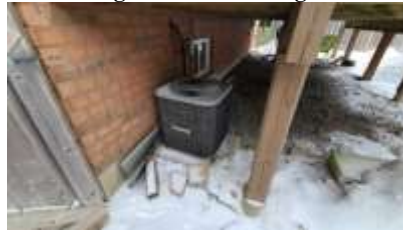
Pic. 5: AC unit 2009