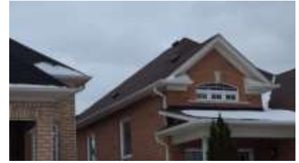
Pic. 3: Original roof covering