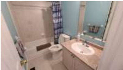
Pic. 13: Main bath