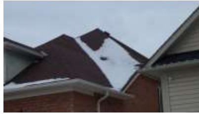
Pic. 2: Original roof covering