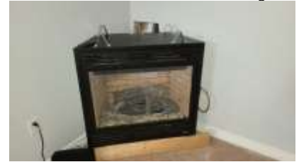
Pic. 21: Firepalce needs surropund and mantel