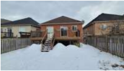
Pic. 4: Bck view