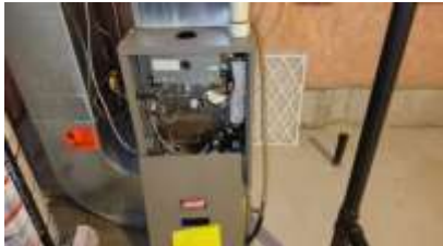
Pic. 25: Orignal gas furnace