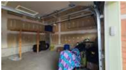
Pic. 31: Garage