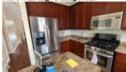
Pic. 17: Kitchen