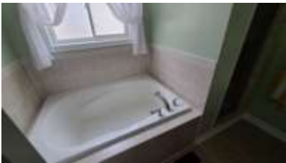
Pic. 10: Master bath