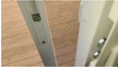
Pic. 19: Patio door screen torn