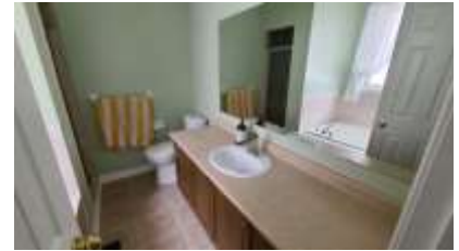
Pic. 9: Master bath