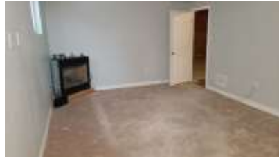
Pic. 20: Rec room