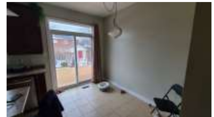
Pic. 15: Eating area