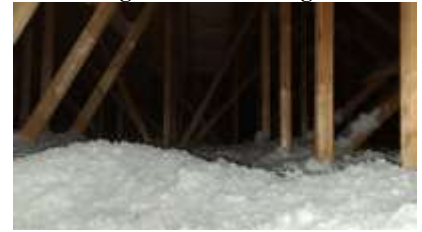
Pic. 6: Attic