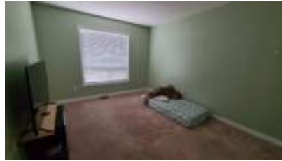
Pic. 8: Master bedroom