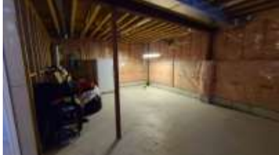
Pic. 22: Unfinished basement