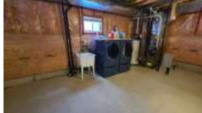
Pic. 23: Laundry