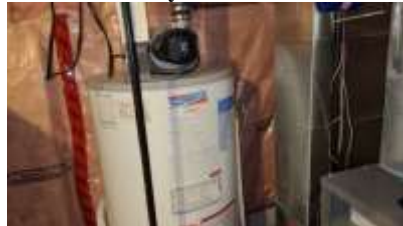
Pic. 26: Original hot water tank