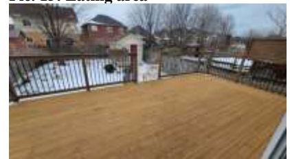
Pic. 18: rear deck