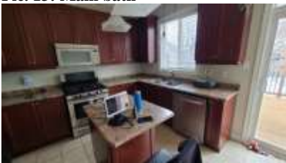
Pic. 16: Kitchen