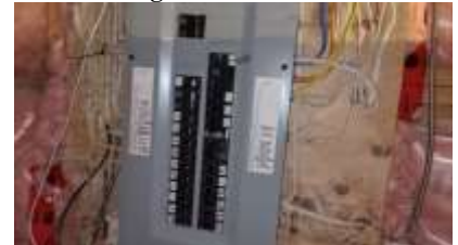
Pic. 27: 100 amp breaker panel