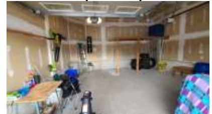
Pic. 30: Garage