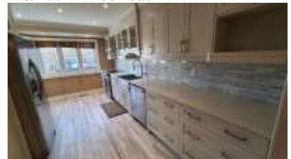
Pic. 18: Kitchen