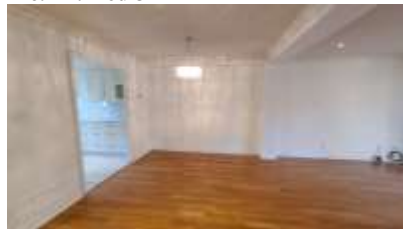
Pic. 17: Dining room