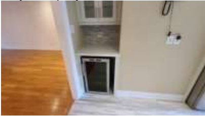
Pic. 19: Kitchen