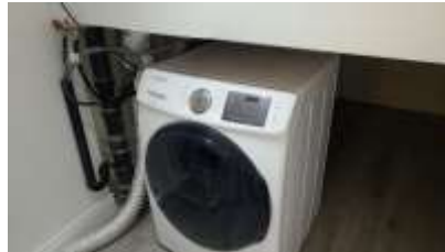
Pic. 26: Laundry