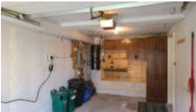
Pic. 7: Garage