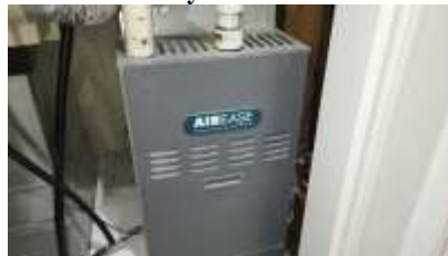
Pic. 29: Gas furnace 2007