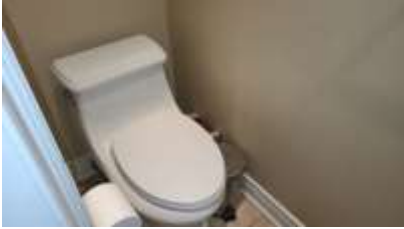
Pic. 22: Powder room