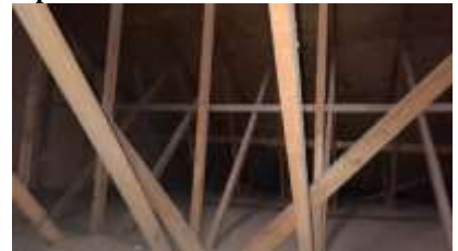
Pic. 9: Attic