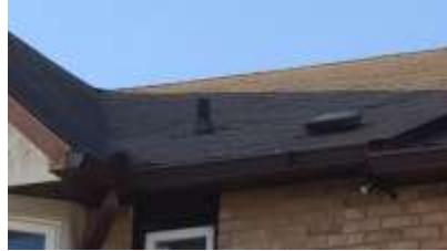
Pic. 2: Roof covering