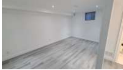
Pic. 23: Rec room