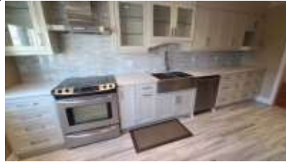
Pic. 20: Kitchen