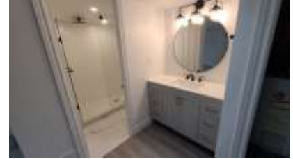
Pic. 24: Basement bath