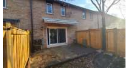
Pic. 3: Back view