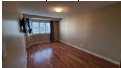
Pic. 11: Master bedroom