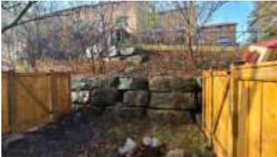
Pic. 4: Backyard