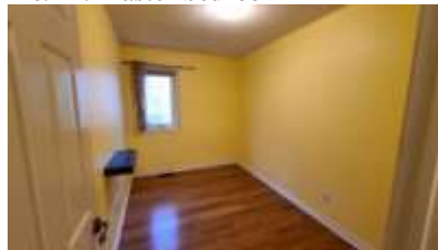
Pic. 14: Bed 3