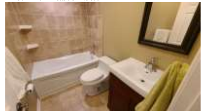
Pic. 15: 2nd floor bath