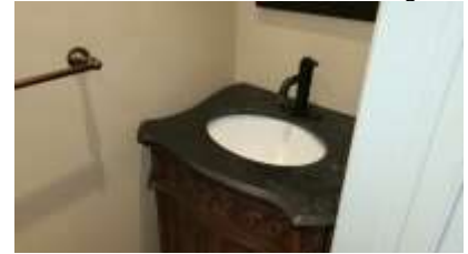
Pic. 21: Powder room