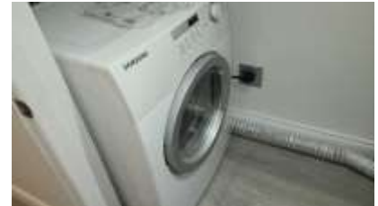
Pic. 27: Laundry