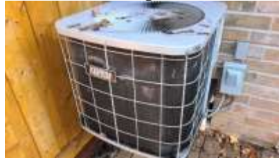
Pic. 5: AC unit 2002