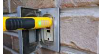
Pic. 6: Rear GFCI outlet needs to be replaced