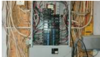
Pic. 8: 100 amp breaker panel