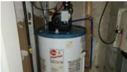
Pic. 28: Hot water tank 2003