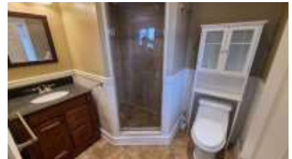
Pic. 12: Master bath