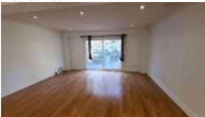
Pic. 16: Living room