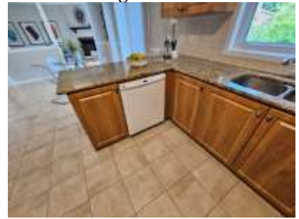
Pic. 26: Kitchen