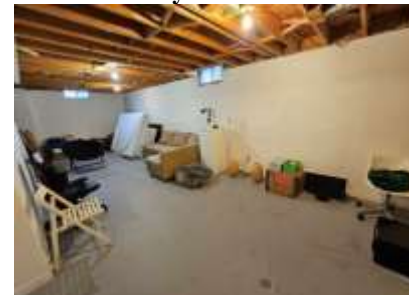
Pic. 31: Basement