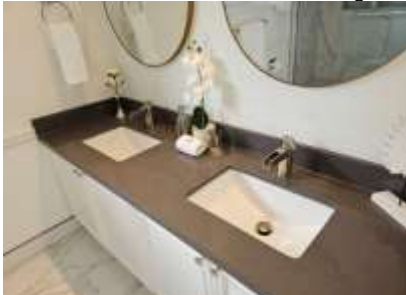
Pic. 15: Master bath