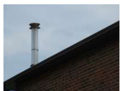
Pic. 4: Chimeny