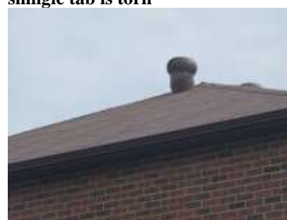
Pic. 5: Roof covering