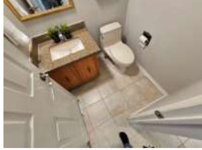
Pic. 29: Powder room