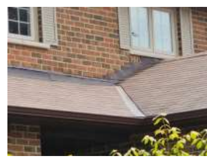
Pic. 3: Roof covering