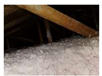
Pic. 12: Attic