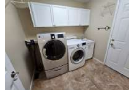
Pic. 30: Laundry