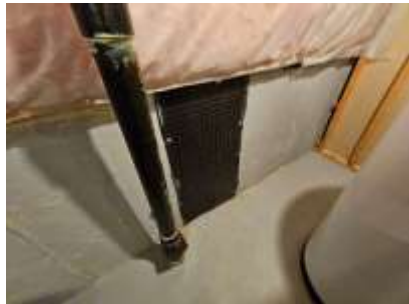
Pic. 35: Foundation repair