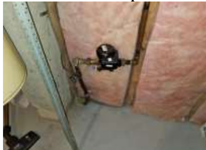
Pic. 38: Water main