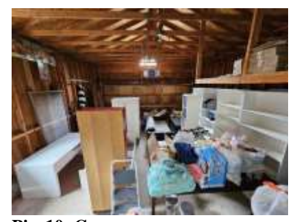
Pic. 10: Garage