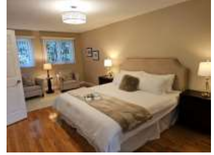
Pic. 14: Master bedroom