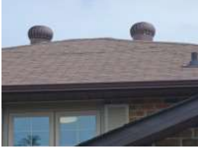
Pic. 2: Roof covering – appears one shingle tab is torn