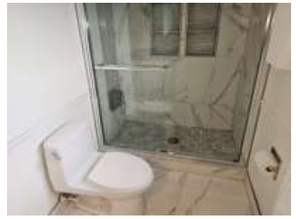
Pic. 16: Master bath