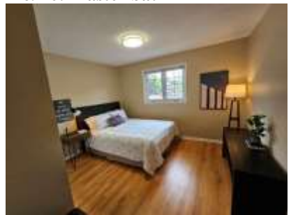
Pic. 19: Bedroom 4