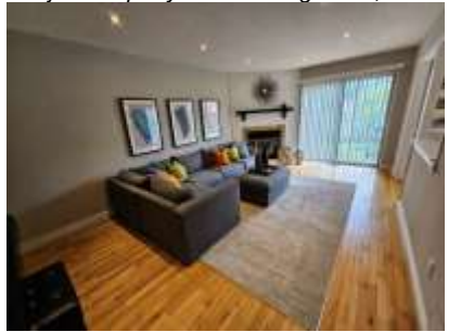
Pic. 28: Family room