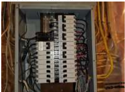
Pic. 39: 150 amp breaker panel