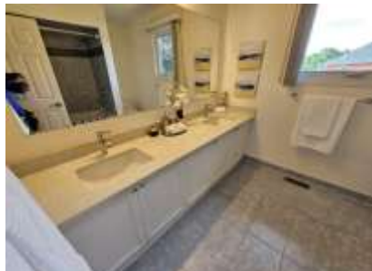
Pic. 20: 2<sup>nd</sup> floor bath