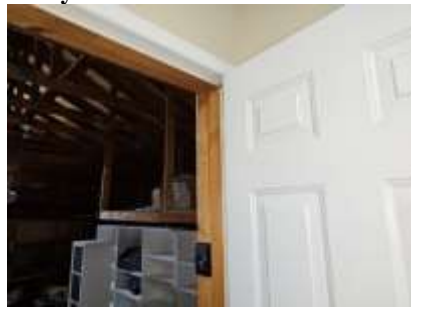
Pic. 11: Auto closer needed for safety