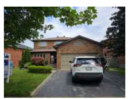
Pic. 1: Front view