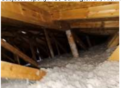
Pic. 13: Attic