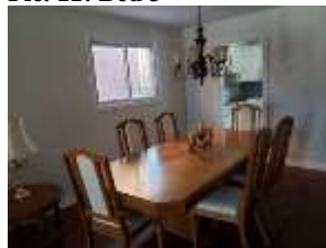
Pic. 15: Dining room