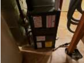
Pic. 29: Gas furnace 2016