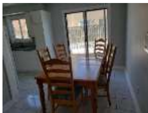
Pic. 18: Eating area