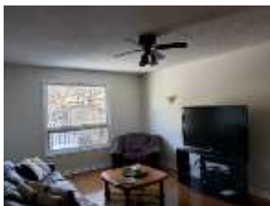
Pic. 17: Family room