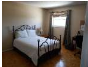
Pic. 11: Bed 3