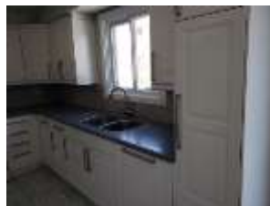
Pic. 19: Kitchen