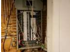
Pic. 30: 200 amp main electrical panel with all copper wire