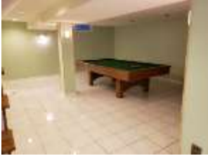
Pic. 25: Rec room