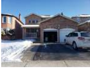
Pic. 1: Front view