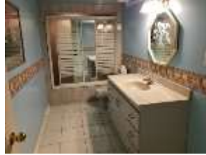
Pic. 27: Basement bath