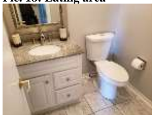
Pic. 22: Powder room