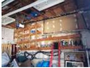
Pic. 2: Garage