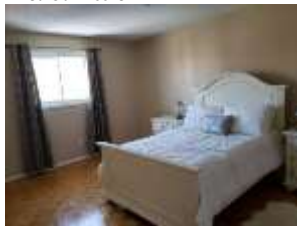
Pic. 10: Bed 2