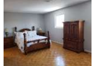
Pic. 8: Master bedroom