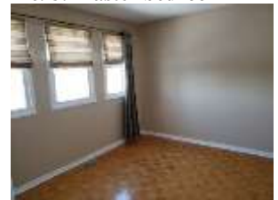
Pic. 12: Bed 4