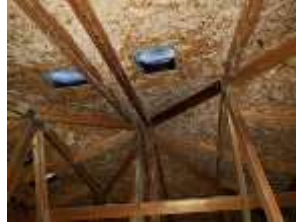
Pic. 7: Attic