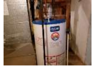
Pic. 28: Rental hot water tank