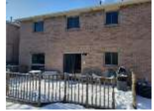
Pic. 4: Back view