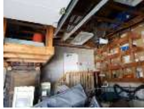
Pic. 3: Garage