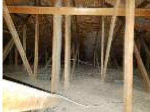
Pic. 6: Attic