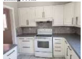
Pic. 20: Kitchen