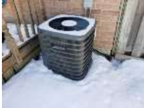
Pic. 5: AC unit 2016