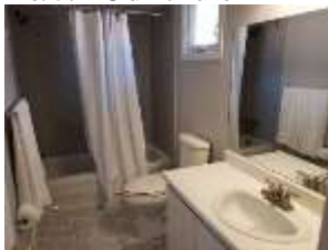
Pic. 9: Master bath