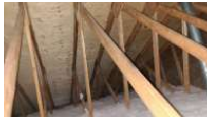
Pic. 8: Attic