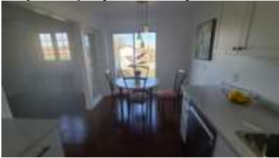
Pic. 19: Eating area