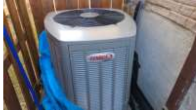
Pic. 5: AC unit 2017