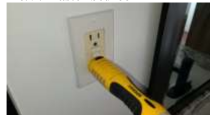
Pic. 12: GFCI on master bath defective and needs to be replaced