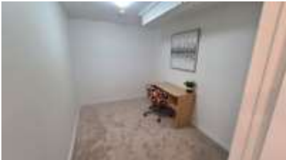
Pic. 25: Basement room