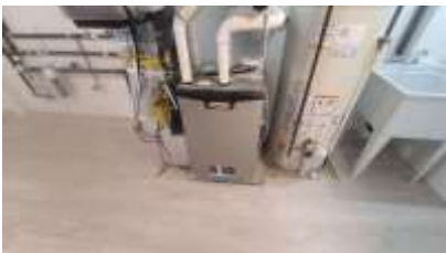
Pic. 28: Gas furnace 2017