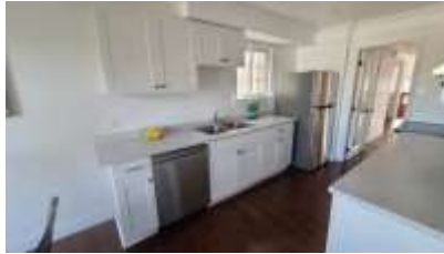
Pic. 20: Kitchen