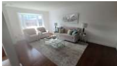
Pic. 17: Living room