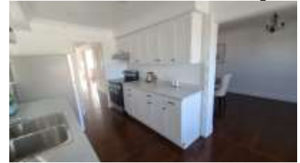
Pic. 21: Kitchen