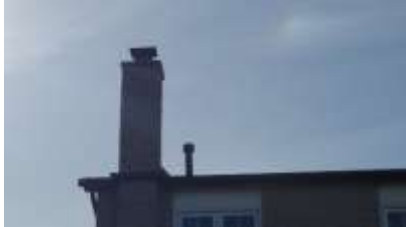
Pic. 4: Chimney