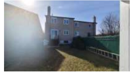
Pic. 3: Back view