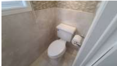
Pic. 23: Powder room