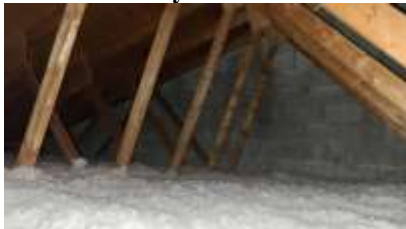
Pic. 7: Attic