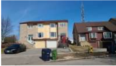
Pic. 1: Front view