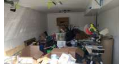
Pic. 6: Garage