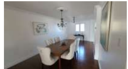
Pic. 18: Dining room