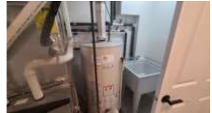
Pic. 27: Owned hot water tank 2008