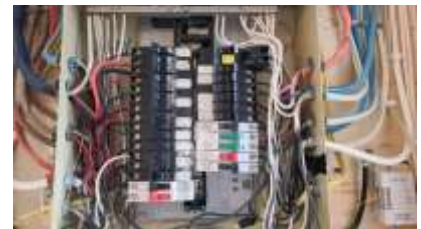
Pic. 30: 100 amp breaker panel – all copper wire