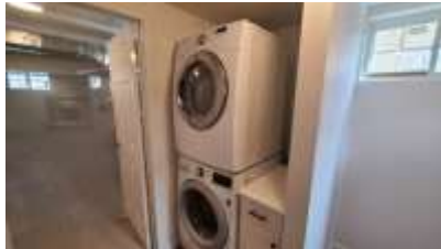
Pic. 26: Laundry