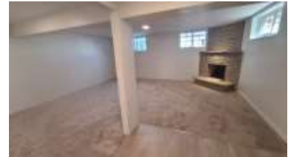
Pic. 24: Rec room