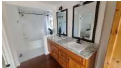
Pic. 11: Master bath