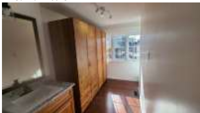
Pic. 10: Master bath