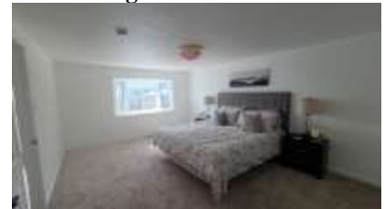
Pic. 9: Master bedroom