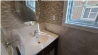
Pic. 22: Powder room