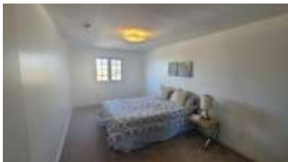
Pic. 13: Bed 2