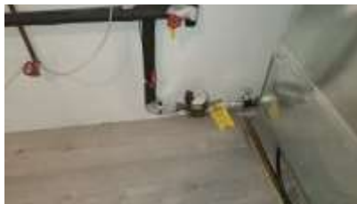
Pic. 29: Water main