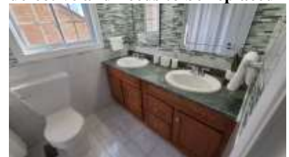
Pic. 15: 2 nd floor bath