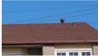
Pic. 2: Updated roof covering