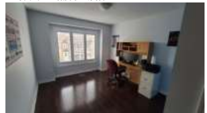
Pic. 12: Bedroom 3