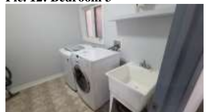
Pic. 15: Laundry