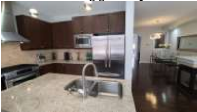
Pic. 22: Kitchen