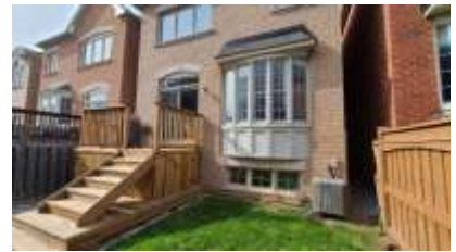
Pic. 3: Back view – handrailing advised for deck steps