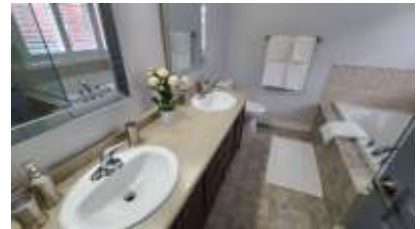
Pic. 9: Master bath