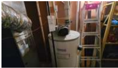
Pic. 29: Hot water tank 2010