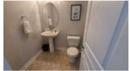
Pic. 24: Powder room