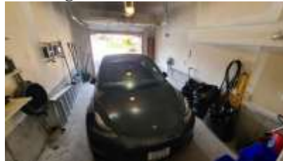
Pic. 5: Garage