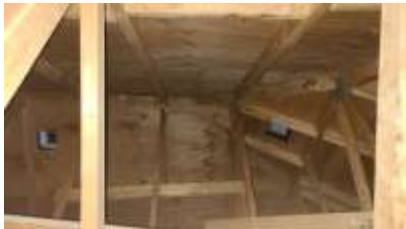
Pic. 7: Attic