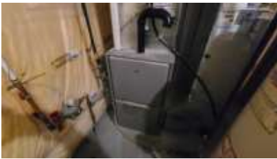
Pic. 28: Gas furnace 2010