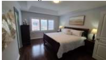
Pic. 8: Master bedroom