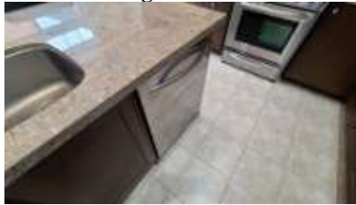
Pic. 23: Kitchen