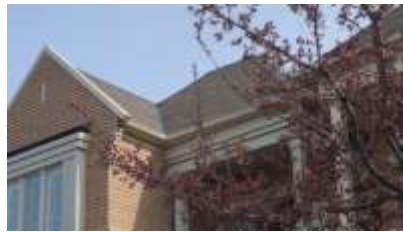
Pic. 2: Builder's original roof covering