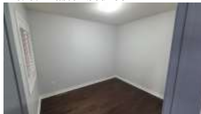
Pic. 11: Bedroom 2