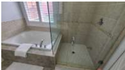
Pic. 10: Master bath