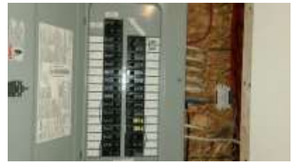
Pic. 30: 100 amp breaker panel