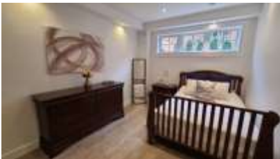
Pic. 25: Bedroom 4