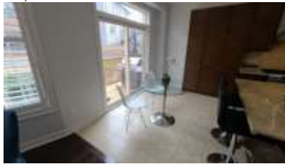
Pic. 20: Eating area