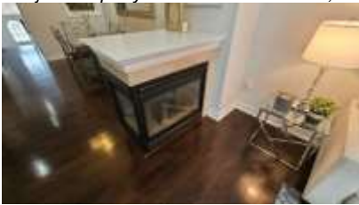
Pic. 19: Working gas fireplace