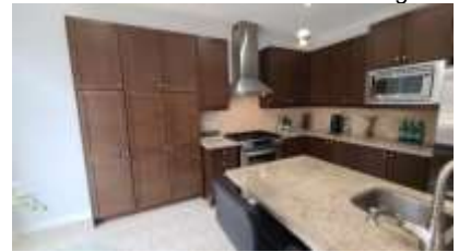
Pic. 21: Kitchen