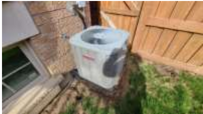
Pic. 4: AC unit 2010