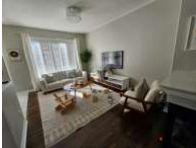
Pic. 20: Living room