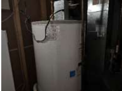
Pic. 34: Rental hot water tank 2010