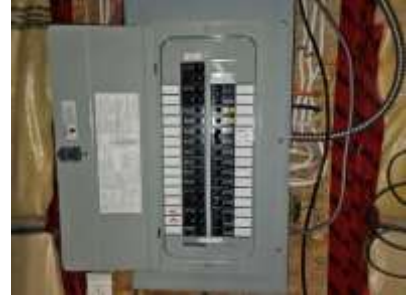
Pic. 36: 100 amp breaker panel