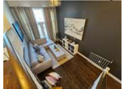
Pic. 18: Family room