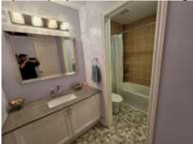
Pic. 16: 2 nd floor bathroom