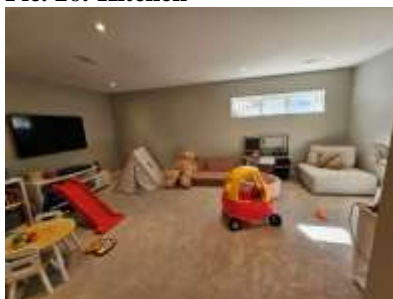
Pic. 29: Rec room