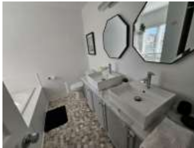
Pic. 11: Primary bathroom