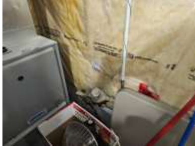
Pic. 35: Water main