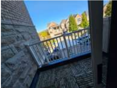
Pic. 19: Balcony