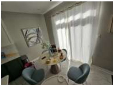
Pic. 22: Eating area