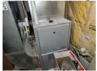
Pic. 33: Gas furnace 2010