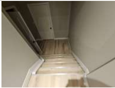
Pic. 32: Handrailing advised for stairwell