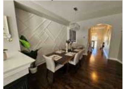
Pic. 21: Dining room