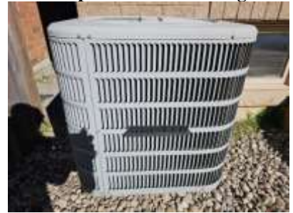
Pic. 6: AC compressor 2010