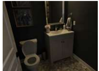
Pic. 27: Powder room