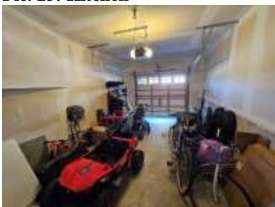
Pic. 28: Garage