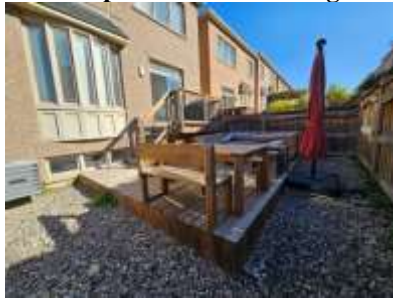
Pic. 5: Deck