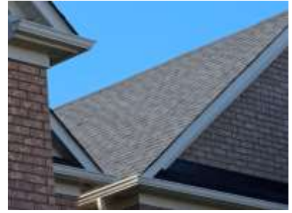
Pic. 3: Updated roof covering