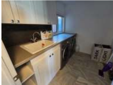
Pic. 17: Laundry