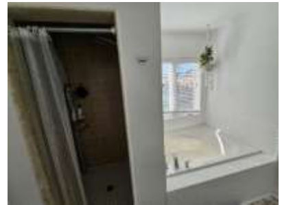
Pic. 12: Primary bathroom