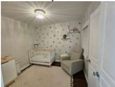
Pic. 13: Bedroom 2