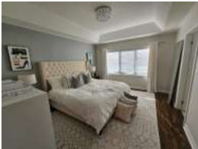
Pic. 10: Primary bedroom