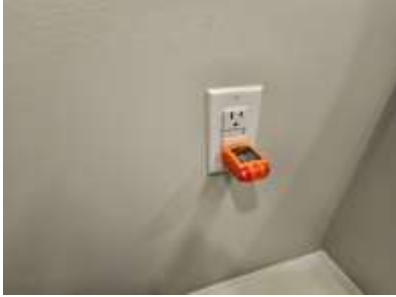
Pic. 31: GFCI outlet in bathroom wired incorrectly