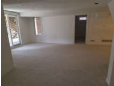
Pic. 31: Rec room