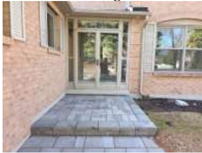
Pic. 5: Front entrance