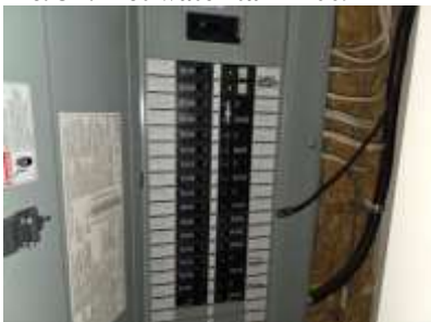
Pic. 37: 200 amp breaker panel