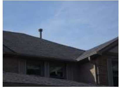
Pic. 3: Roof covering