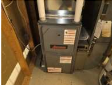
Pic. 35: Gas furnace 2022