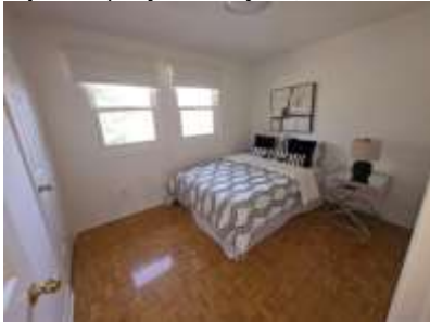
Pic. 16: Bedroom 2