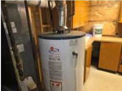
Pic. 34: Hot water tank 2009