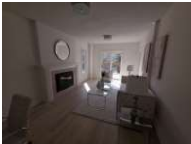
Pic. 23: Family room