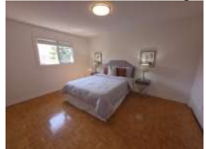
Pic. 18: Bedroom 4