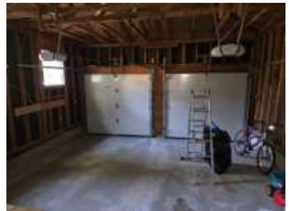
Pic. 9: Garage