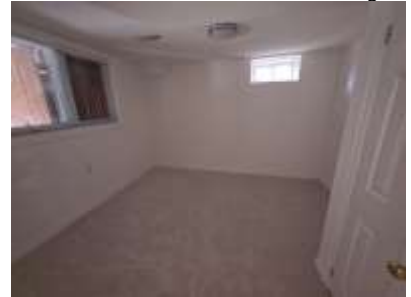
Pic. 33: Bedroom 5