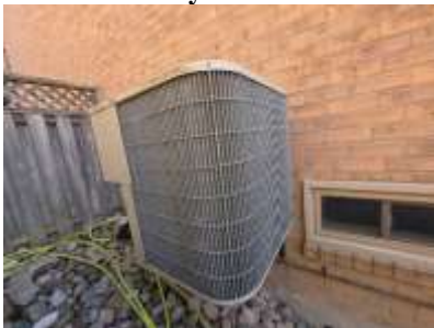
Pic. 7: AC compressor 2007