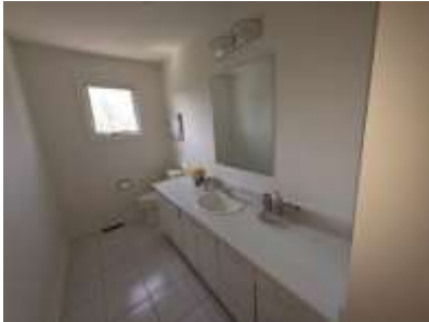
Pic. 19: 2 nd floor bathroom