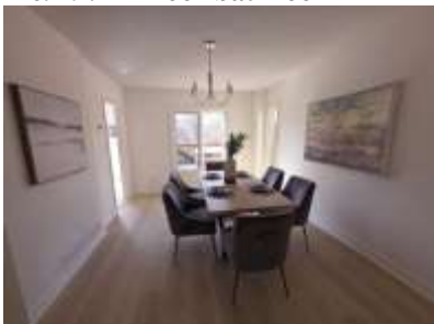
Pic. 22: Dining room