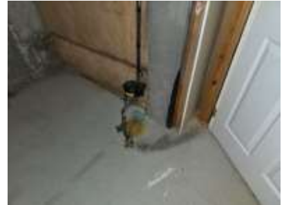
Pic. 36: Water main