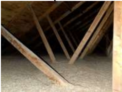
Pic. 10: Attic