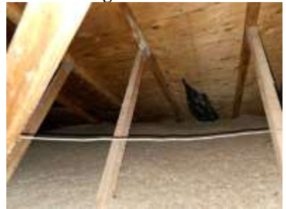
Pic. 12: Attic