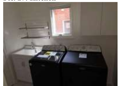
Pic. 30: Laundry