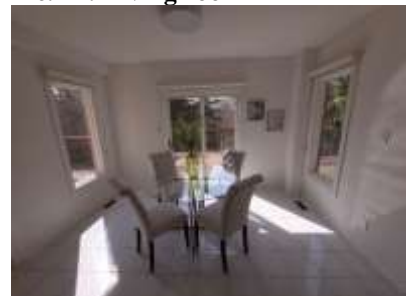
Pic. 24: Eating area