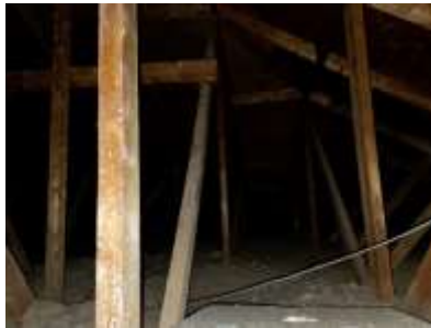
Pic. 11: Attic