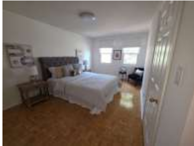
Pic. 17: Bedroom 3