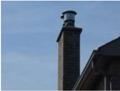
Pic. 4: Chimney