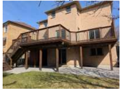
Pic. 6: Back view