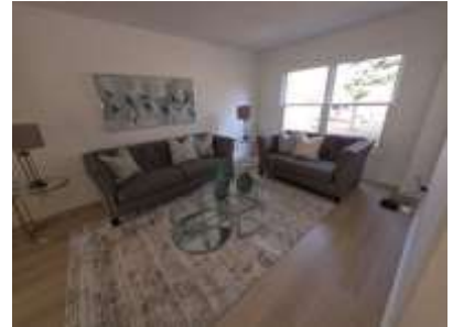
Pic. 21: Living room