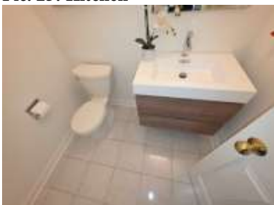
Pic. 28: Powder room