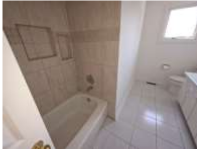
Pic. 20: 2 nd floor bathroom