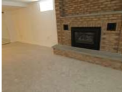
Pic. 32: Rec room