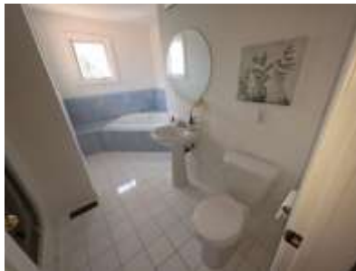
Pic. 14: Primary bathroom