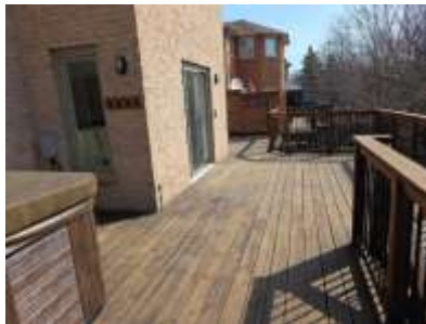
Pic. 8: Rear deck