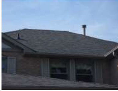
Pic. 2: roof covering