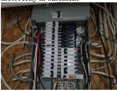
Pic. 35: 100 amp breaker panel