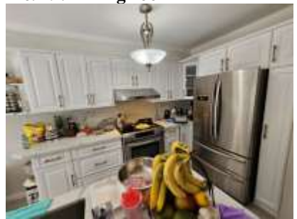
Pic. 22: Kitchen