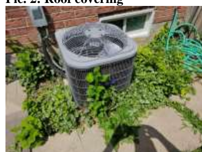
Pic. 5: AC 2020