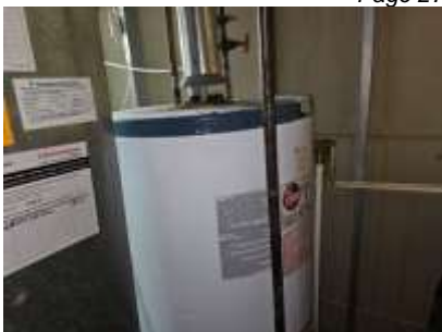
Pic. 33: Water heater 2005