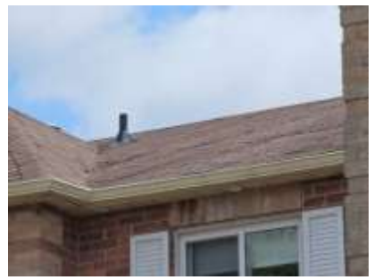
Pic. 3: Roof covering