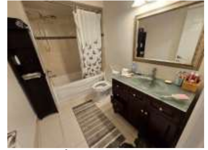
Pic. 17: 2<sup>nd</sup> floor bath