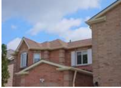
Pic. 2: Roof covering