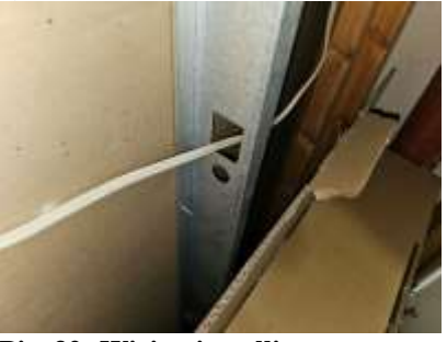
Pic. 32: Wiring installing incorrectly in basement