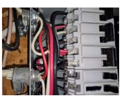
Pic. 36: Double tapped breaker