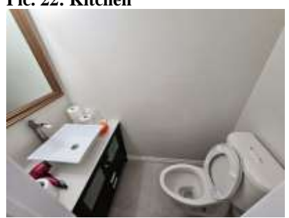
Pic. 25: Powder room