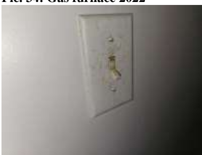
Pic. 37: Light switch for basement stairwell defective