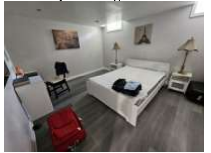
Pic. 29: Apt – Bedroom