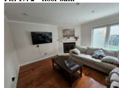
Pic. 20: Family room