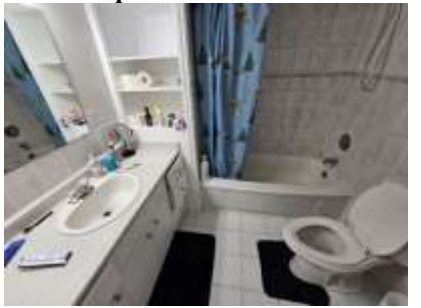
Pic. 30: Apt – Bathroom