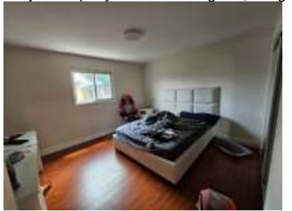
Pic. 16: Bedroom 4