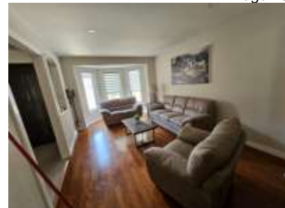
Pic. 18: Living room