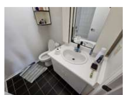
Pic. 12: Master bath