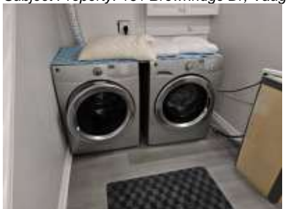
Pic. 31: Apt – Laundry