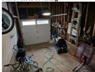
Pic. 6: Garage