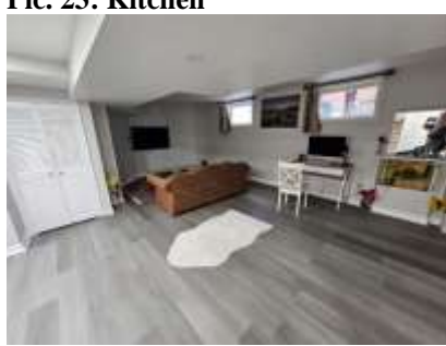
Pic. 26: Apt – Living area