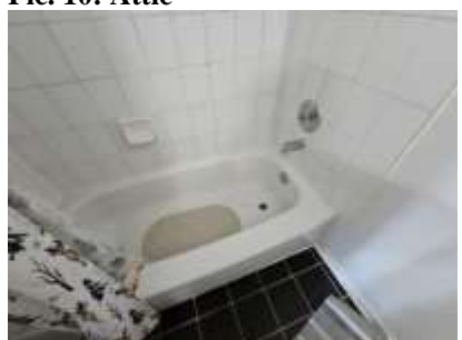
Pic. 13: Master bath