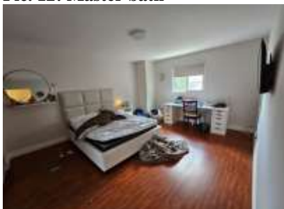
Pic. 15: Bedroom 3