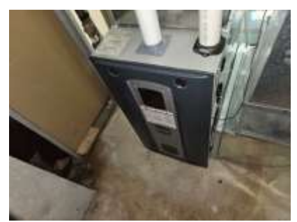
Pic. 34: Gas furnace 2022