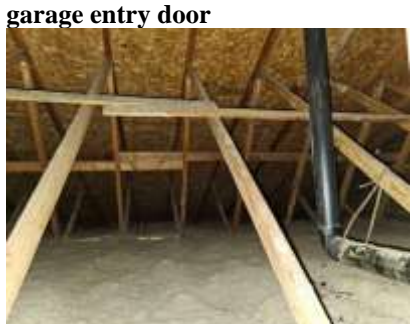
Pic. 10: Attic