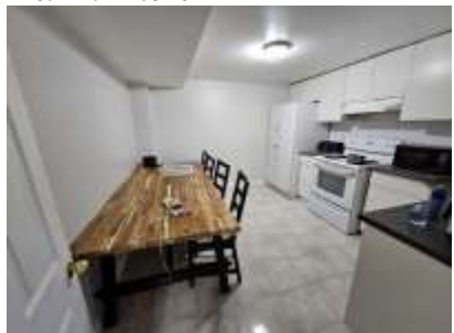
Pic. 27: Apt – Kitchen