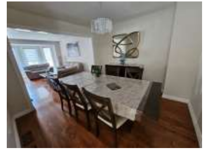
Pic. 19: Dining room