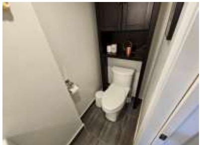
Pic. 13: Powder room