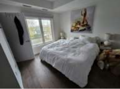
Pic. 17: Primary bedroom