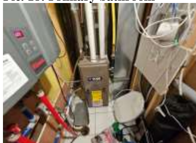
Pic. 21: Gas furnace