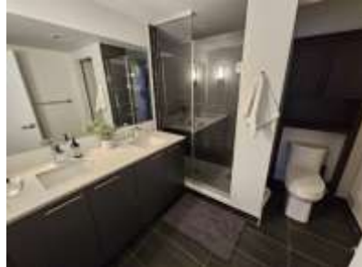
Pic. 18: Primary bathroom