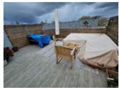
Pic. 3: Terrace