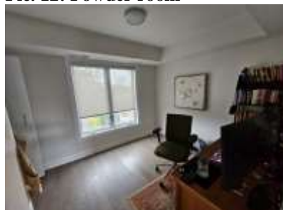
Pic. 15: Bedroom 2