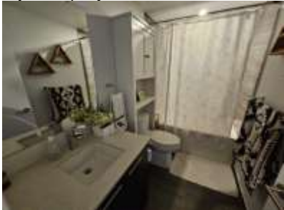
Pic. 16: Main floor bath