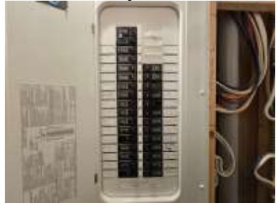
Pic. 22: 100 amp breaker panel