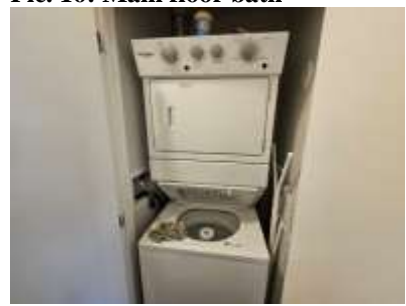
Pic. 19: Laundry