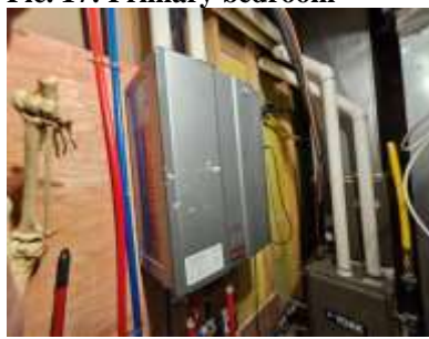
Pic. 20: Tankless hot water