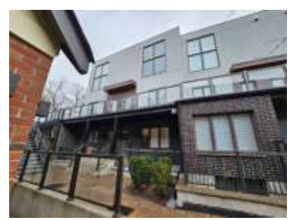
Pic. 1: Building view