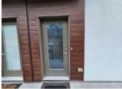
Pic. 2: Front door on second level