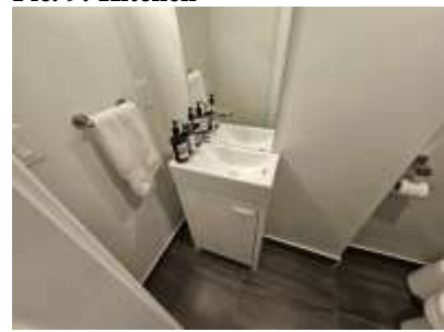
Pic. 12: Powder room