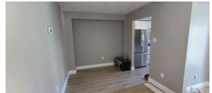
Pic. 15: Dining room