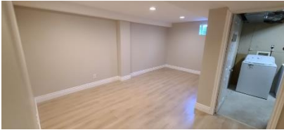
Pic. 25: Rec room