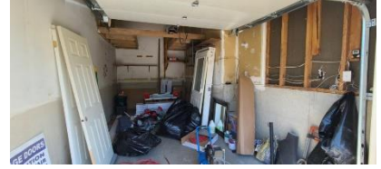
Pic. 3: Garage