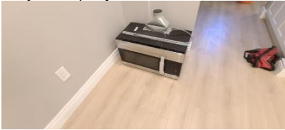
Pic. 22: Microwave exhaust to be installed