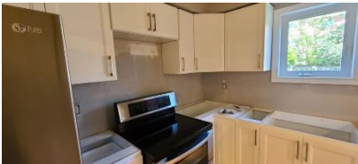
Pic. 16: Kitchen