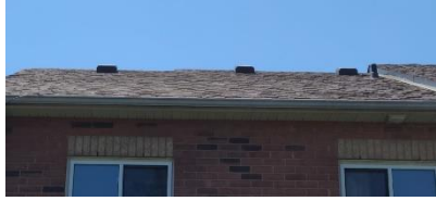
Pic. 5: Roof covering