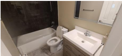
Pic. 13: 2 nd floor bath