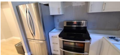
Pic. 19: Kitchen