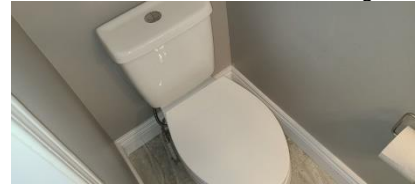
Pic. 24: Powder room