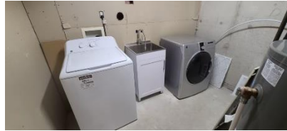
Pic. 26: Laundry