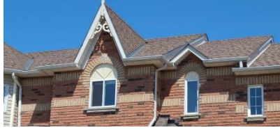
Pic. 2: Updated roof covering