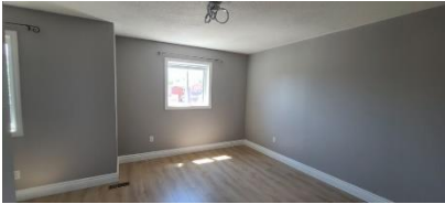
Pic. 10: Master bedroom