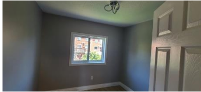
Pic. 11: Bedroom 2