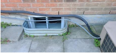
Pic. 7: AC line should be secured