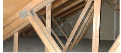
Pic. 9: Attic