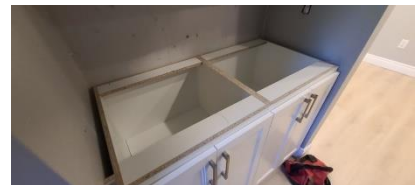
Pic. 21: Kitchen