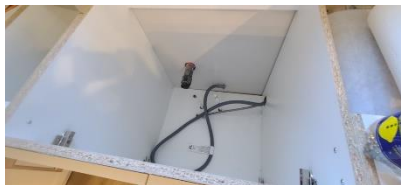
Pic. 20: Kitchen