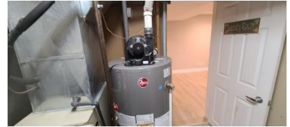
Pic. 27: Rental hot water tank