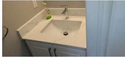
Pic. 23: Powder room