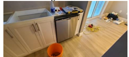
Pic. 18: Kitchen