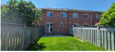
Pic. 4: Back view