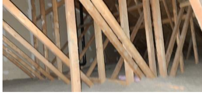
Pic. 8: Attic