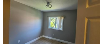
Pic. 12: Bedroom 3