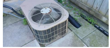
Pic. 6: AC unit 1999