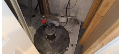
Pic. 29: Sump pump