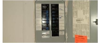
Pic. 30: 100 amp breaker panel