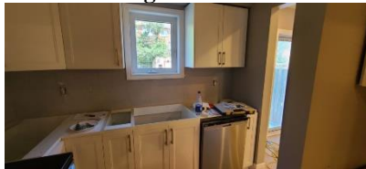
Pic. 17: Kitchen