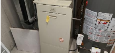
Pic. 28: Gas furnace 1997