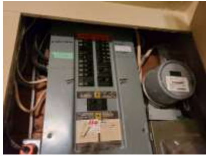
Pic. 29: 100 amp breaker panel