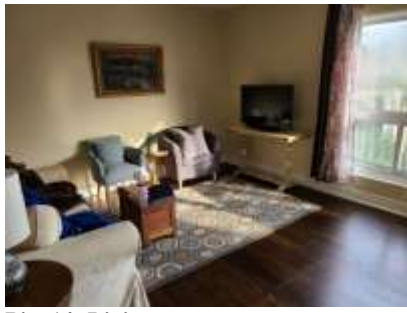
Pic. 14: Living room