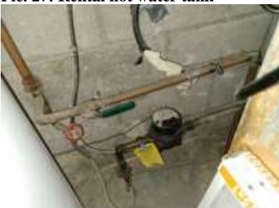
Pic. 30: Water main