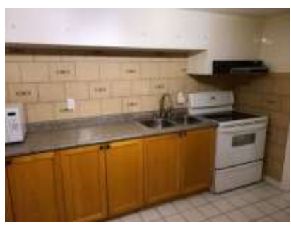
Pic. 23: Basement kitchen