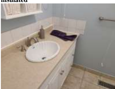
Pic. 11: Main floor bath