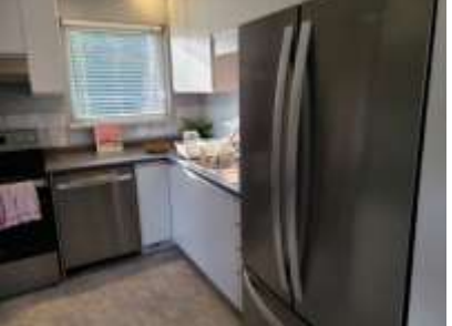
Pic. 17: Kitchen