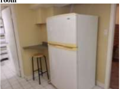
Pic. 24: Basement kitchen