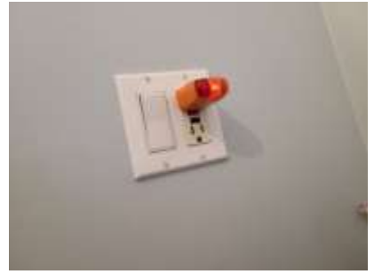
Pic. 13: Open ground outlet in bathroom and most of the main floor