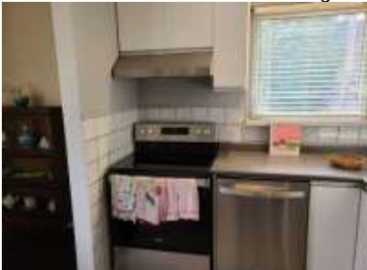
Pic. 18: Kitchen