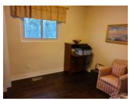
Pic. 10: Bed 2