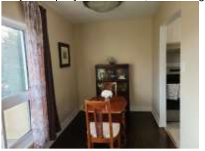
Pic. 16: Dining room