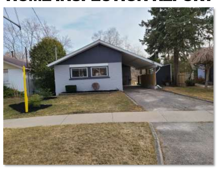
16 Firth Cres, Scarborough, Ontario