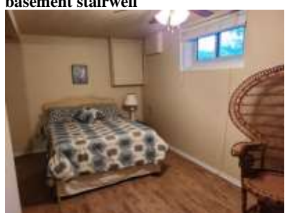
Pic. 22: Bed 3