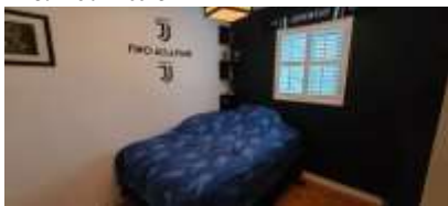
Pic. 13: Bedroom 2