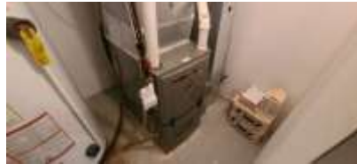
Pic. 26: Gas furnace 2014