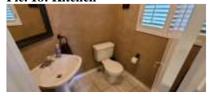
Pic. 21: Powder room