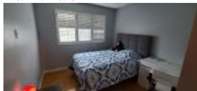
Pic. 14: Bedroom 3