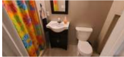
Pic. 23: Basement bath