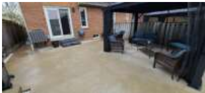
Pic. 7: Patio