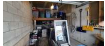
Pic. 9: Garage