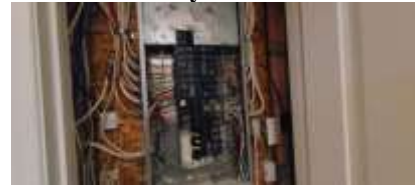
Pic. 27: 100 amp breaker panel