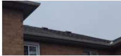
Pic. 5: Roof covering