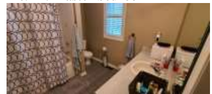
Pic. 15: 2 nd floor bath