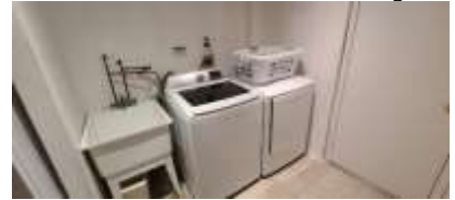
Pic. 24: Laundry