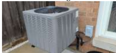
Pic. 8: AC unit 2014