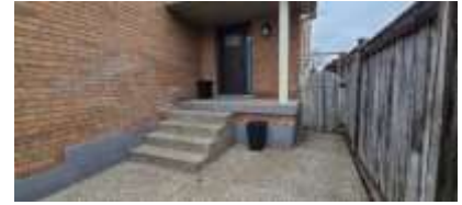
Pic. 3: Recommend railing and handrailing at front porch