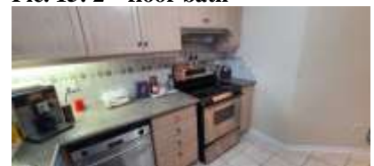
Pic. 18: Kitchen