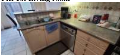
Pic. 19: Kitchen