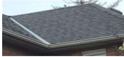
Pic. 2: updated roof covering