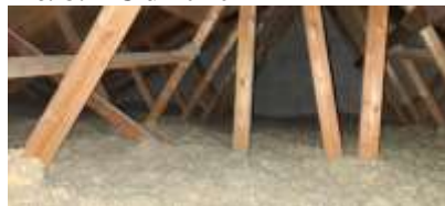
Pic. 11: Attic