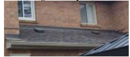
Pic. 6: Roof covering