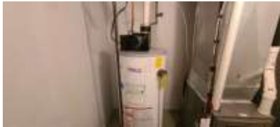
Pic. 25: Rental hot water tank 2012