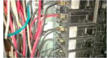
Pic. 39: Several breakers are double tapped