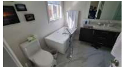
Pic. 12: Master bath