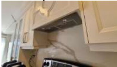
Pic. 26: Kitchen