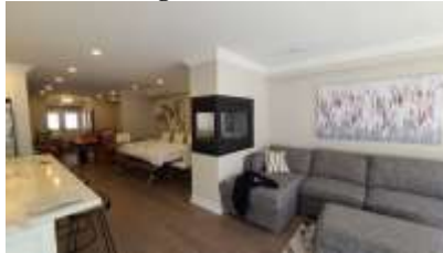
Pic. 23: Family room