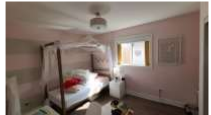
Pic. 15: Bed 3