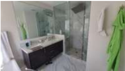
Pic. 13: Master bath