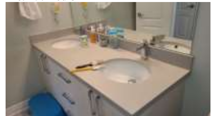
Pic. 18: 2 nd floor bath