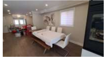
Pic. 21: Dining room