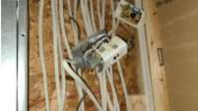
Pic. 40: Outlet needs to be properly secured