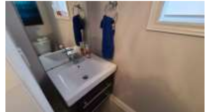
Pic. 27: Powder room