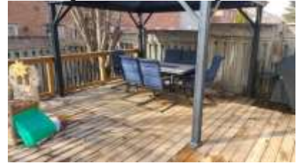
Pic. 6: Rear deck