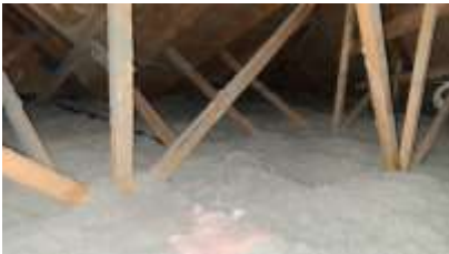
Pic. 10: Attic