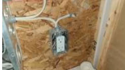
Pic. 41: Cover plates required where missing