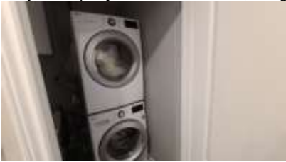
Pic. 19: Laundry