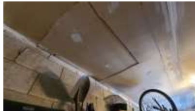
Pic. 8: Gas sealing required inside the garage