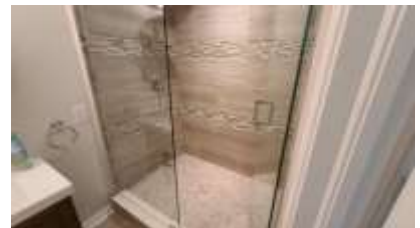
Pic. 33: Basement bath