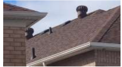
Pic. 3: Updated roof covering