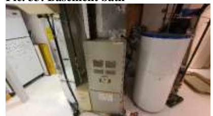
Pic. 36: Gas furnace 2000