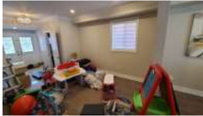
Pic. 20: Living room