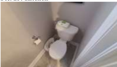
Pic. 28: Powder room