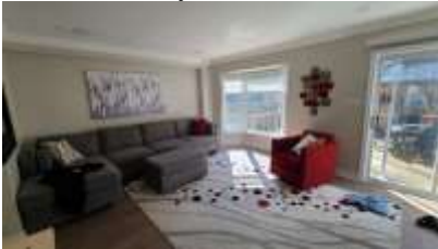
Pic. 22: Family room