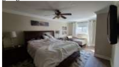
Pic. 11: Master bedroom