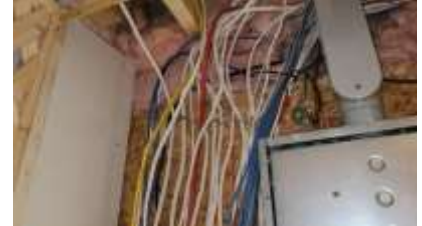
Pic. 42: Loose wires around the panel need to be properly secured