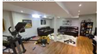
Pic. 30: Rec room