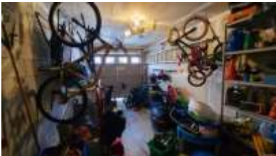
Pic. 7: Garage