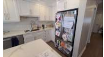
Pic. 24: Kitchen