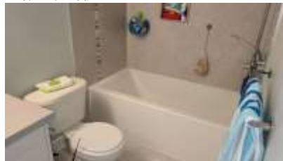
Pic. 17: 2 nd floor bath