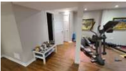
Pic. 31: Rec room