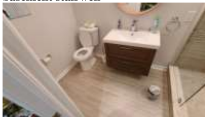
Pic. 32: Basement bath