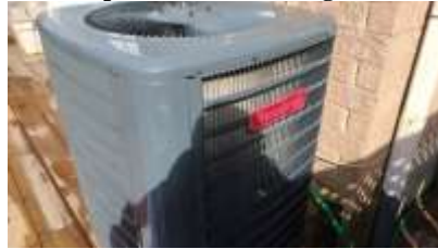
Pic. 5: AC unit 2019