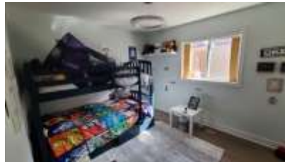
Pic. 14: Bed 2