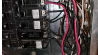
Pic. 38: Several breakers are double tapped