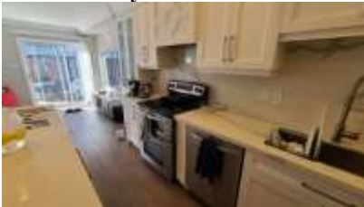
Pic. 25: Kitchen