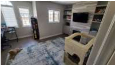
Pic. 16: Den