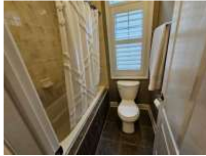
Pic. 17: Joint ensuite