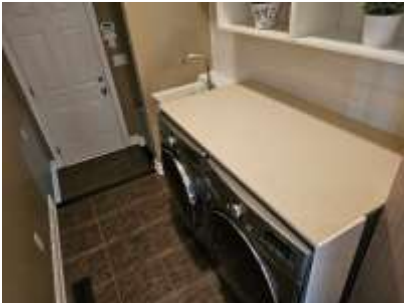
Pic. 28: Laundry