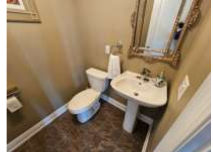
Pic. 27: Powder room