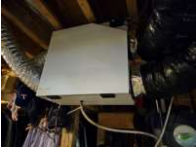
Pic. 34: HRV system