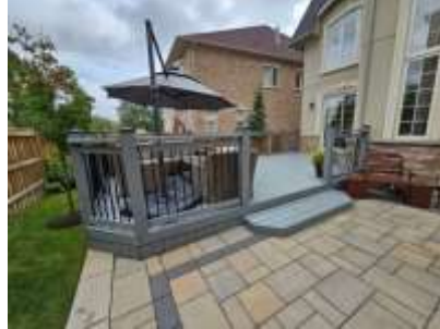
Pic. 5: Deck