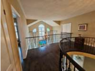
Pic. 19: Upper hall