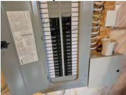
Pic. 37: 200 amp breaker panel