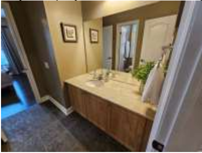
Pic. 16: Joint ensuite