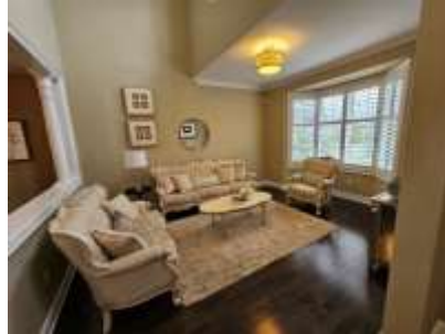
Pic. 20: Living room