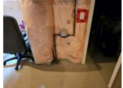
Pic. 36: Water main