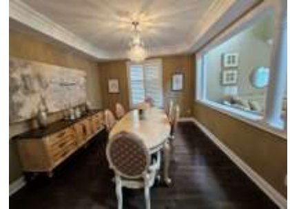
Pic. 21: Dining room