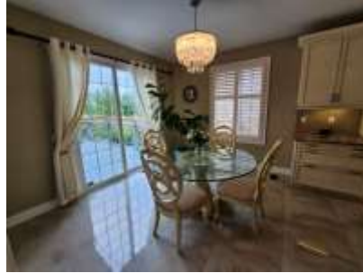
Pic. 23: Eating area