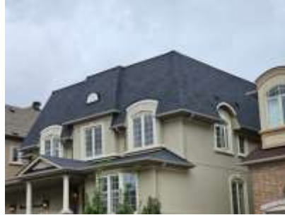
Pic. 2: Visible roof covering