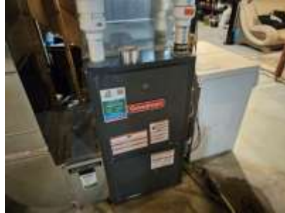
Pic. 35: Gas furnace 2014