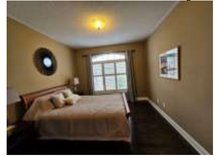
Pic. 18: Bedroom 4