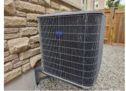
Pic. 3: AC unit 2014