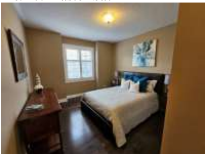
Pic. 13: Bedroom 2