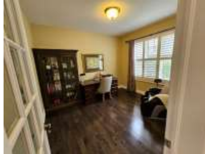
Pic. 26: Office