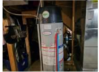
Pic. 33: Rental hot water tank 2014