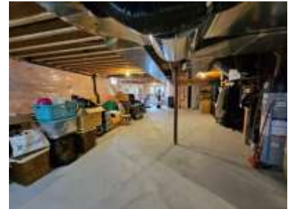
Pic. 30: Basement