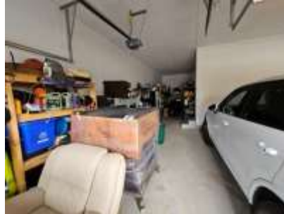
Pic. 8: Garage