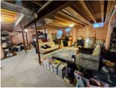
Pic. 31: Basement