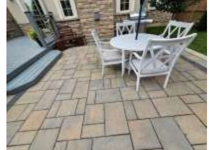
Pic. 6: Patio