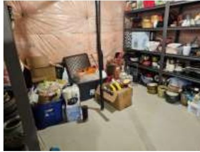
Pic. 32: Rough in for bathroom