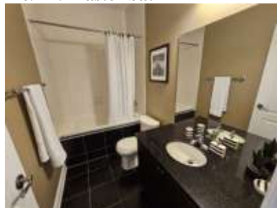
Pic. 14: Ensuite