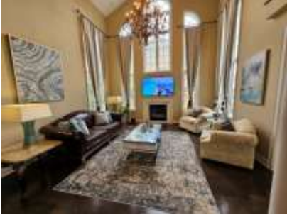
Pic. 22: Family room