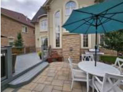
Pic. 4: Backyard