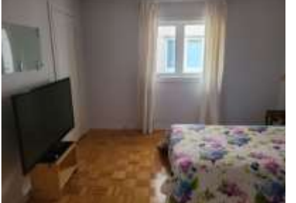
Pic. 16: Bed 3