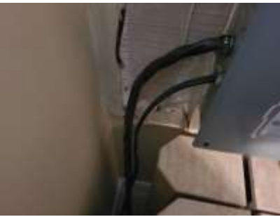
Pic. 38: Wiring needs to be properly secured