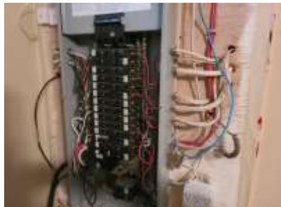
Pic. 37: 200 amp breaker panel