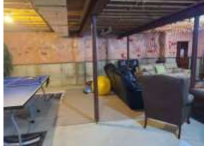
Pic. 31: Unfinished basement