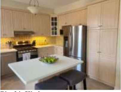
Pic. 24: Kitchen