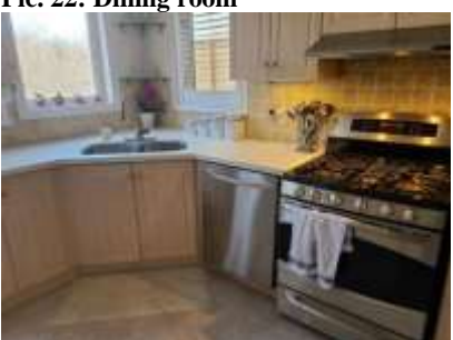
Pic. 25: Kitchen