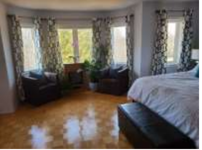
Pic. 9: Master bedroom