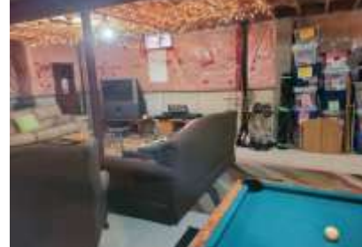
Pic. 32: Unfinished basement