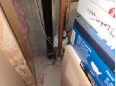
Pic. 36: Water main