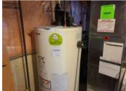
Pic. 34: Hot water tank 2019