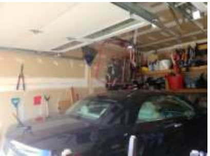
Pic. 6: Garage