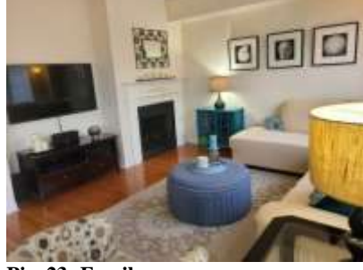
Pic. 23: Family room