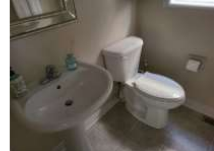
Pic. 29: Powder room