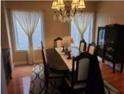
Pic. 22: Dining room