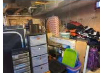
Pic. 33: Unfinished basement