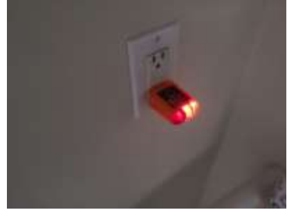
Pic. 30: GFCI outlet in powder room should be replaced