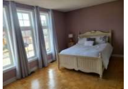
Pic. 19: Bed 4