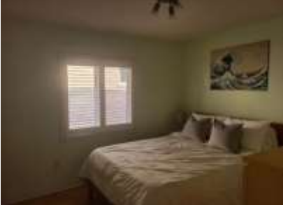
Pic. 13: Bed 2