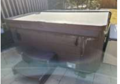
Pic. 4: Working hot tub