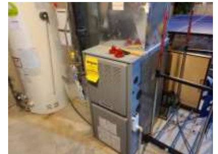
Pic. 35: Gas furnace 2001