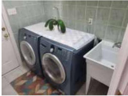
Pic. 28: Laundry