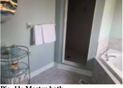
Pic. 11: Master bath