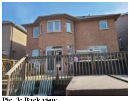
Pic. 3: Back view