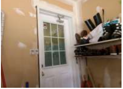
Pic. 7: Entry door not fire rated – glass insert