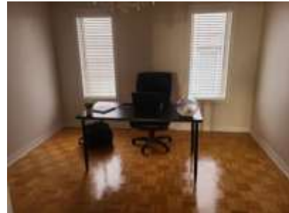
Pic. 20: Office / Den