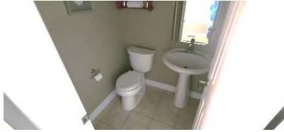
Pic. 23: Powder room