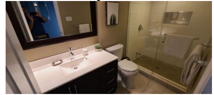
Pic. 27: Basement bath