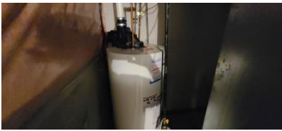
Pic. 28: Rental hot water tank 2015