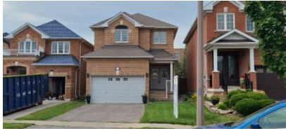
Pic. 1: Front view