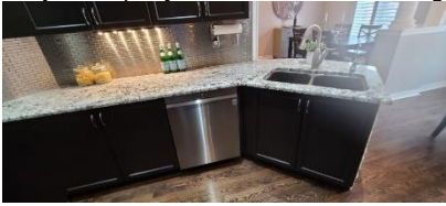
Pic. 22: Kitchen