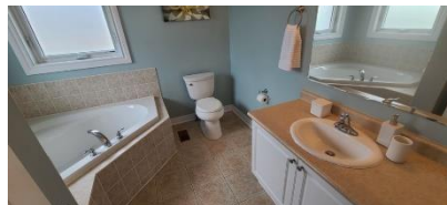
Pic. 11: Master bath