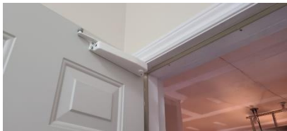
Pic. 7: Auto closer needs to be connected