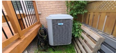
Pic. 5: AC unit 2006