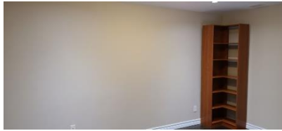
Pic. 26: Basement room