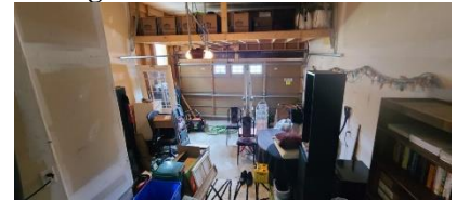
Pic. 6: Garage