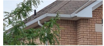
Pic. 3: South side of the roof curling