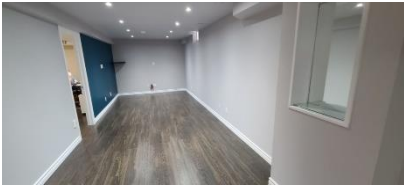
Pic. 25: Rec room