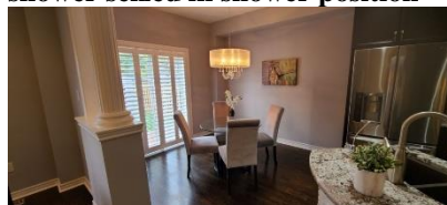
Pic. 20: Eating area