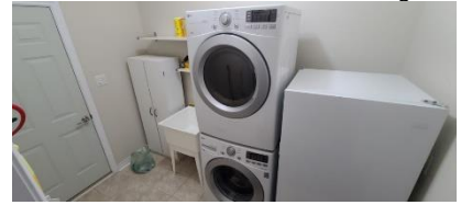
Pic. 24: Laundry