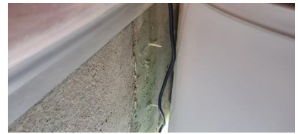
Pic. 30: Professionally repaired foundation crack