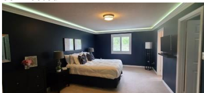
Pic. 10: Master bedroom