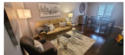
Pic. 18: Living room