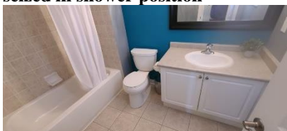
Pic. 16: 2 nd floor bath