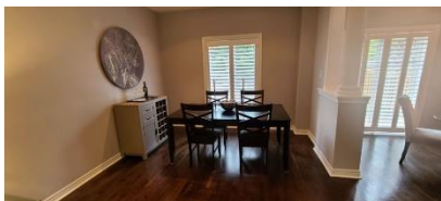
Pic. 19: Dining room