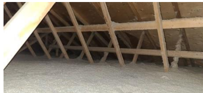
Pic. 8: Attic