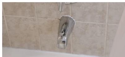
Pic. 17: Bathtub water diverter in shower seized in shower position