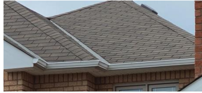
Pic. 2: Original roof covering