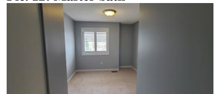
Pic. 15: Bedroom 3