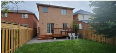
Pic. 4: Back view