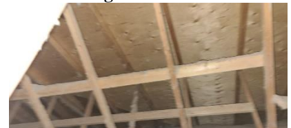
Pic. 9: Attic