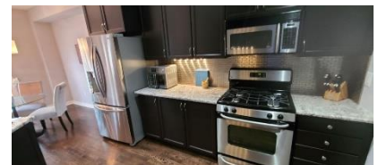
Pic. 21: Kitchen