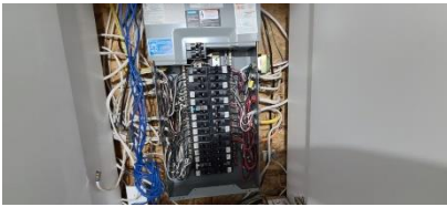
Pic. 31: 100-amp breaker panel with all copper wire