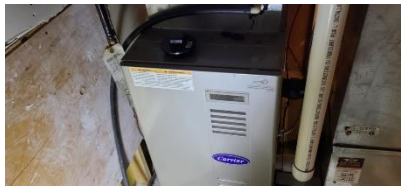
Pic. 29: Gas furnace 2005