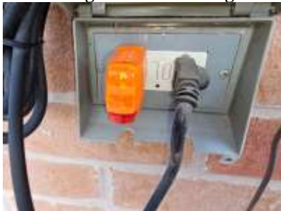
Pic. 7: Rear GFCI won't trip and should be replaced