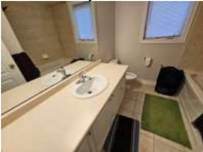
Pic. 16: 2 nd floor bathroom