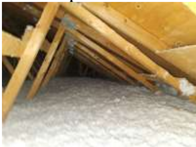
Pic. 10: Attic