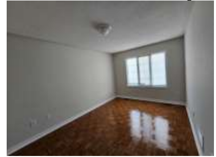
Pic. 15: Bedroom 3