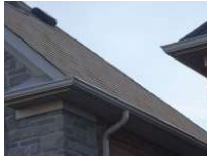
Pic. 2: Original roof covering