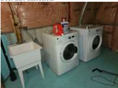
Pic. 25: Laundry