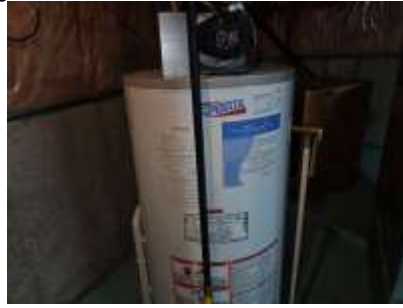
Pic. 29: Water heater 2009