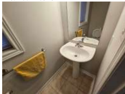
Pic. 23: Powder room