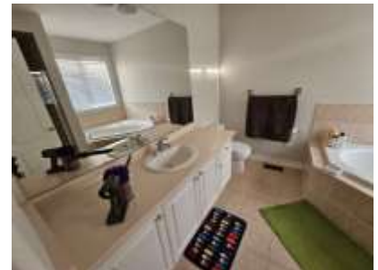
Pic. 12: Primary bathroom