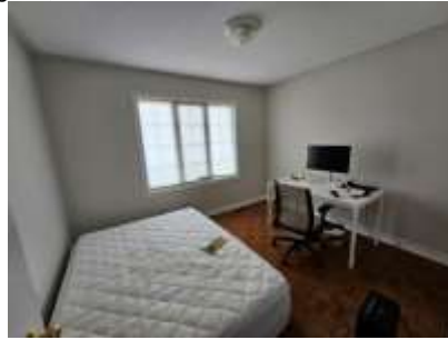
Pic. 14: Bedroom 2