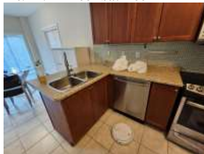
Pic. 20: Kitchen