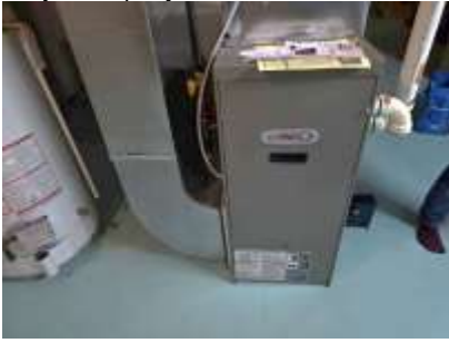
Pic. 28: Gas furnace 2009