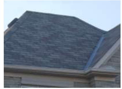
Pic. 3: Original roof covering