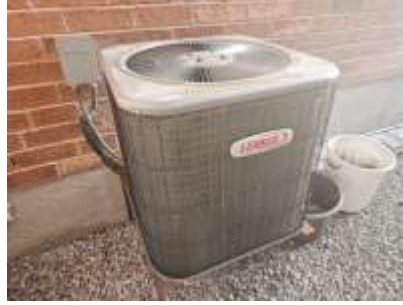
Pic. 5: AC 2009