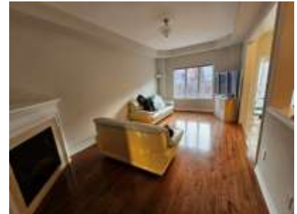
Pic. 18: Living room