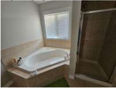
Pic. 13: Primary bathroom