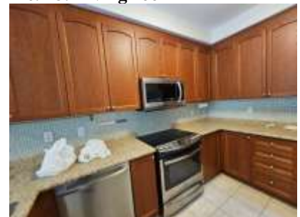
Pic. 21: Kitchen