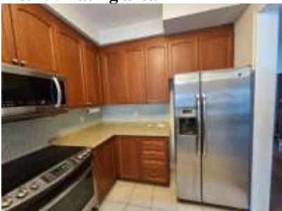
Pic. 22: Kitchen