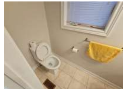
Pic. 24: Powder room