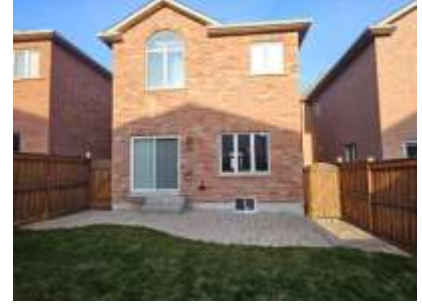
Pic. 6: Back view