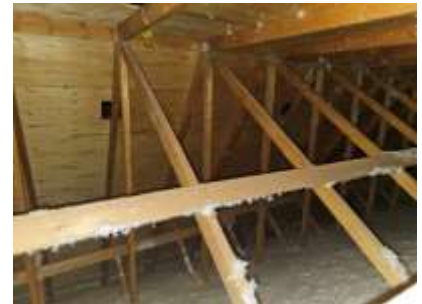
Pic. 9: Attic