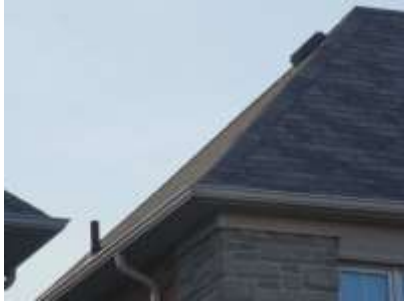
Pic. 4: Original roof covering