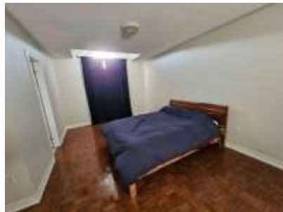
Pic. 11: Primary bedroom