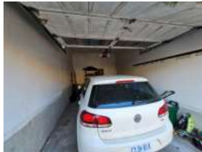
Pic. 8: Garage