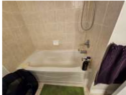
Pic. 17: 2 nd floor bathroom