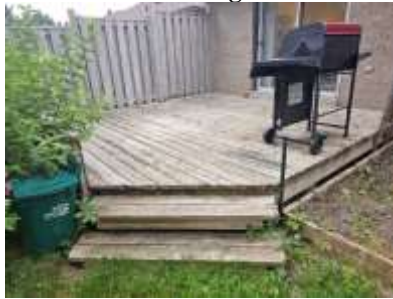
Pic. 5: Deck – again and needs some repairs