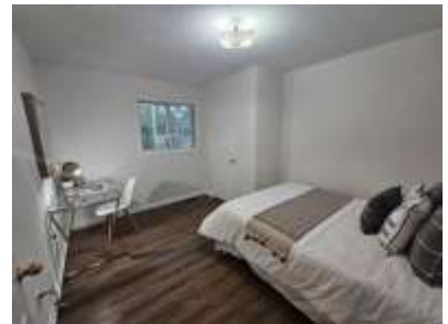
Pic. 12: Bedroom 3