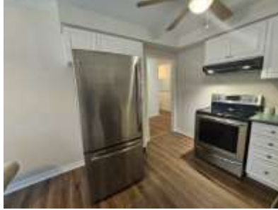
Pic. 17: Kitchen