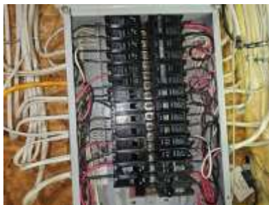
Pic. 29: 100 amp breaker panel