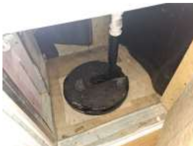
Pic. 26: Sump pump