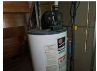
Pic. 27: Rental hot water tank 2008