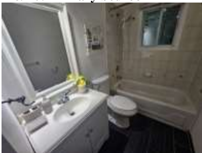
Pic. 13: Main bathroom