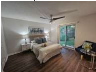
Pic. 10: Primary bedroom