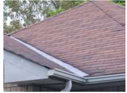
Pic. 3: Roof covering