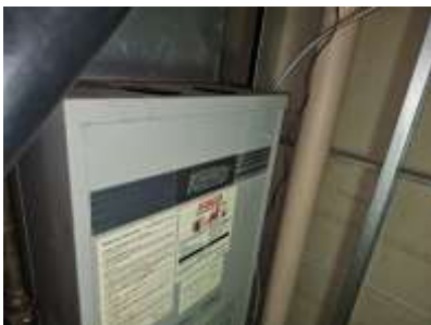
Pic. 28: Original gas furnace 1993