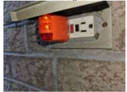
Pic. 6: Rear GFCI outlet won't trip