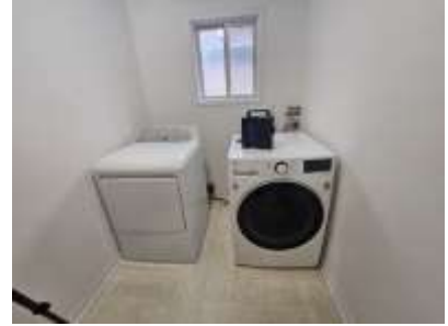
Pic. 18: Laundry