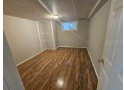
Pic. 21: Apt – Bedroom 1