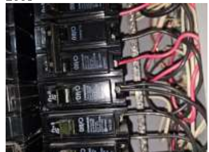
Pic. 30: 1 breaker double tapped