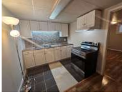
Pic. 20: Apt – Kitchen