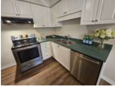
Pic. 16: Kitchen