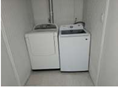
Pic. 31: Apt - Laundry