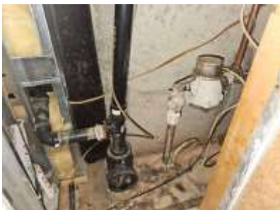
Pic. 25: Water main