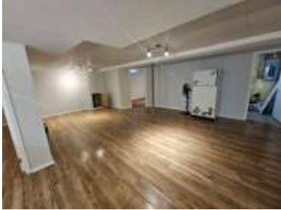
Pic. 19: Apt – Living area