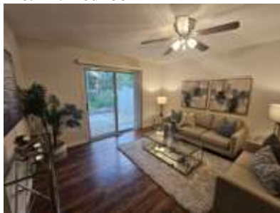
Pic. 14: Living room