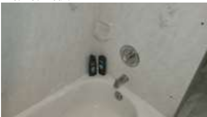
Pic. 31: Basement bath