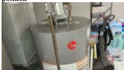
Pic. 35: Water heater 2012