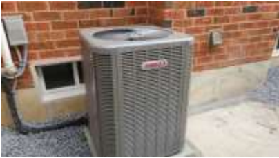
Pic. 4: AC unit 2016