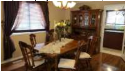
Pic. 19: Dining room