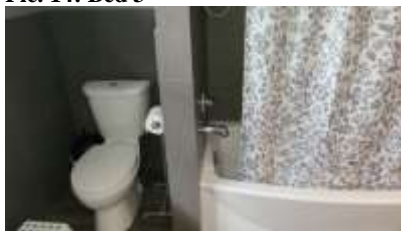
Pic. 17: 2nd floor bath