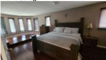
Pic. 10: Master bedroom