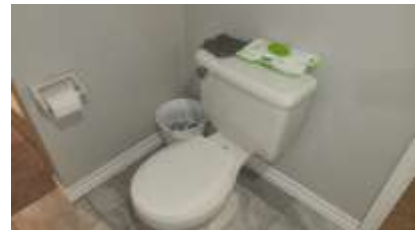
Pic. 30: Basement bath