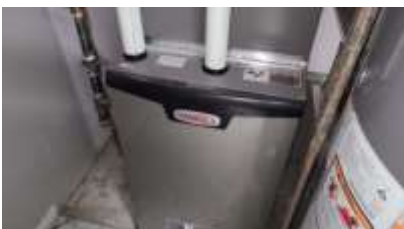
Pic. 34: Gas furnace 2016