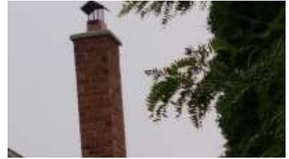
Pic. 3: Chimney