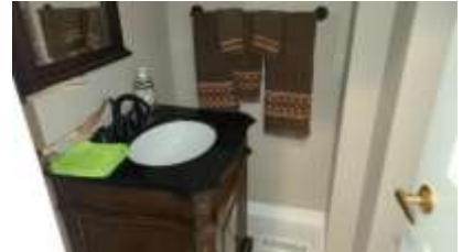
Pic. 24: Powder room