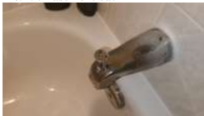
Pic. 32: Diverter seized in shower position