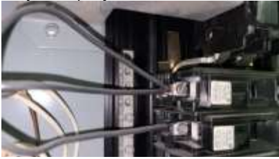
Pic. 40: Double tapped breaker