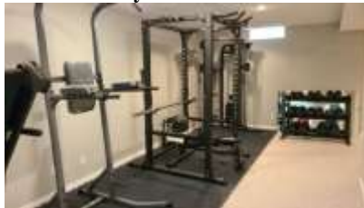
Pic. 26: Rec room