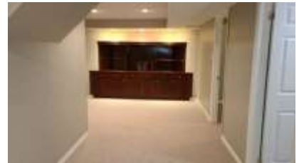
Pic. 27: Rec room