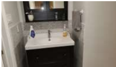
Pic. 29: Basement bath