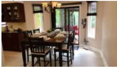
Pic. 20: Eatng area