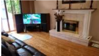
Pic. 23: Family room