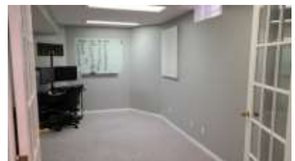
Pic. 36: Office