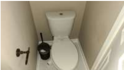
Pic. 25: Powder room