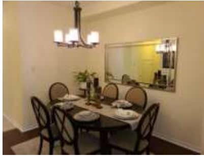
Pic. 17: Dining room