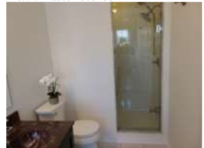
Pic. 12: Master bath