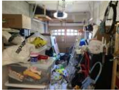
Pic. 5: Garage