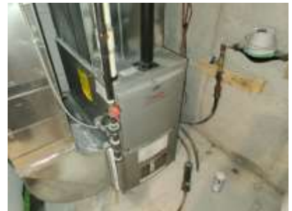
Pic. 30: Gas furnace 2012