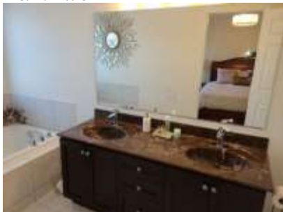
Pic. 10: Master bath