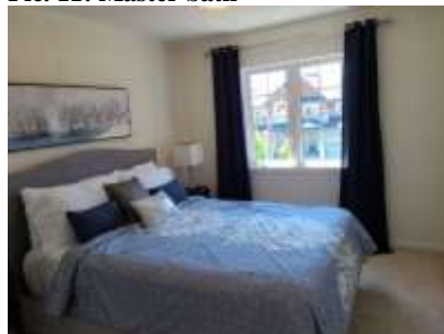
Pic. 14: Bed 3