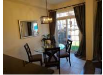
Pic. 18: Eating area