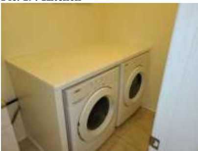
Pic. 22: Laundry