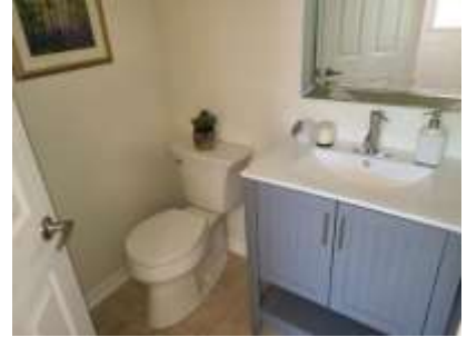
Pic. 21: Powder room