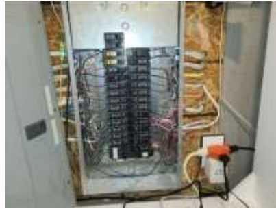
Pic. 32: 100 amp electrical panel