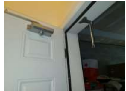
Pic. 6: Garage entry door auto closer should be reconnected