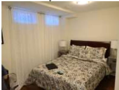
Pic. 26: Bed 4