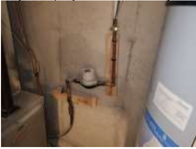
Pic. 31: Water main