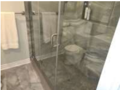
Pic. 28: Basement bath