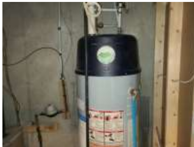
Pic. 29: Rental hot water tank