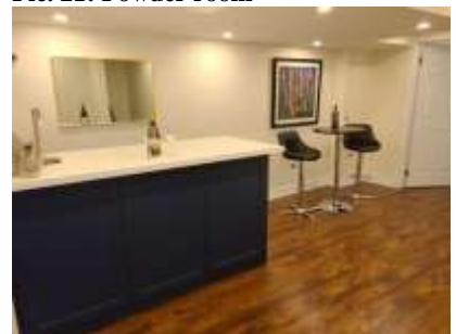
Pic. 24: Rec room