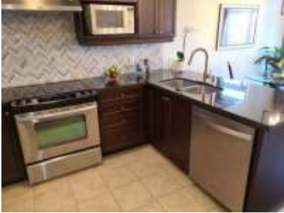
Pic. 19: Kitchen