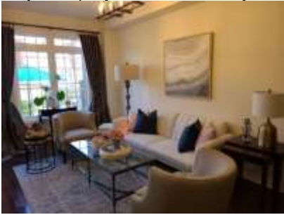
Pic. 16: Living room