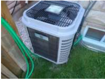
Pic. 4: AC unit 2012