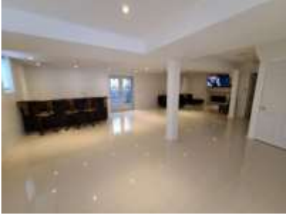
Pic. 31: Rec room