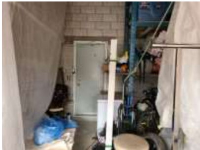
Pic. 7: Garage