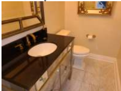
Pic. 26: Powder room