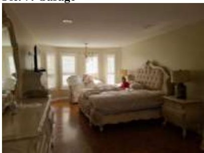
Pic. 10: Master bedroom