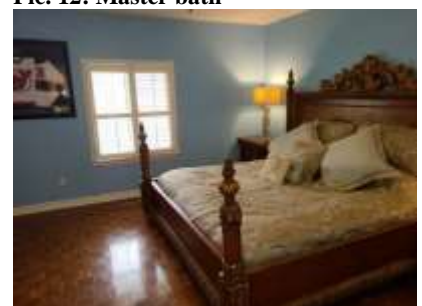
Pic. 15: Bed 3