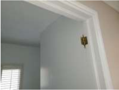
Pic. 19: Missing door for bath