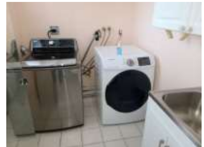
Pic. 27: Laundry