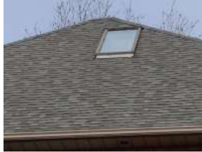
Pic. 2: Updated roof covering