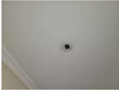
Pic. 20: Missing smoke / CO detector