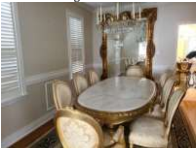
Pic. 22: Dining room