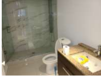
Pic. 32: Basement bath