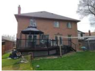
Pic. 5: Back view