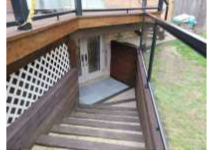
Pic. 6: Recommend handrailing for basement entrance stairwell