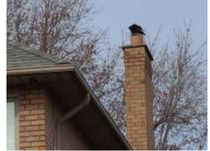
Pic. 3: Chimney