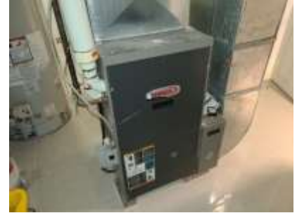
Pic. 36: Gas furnace 2008