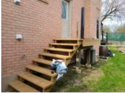
Pic. 4: Missing railing and handrail on side deck