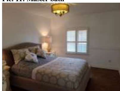
Pic. 14: Bed 2