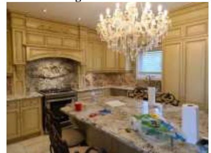
Pic. 24: Kitchen