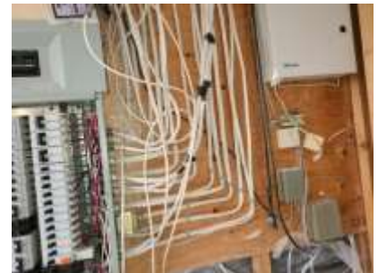
Pic. 42: Some wires need to be properly secured at the panel