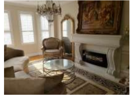
Pic. 21: Living room