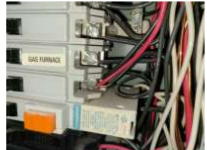
Pic. 39: Multi-tapped breaker