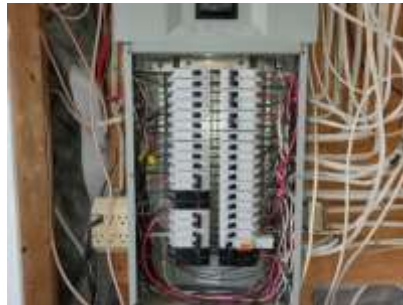
Pic. 38: 200 amp breaker panel with all copper wire