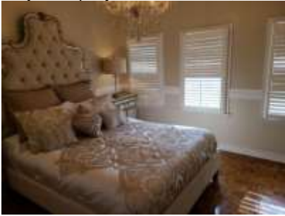
Pic. 16: Bed 4