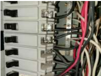
Pic. 40: Multi-tapped breaker