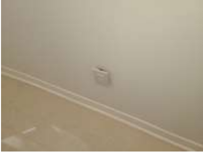
Pic. 34: Front wall outlet loose and needs to be properly secured