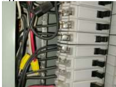
Pic. 41: Multi-tapped breaker