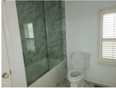
Pic. 17: 2 nd floor bath