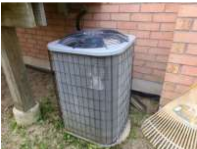
Pic. 43: AC unit 2013