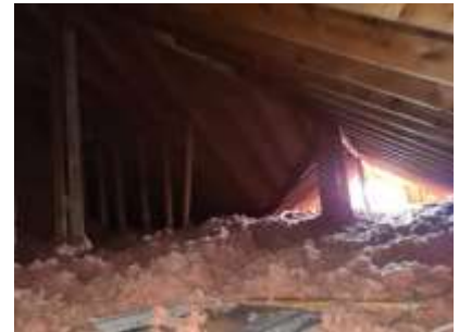
Pic. 9: Attic