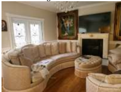
Pic. 23: Family room