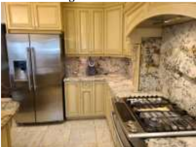
Pic. 25: Kitchen