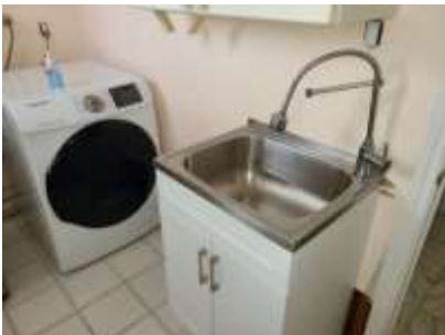
Pic. 28: Laundry