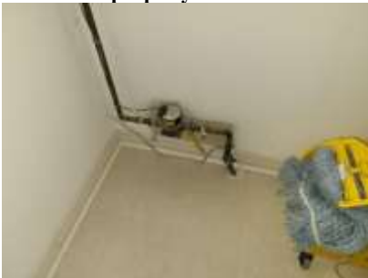
Pic. 37: Water main