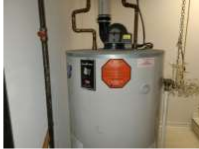
Pic. 35: Hot water tank