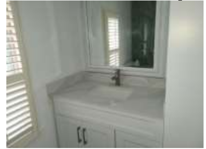
Pic. 18: 2 nd floor bath