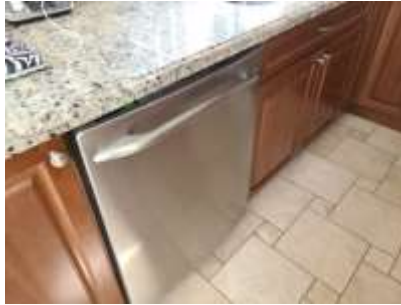
Pic. 20: Kitchen