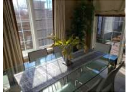
Pic. 21: Eating area