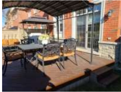
Pic. 2: Rear deck