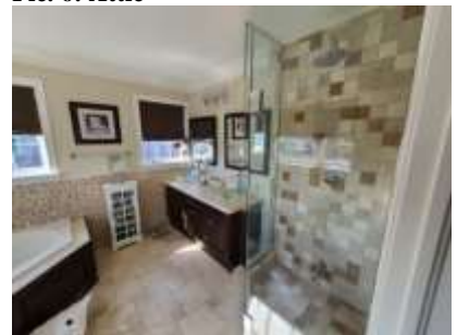
Pic. 9: Master bath