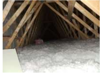
Pic. 6: Attic