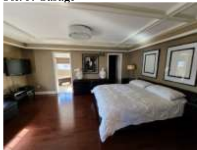
Pic. 8: Master bedroom