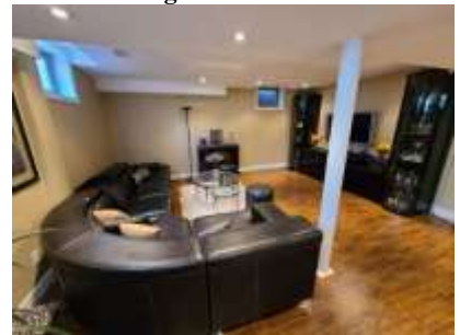
Pic. 24: Recd room