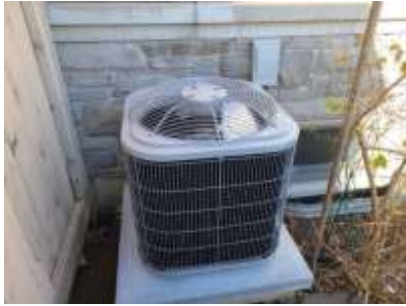
Pic. 4: New AC unit