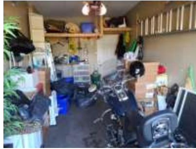
Pic. 5: Garage