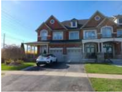
Pic. 1: Front view