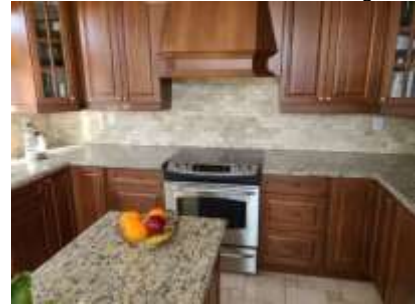
Pic. 18: Kitchen