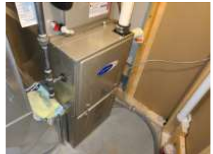
Pic. 30: New gas furnace