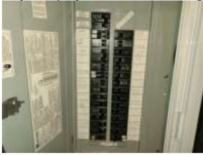
Pic. 31: 100 amp breaker panel all copper wire