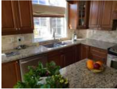
Pic. 17: Kitchen