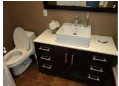
Pic. 27: Basement bath