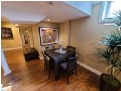
Pic. 25: Rec room