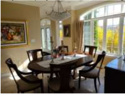
Pic. 16: Dining room