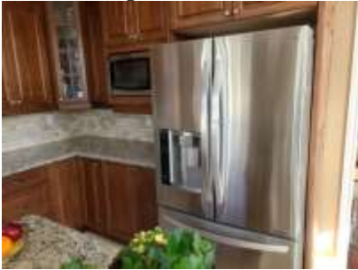
Pic. 19: Kitchen