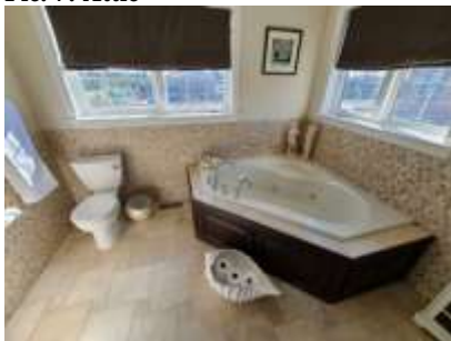
Pic. 10: Master bath