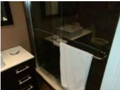
Pic. 28: Basement bath