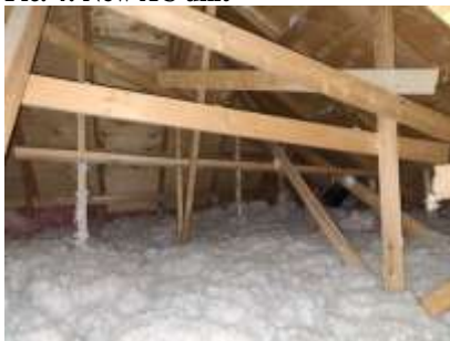
Pic. 7: Attic