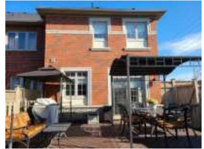
Pic. 3: Back view