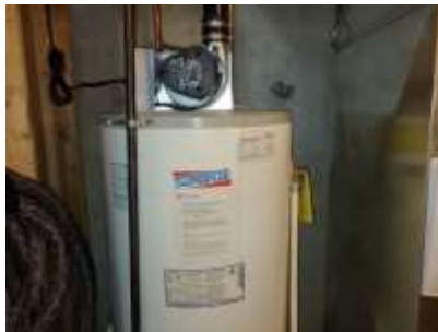
Pic. 29: Original rental hot water tank