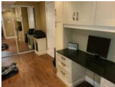
Pic. 26: Basement room