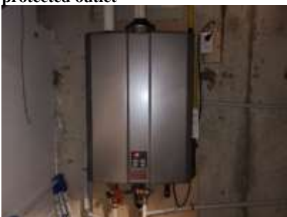
Pic. 28: Tankless hot water 2018