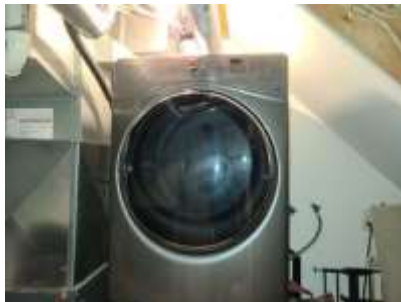
Pic. 26: Laundry