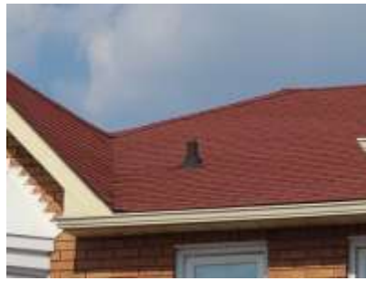
Pic. 2: Roof covering about mid life