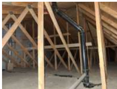
Pic. 8: Attic