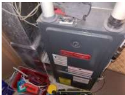
Pic. 29: Gas furnace 2013