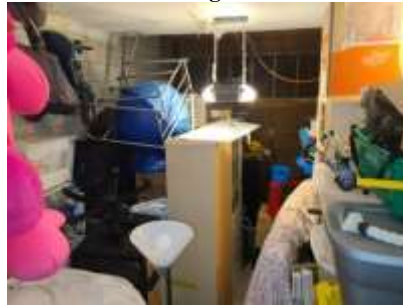
Pic. 5: Garage