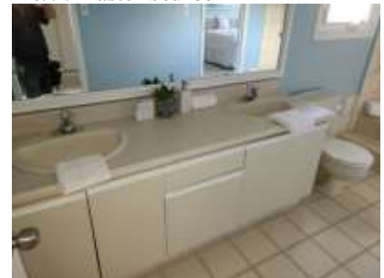
Pic. 12: 2 nd floor bath