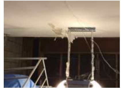
Pic. 6: Old ceiling damage – repair accordingly