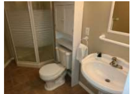
Pic. 24: Basement bath