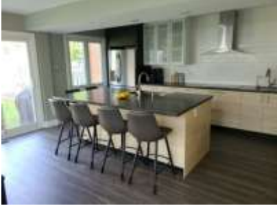
Pic. 16: Kitchen