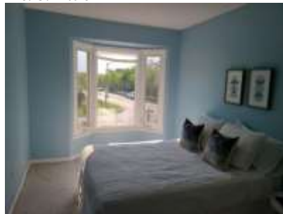
Pic. 11: Bed 3