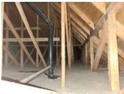
Pic. 7: Attic