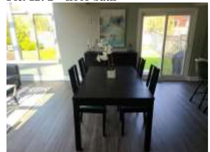
Pic. 15: Dining room