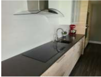
Pic. 17: Kitchen