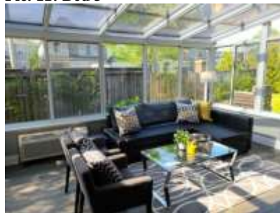
Pic. 14: Living room