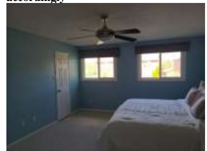
Pic. 9: Master bedroom