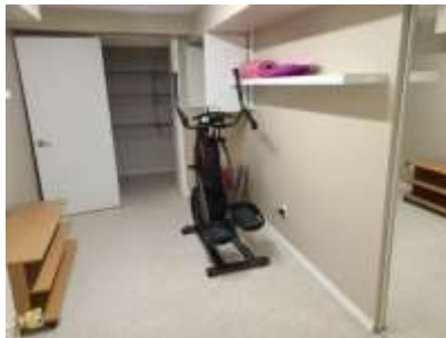
Pic. 23: Basement room