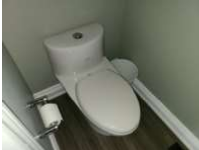
Pic. 20: Powder room