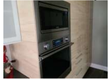
Pic. 18: Kitchen