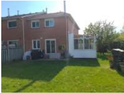
Pic. 4: Back view