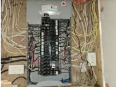
Pic. 31: 100 amp breaker panel