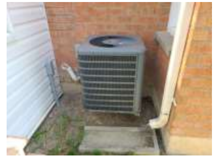
Pic. 3: AC unit 2013