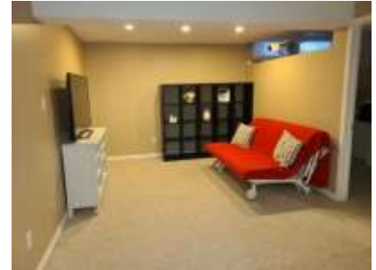
Pic. 21: Rec room