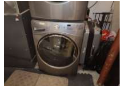
Pic. 27: Laundry