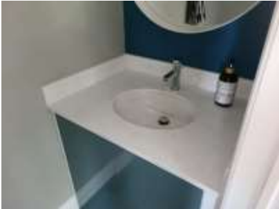
Pic. 19: Powder room