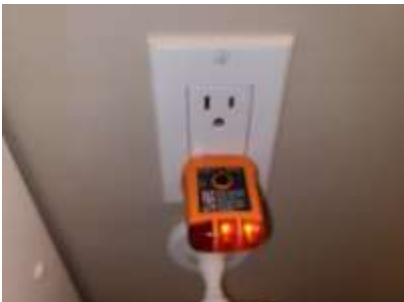
Pic. 25: Recommend updating the basement bath outlet to a GFCI protected outlet