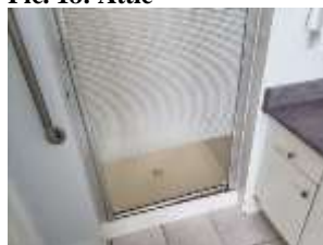
Pic. 22: Master bath