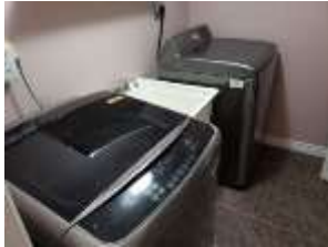
Pic. 29: Laundry