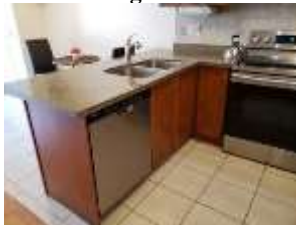
Pic. 13: Kitchen