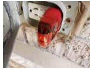
Pic. 3: Front GFCI defective