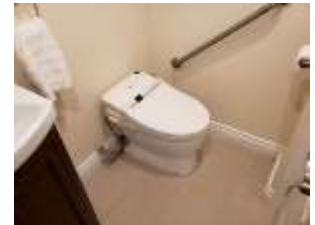
Pic. 16: Powder room