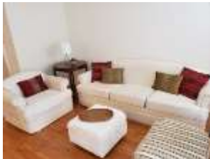
Pic. 9: Living room