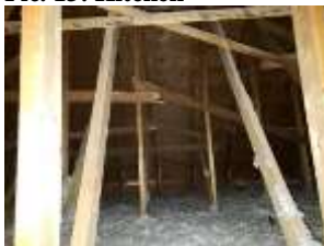
Pic. 17: Attic