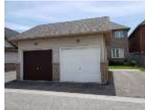
Pic. 7: Garage