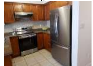
Pic. 12: Kitchen