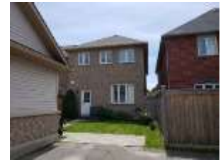
Pic. 4: Back view