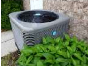
Pic. 5: AC unit 2016