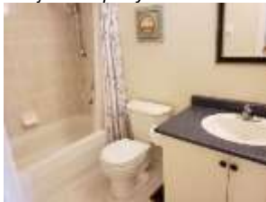
Pic. 25: 2 nd floor bath