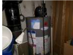
Pic. 31: Rental hot water tank