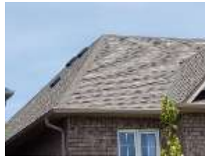
Pic. 2: Updated roof covering