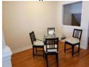
Pic. 10: Dining room