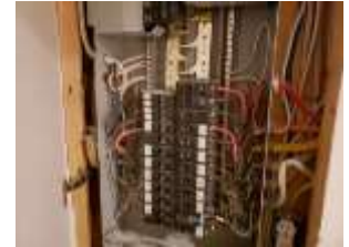
Pic. 32: 100 amp breaker panel