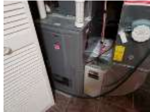
Pic. 30: Gas furnace 2016