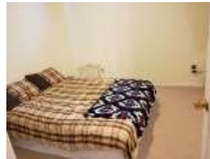
Pic. 27: Basement room / bed 4