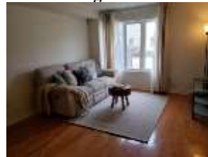
Pic. 11: Family room