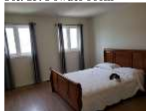
Pic. 19: Master bedroom