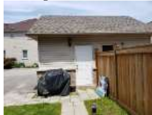
Pic. 6: Garage