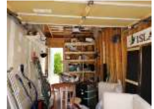
Pic. 8: Garage