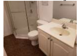
Pic. 28: Basement bath