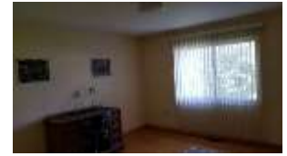
Pic. 12: Bed 5