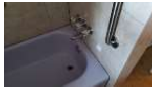
Pic. 14: 2nd floor bath