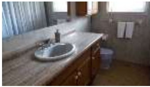
Pic. 13: 2nd floor bath