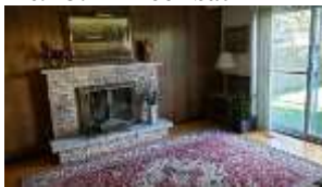
Pic. 17: Family room