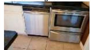
Pic. 20: Kitchen