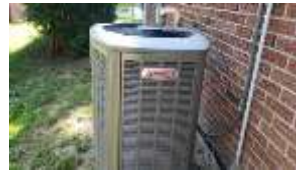
Pic. 3: AC unit 2013