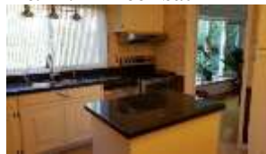
Pic. 18: Kitchen