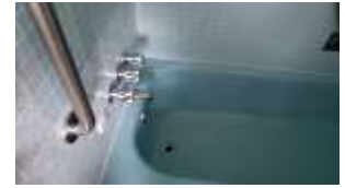
Pic. 8: Master bath