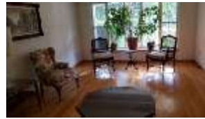
Pic. 15: Living room