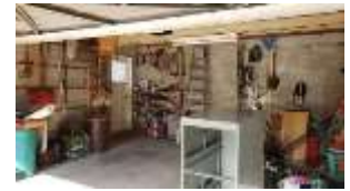
Pic. 4: Garage