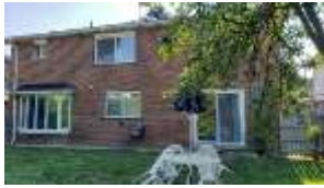
Pic. 5: Back view