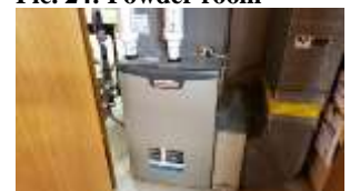
Pic. 28: Gas furnace 2013