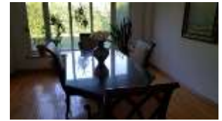
Pic. 16: Dining room