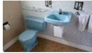
Pic. 7: Master bath