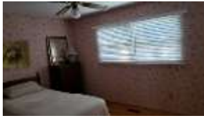
Pic. 9: Bed 2