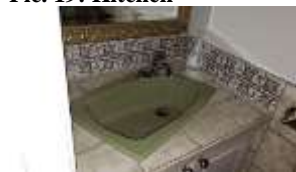
Pic. 23: Powder room