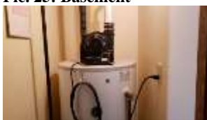
Pic. 29: Hot water tank 2011