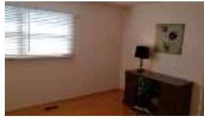
Pic. 10: Bed 3