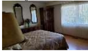
Pic. 6: Master bedroom