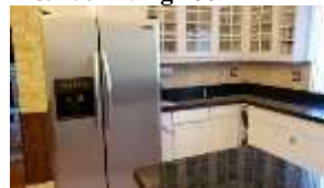
Pic. 19: Kitchen